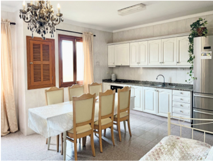
Additional live-in kitchen