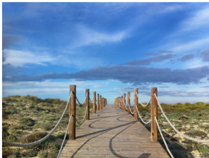
Wooden path leading to the sea