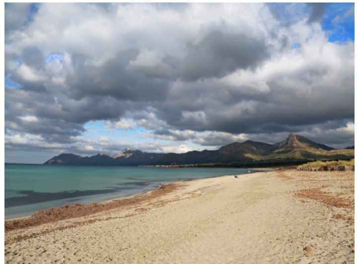
The beach nearby