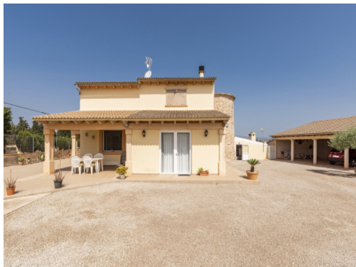
Exterior view, outdoor area and carport