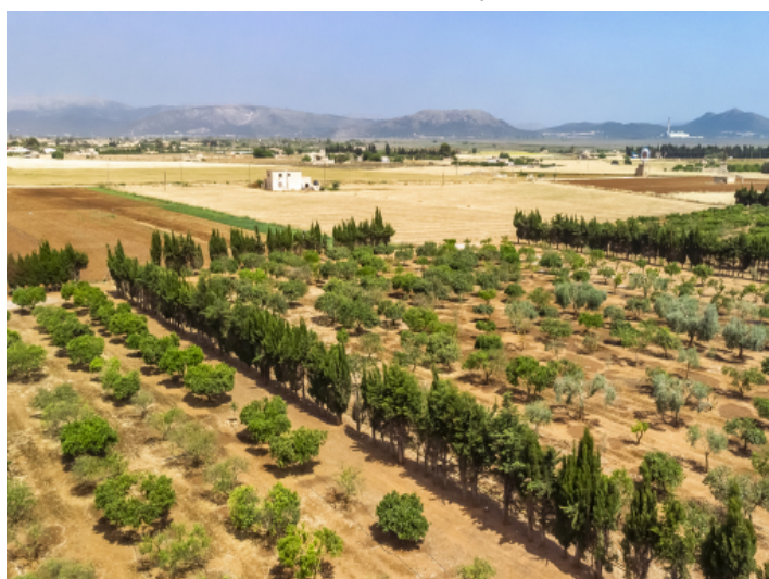
View over the plot