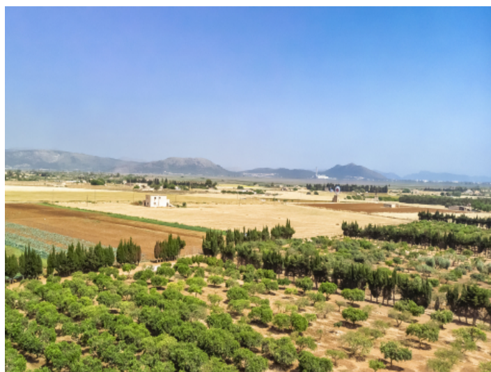
Panoramic landscape views