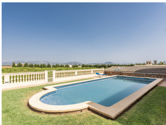
Large, idyllic pool area