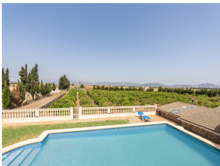
Pool with sweeping views over the landscape