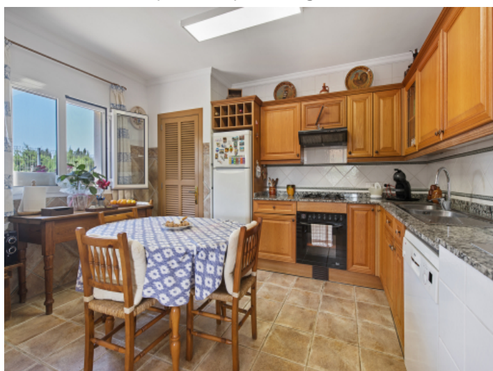
Large kitchen with dining area