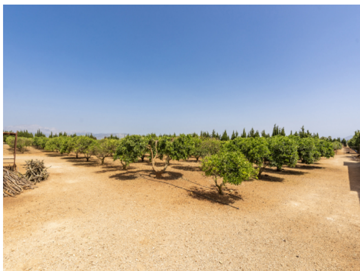
Large plot with fruit trees