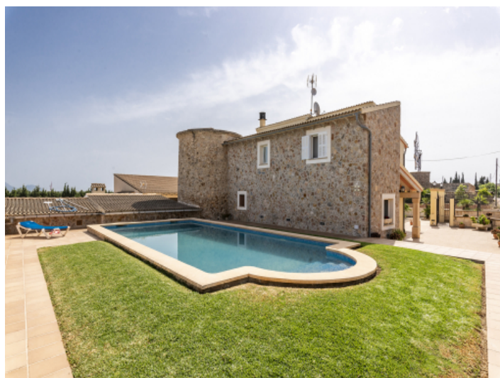
Pool area and view of the finca