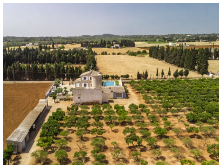
Exterior view with plot