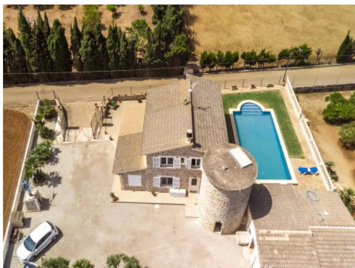
View of the property from above