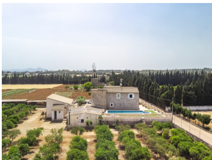
Exterior view with plot