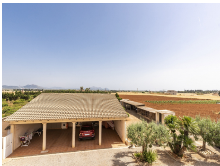
View to the carport