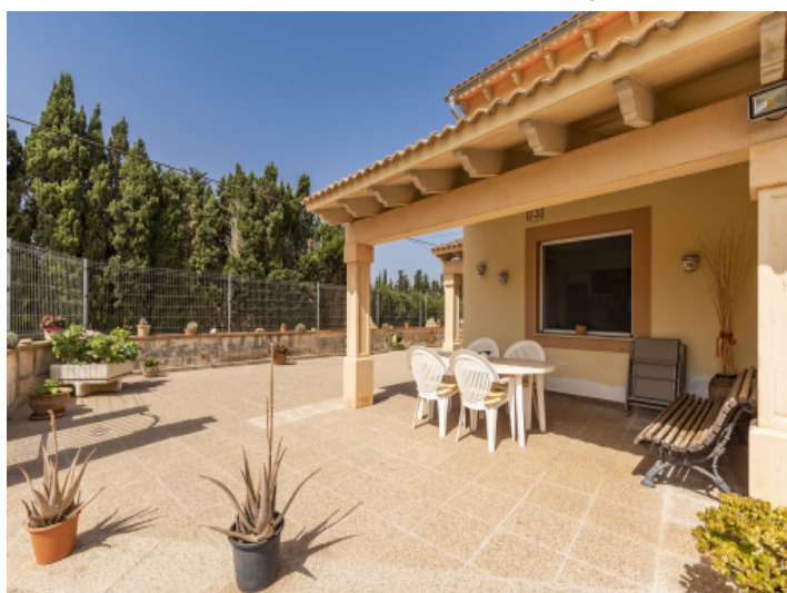
Partly covered terrace