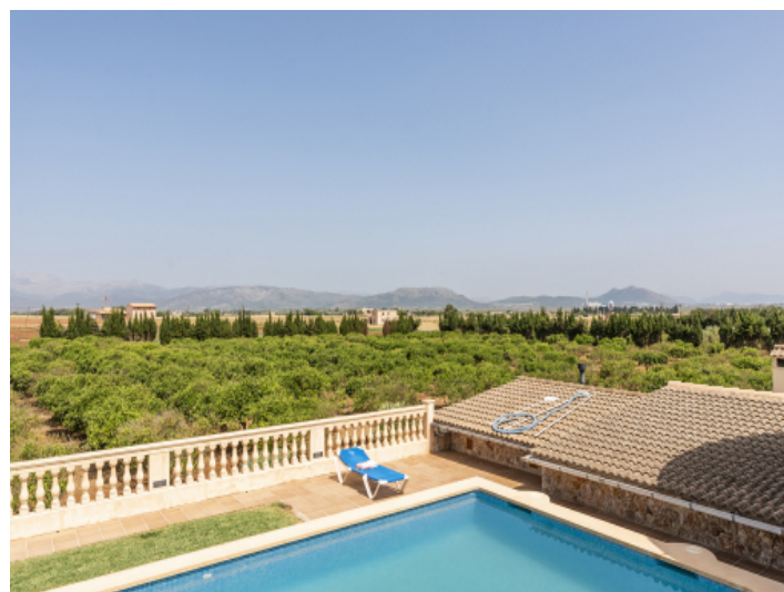
Pool and view