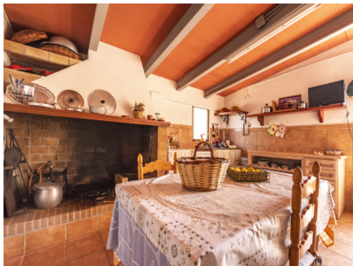
Rustic bbq and kitchen terrace