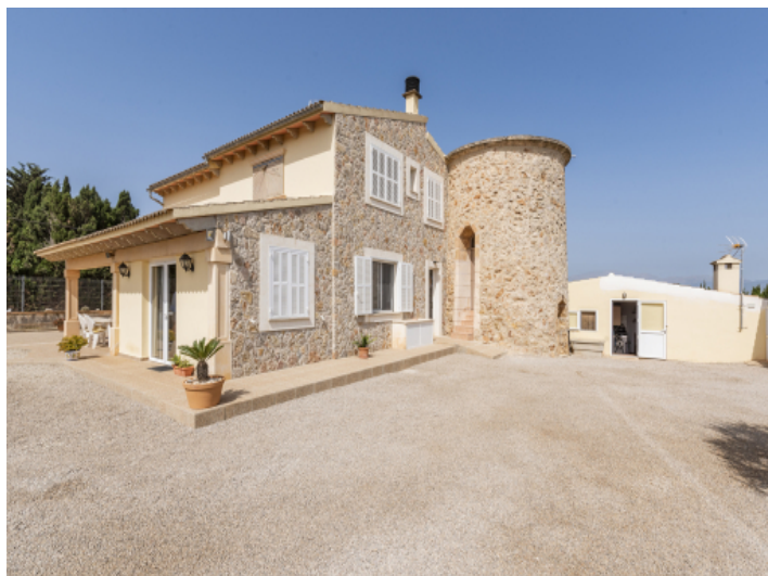
View of the finca with tower