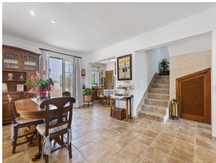
Spacious, open dining area