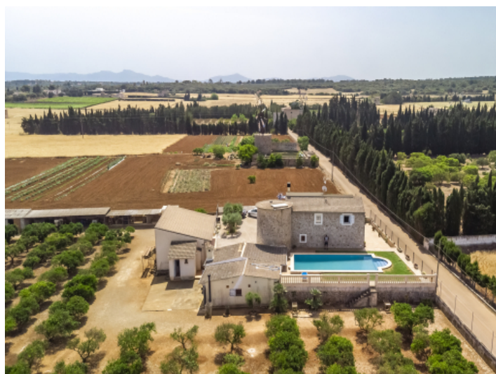
Exterior view with plot