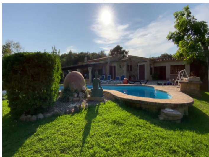
View to the pool