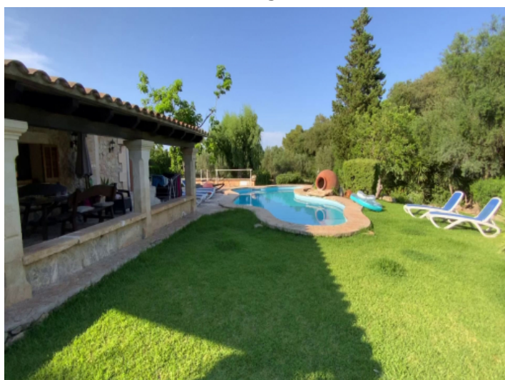
With holiday rental license