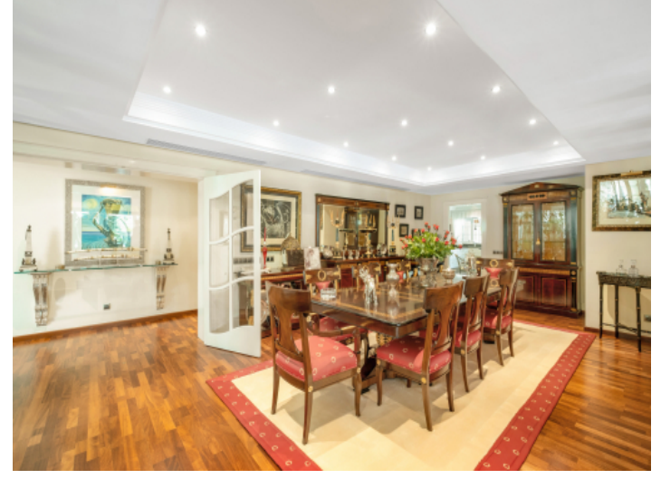
Further dining area