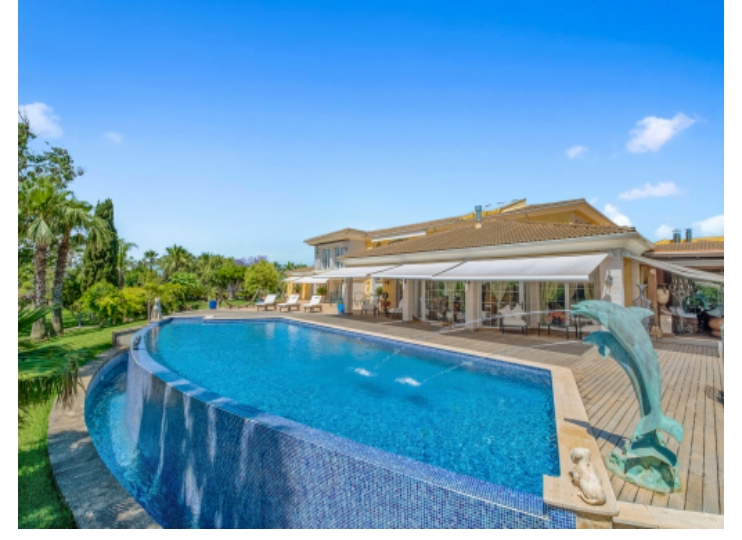
Luxurious property in a prime location with separate annex