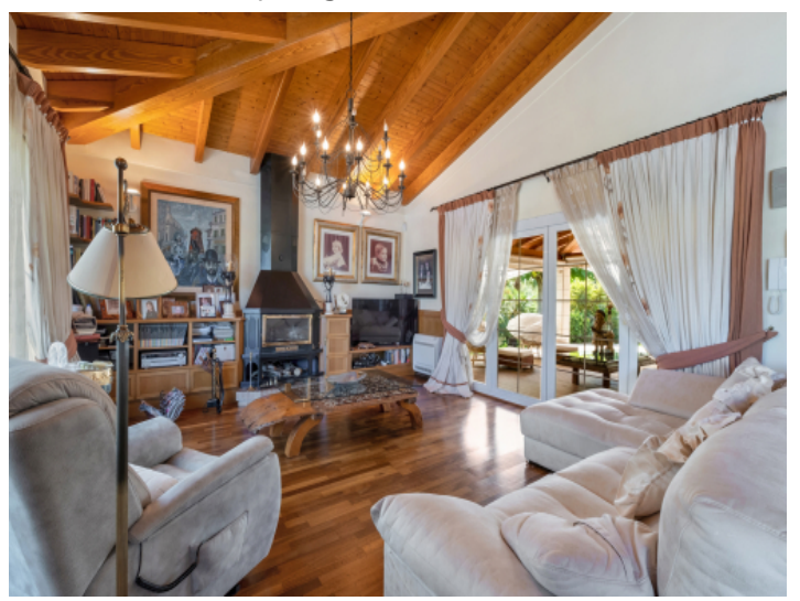
On of 3 living areas