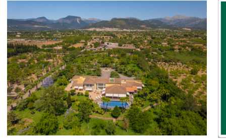
Inca search for property MAL-118128