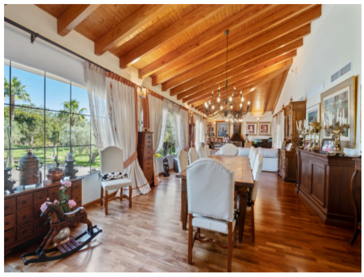
Dining area with beautiful view to the garden

PORTA MALLORQUINA • C./ COLOM 20 2°, 07001 PALMA, SPAIN TEL.: +34 971 698 242 • INFO@PORTAMALLORQUINA.COM • WWW.PORTAMALLORQUINA.COM