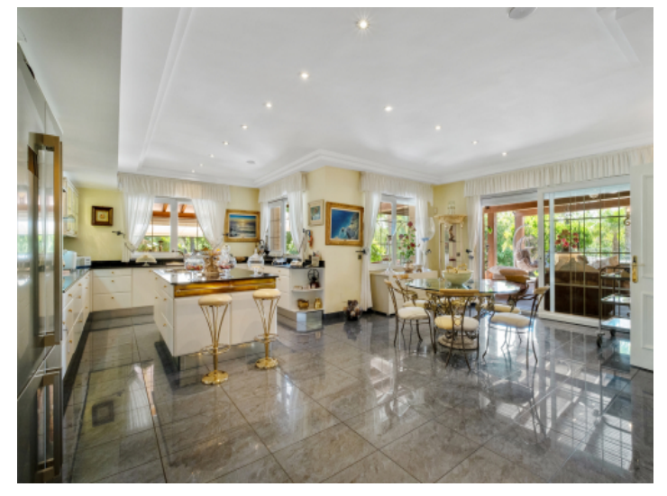
Large kitchen with terrace access