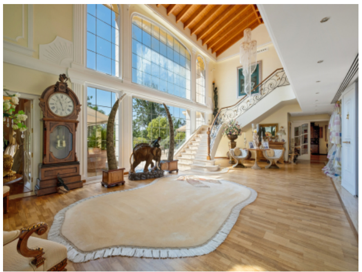
Large double-height entrance hall