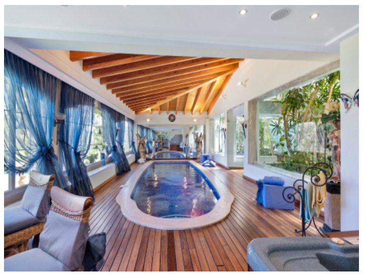
Luxurious indoor pool