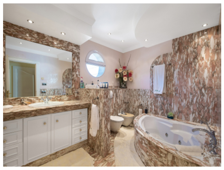
One of 6 bathrooms