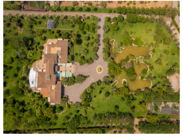
Property with 50.000 sqm park with lakes

PORTA MALLORQUINA • C./ COLOM 20 2°, 07001 PALMA, SPAIN TEL.: +34 971 698 242 • INFO@PORTAMALLORQUINA.COM • WWW.PORTAMALLORQUINA.COM