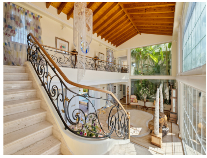
View to the inner garden and stairs