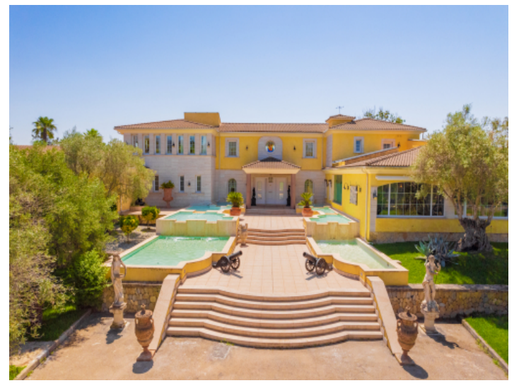
Access to the property