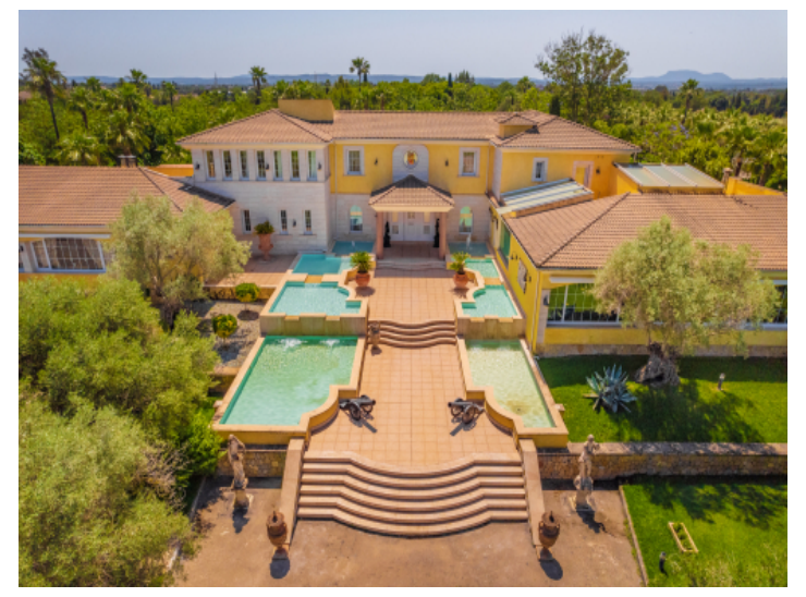
Imposing access to the finca