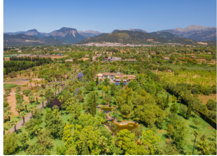
Bird's eye view of the property with large garden