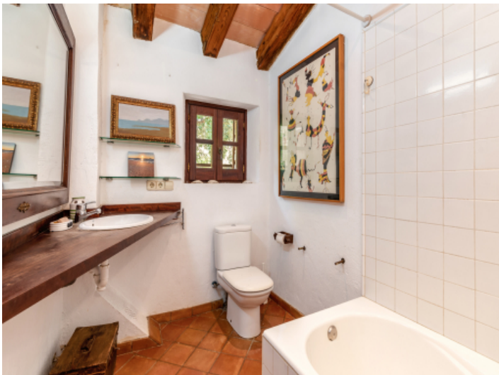
One of in total 4 bathrooms