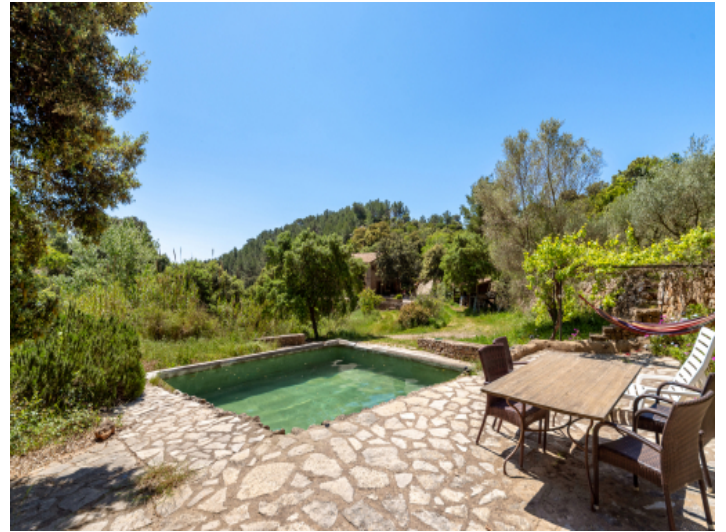
Possible pool area with lots of privacy