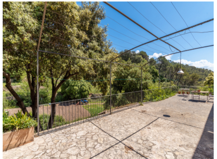
Terrace with wonderful views of the surroundings