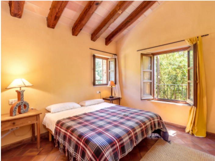
Double bedroom in the second living unit