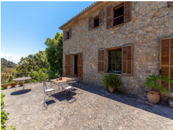
Large, mediterranean terrace