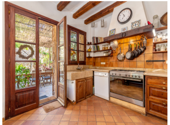
Lovely country house kitchen with terrace access