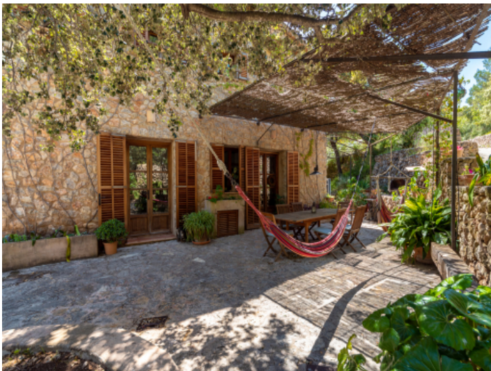
Enchanting terrace with natural shade