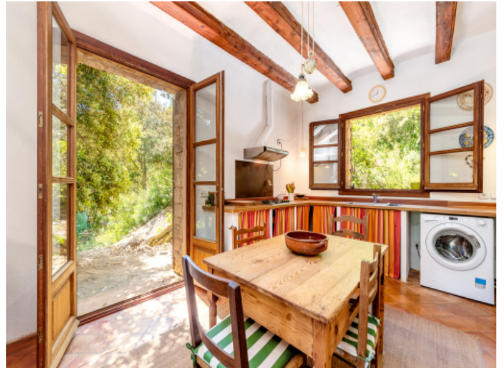
Second kitchen with terrace access