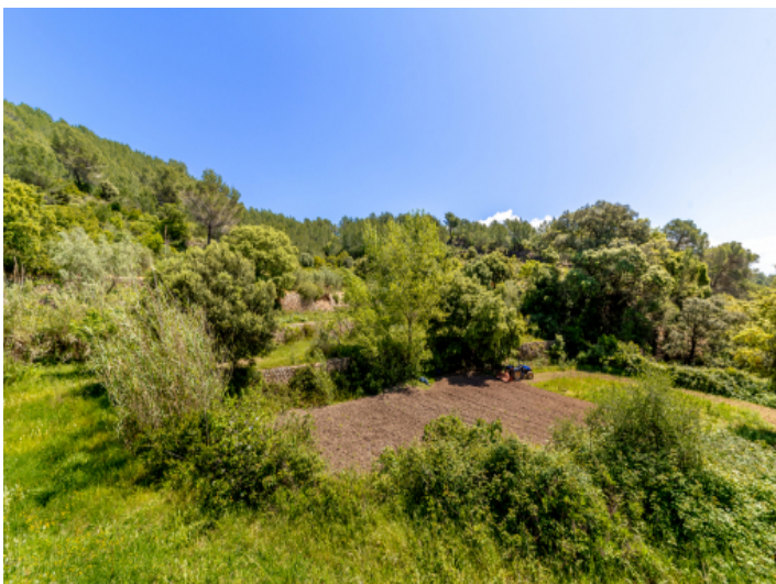
View to the surrounding nature