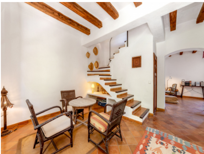
Lovely seating area and stairs to the upper floor