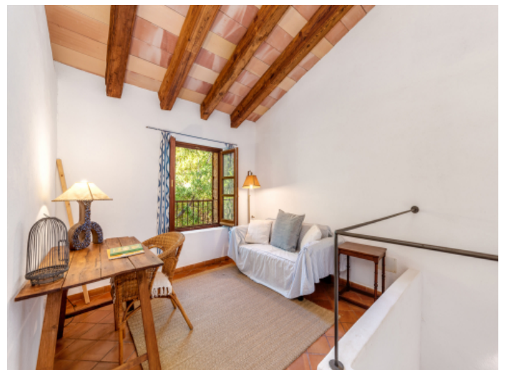
Charming lounge area on the upper floor