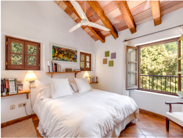
Beautiful double bedroom