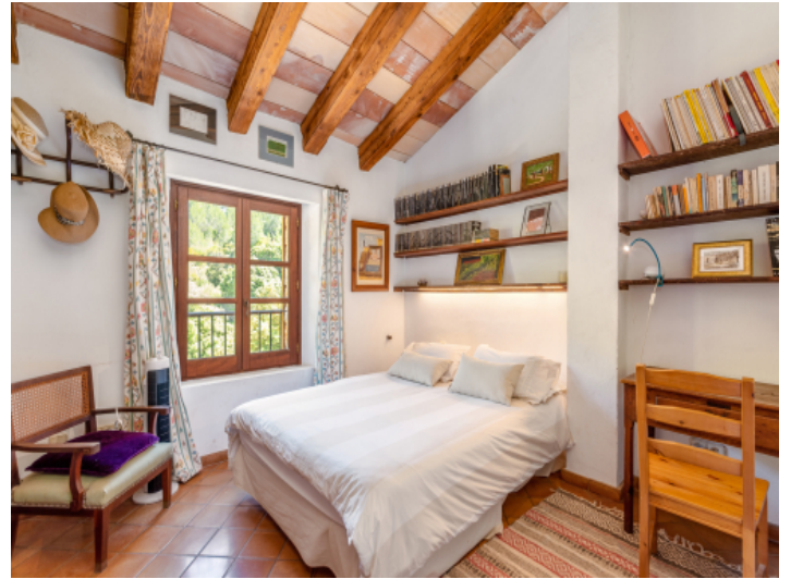
One of in total 6 bedrooms