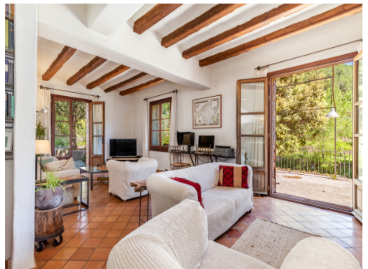
Cosy living area with terraces access from 2 sides