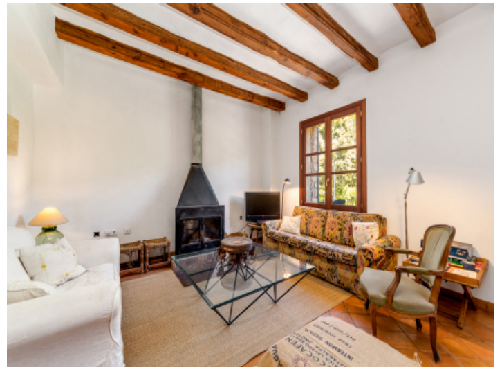
Living area in the second living unit