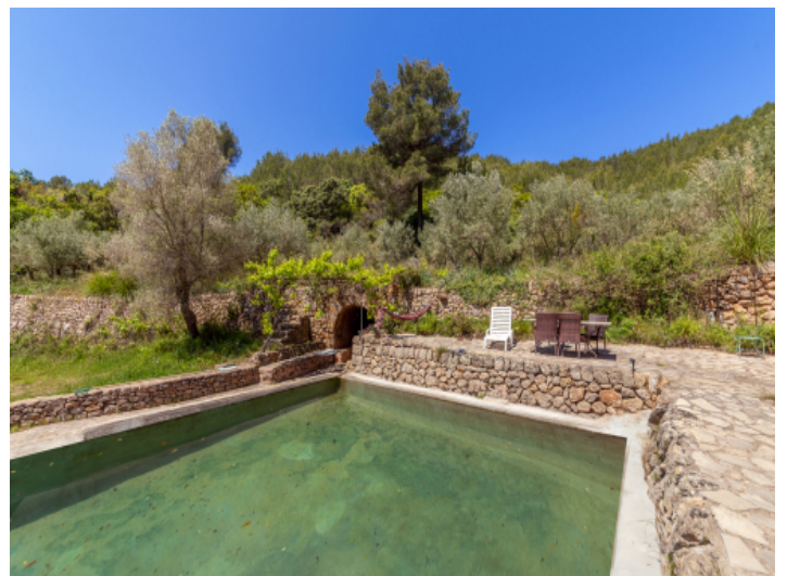
Water cistern used as a pool