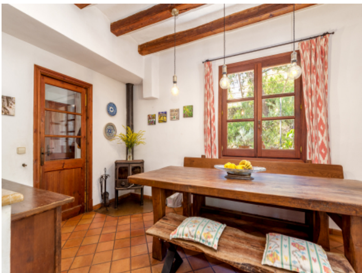
Rustic dining area with oven