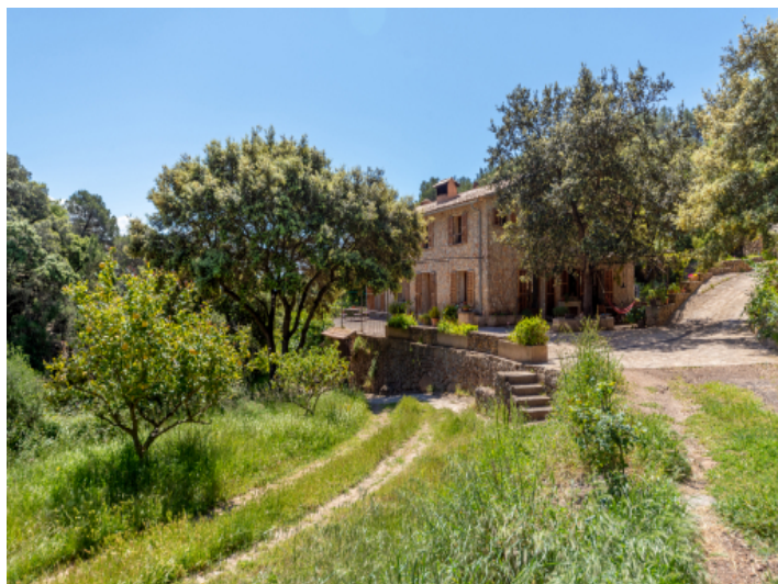
Exterior view of the idyllic finca