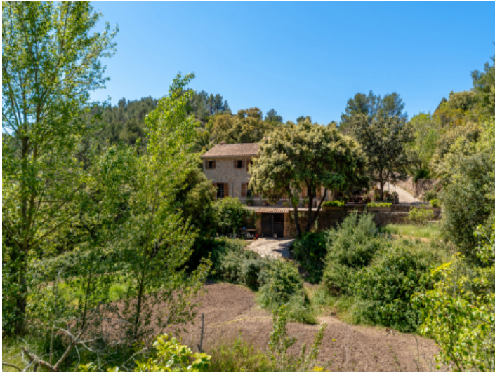
Wonderful finca with great privacy and 2 living units in the