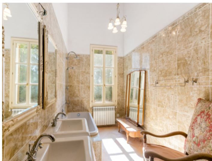
Sunny bathroom with bathtub