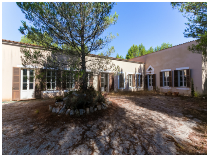
Another perspective of the house