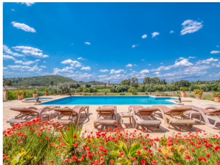
Idyllic pool area with wonderful views to the town