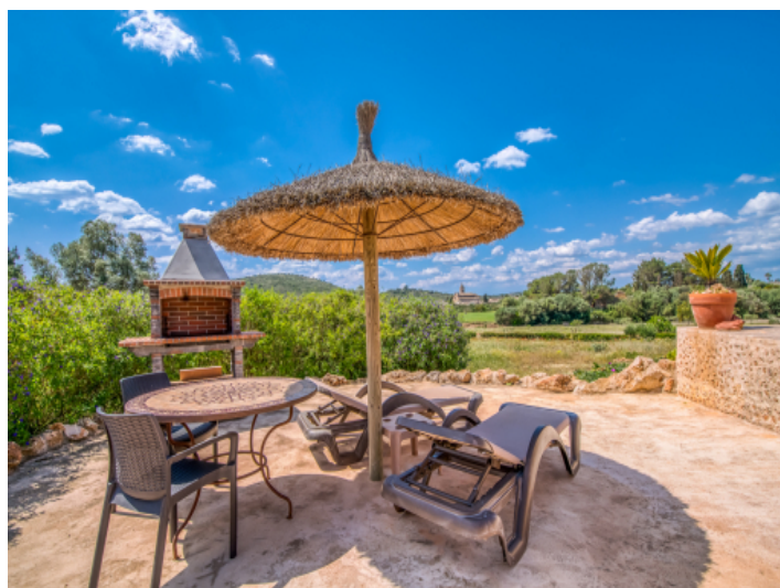
Wonderful bbq terrace