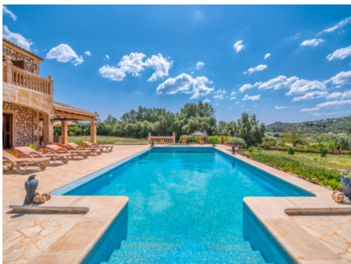
Lovely pool area