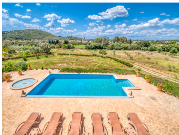
View as far as the town