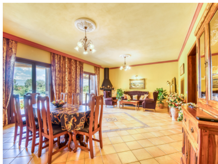
Spacious dining area