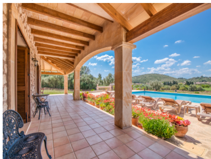
Beautiful covered terrace