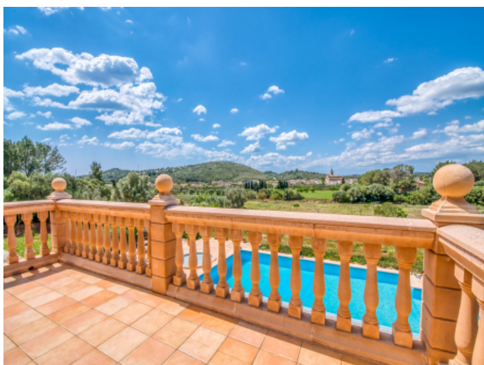
Upper terrace with a view