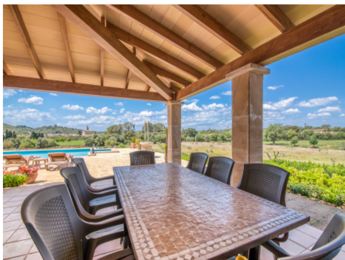
Terrace with wonderful views