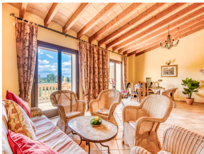
Upper floor with living area