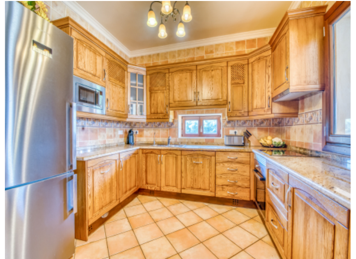
Kitchen with ample space