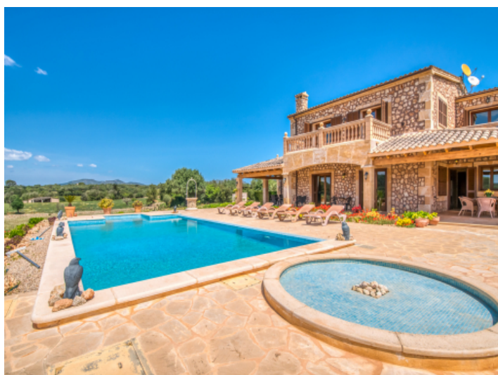
Generous pool area