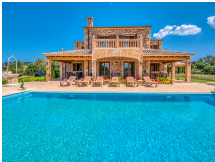
Finca with dreamlike views of the town in Son Carrio