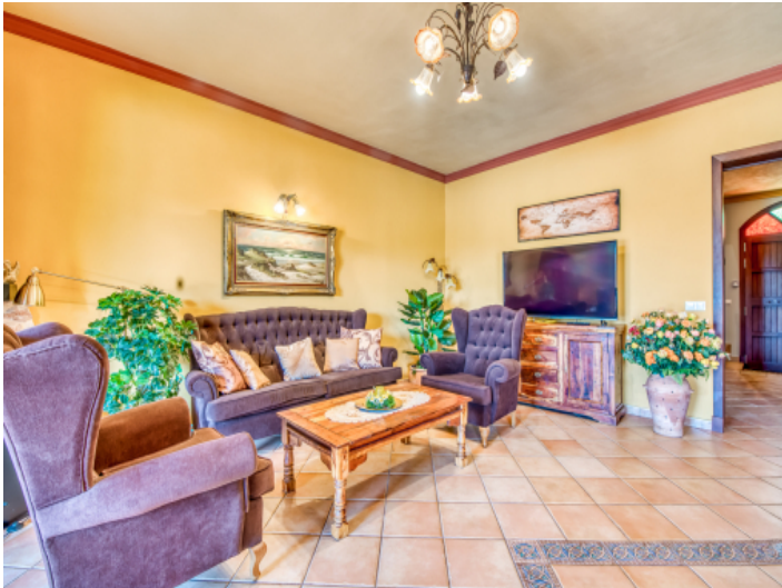
Comfortable living area