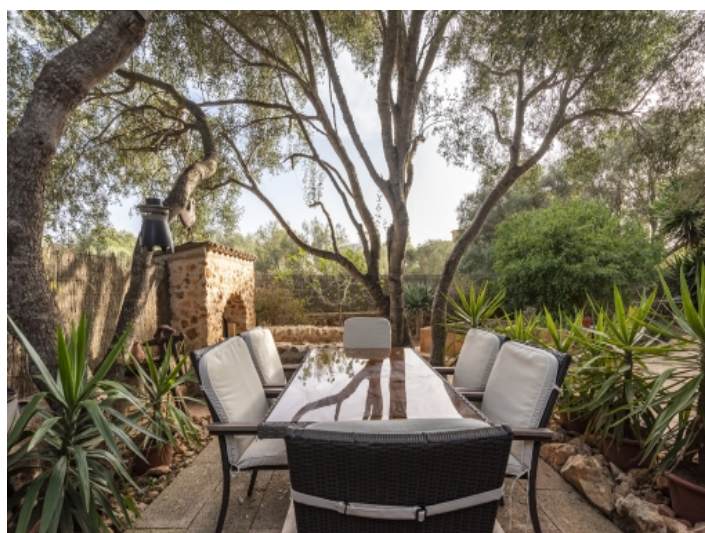
Terrace and garden