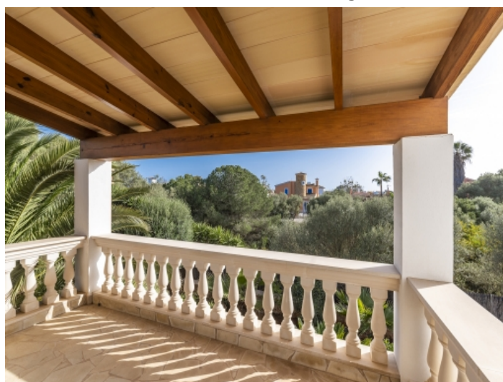
Covered upper terrace