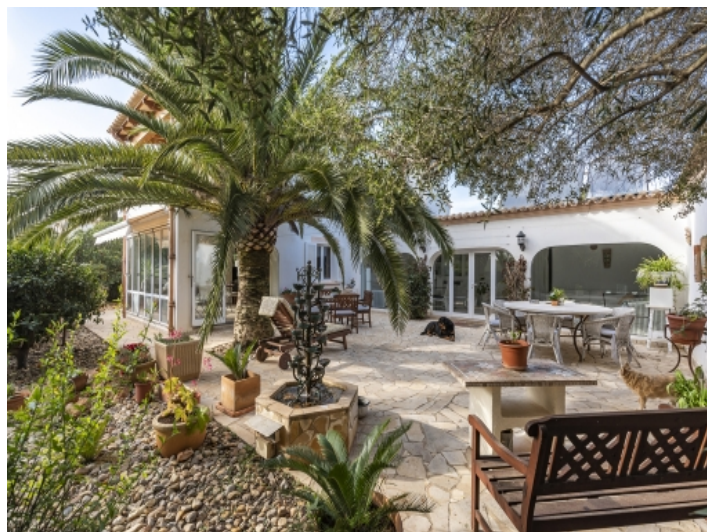
Lovely terrace and garden