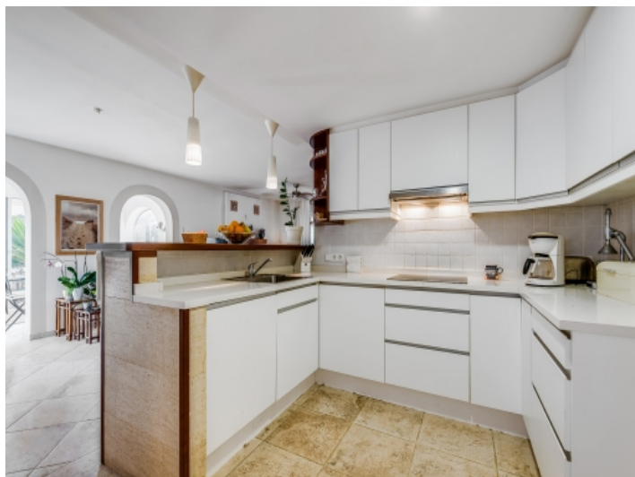
Open kitchen in white