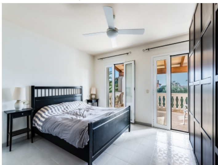
Bedroom with terrace