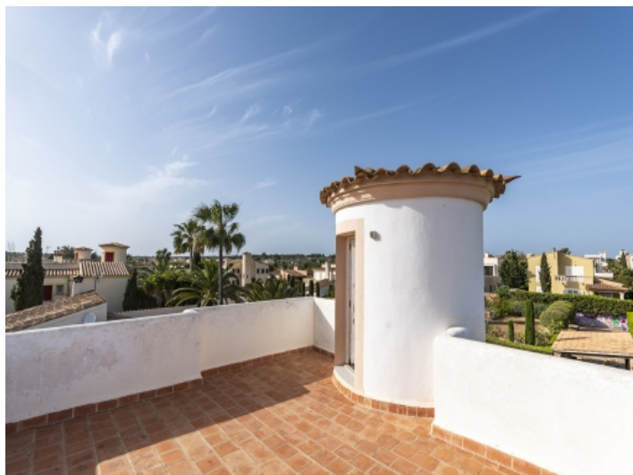
Roof terrace with sweeping views