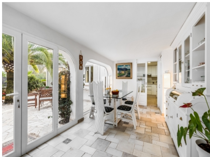
Dining area with terrace access