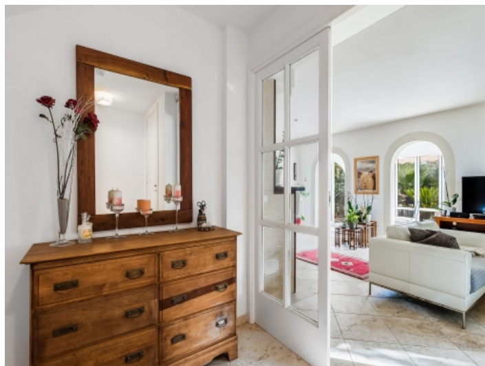
Corridor and view to the living area