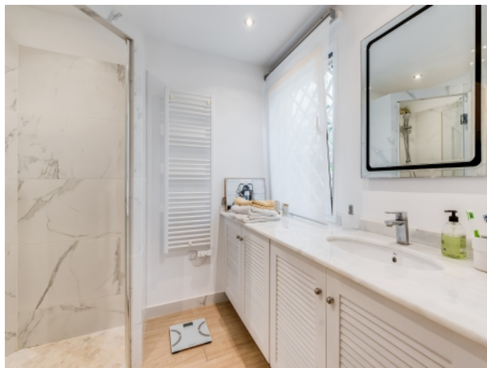
Bright shower bathroom