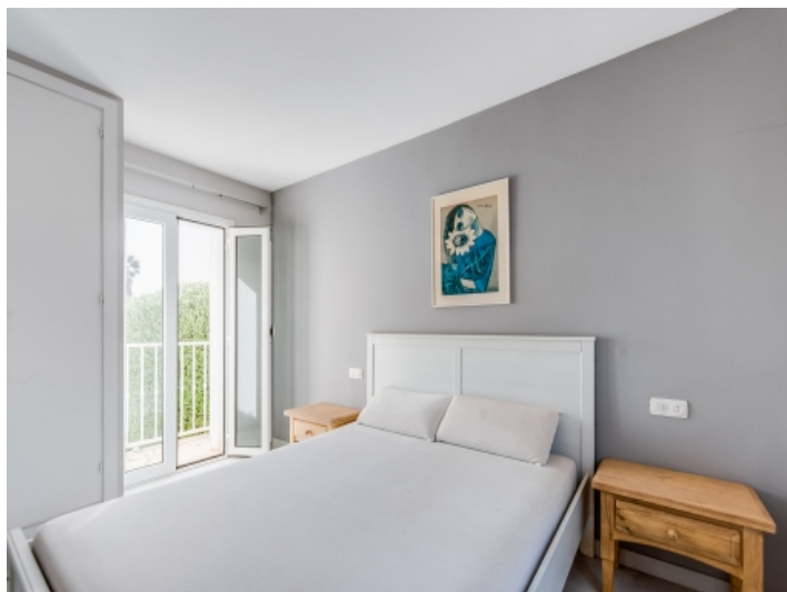
Bedroom with balcony