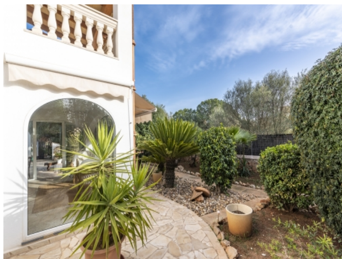
Terrace and garden