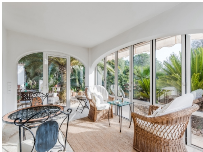
Lightflooded winter garden