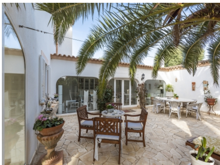
Terrace and garden