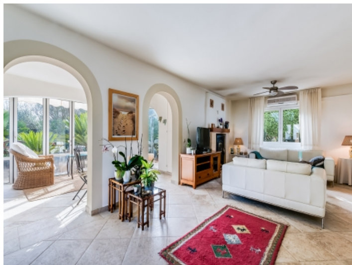
Living area with access to the wintergarden