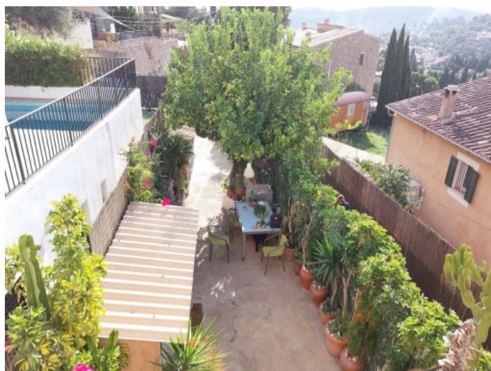
View from the upper floor