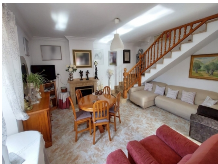
View of the living area