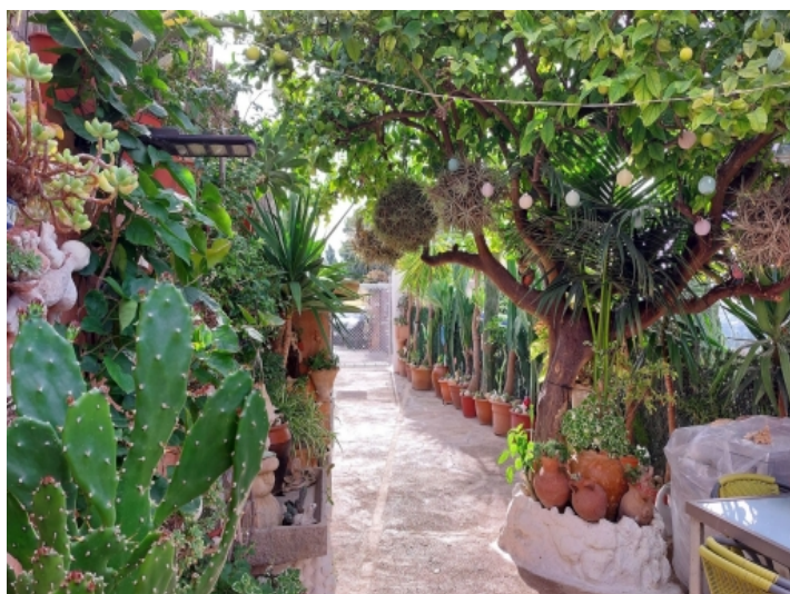
Entrance and terrace