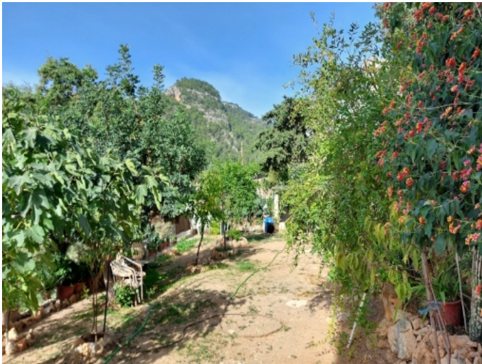
View of the garden