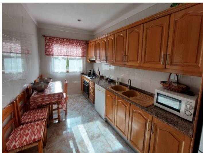
Rustic, wooden kitchen