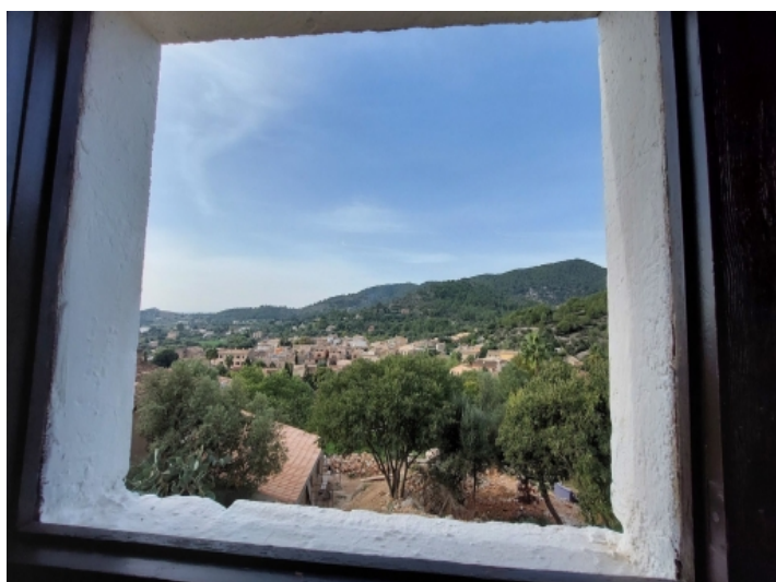
View into the green