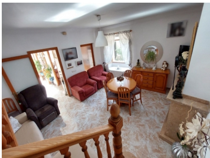
View of the living area