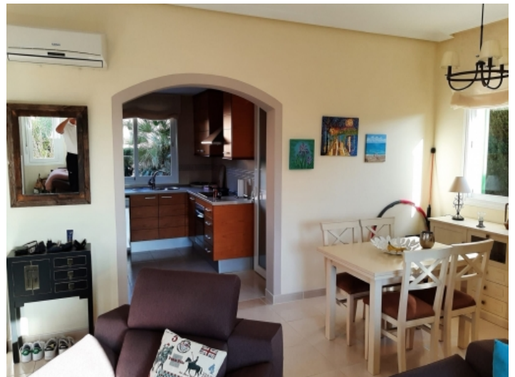
View to the kitchen