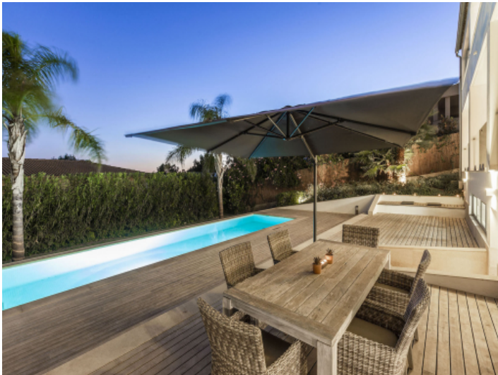
Terrace by night