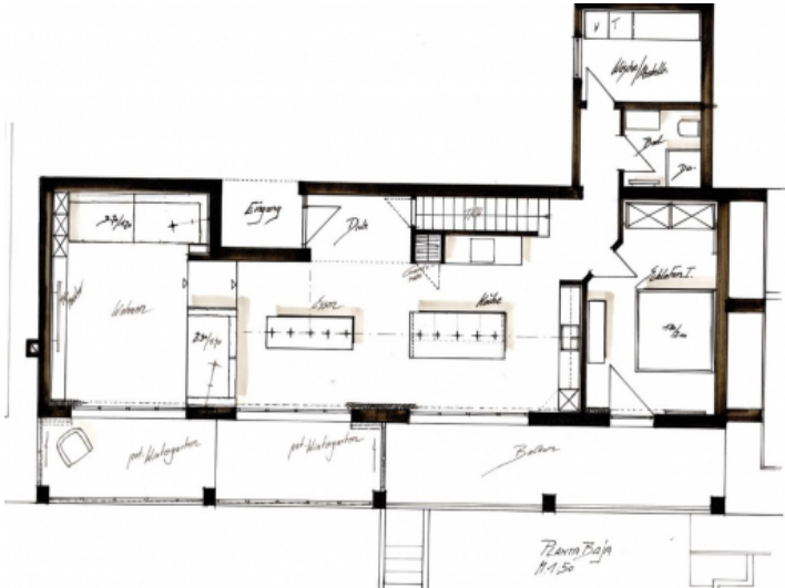
Costa d'en Blanes 4Schlafzimmer Zentralheizung Villa Kaufen