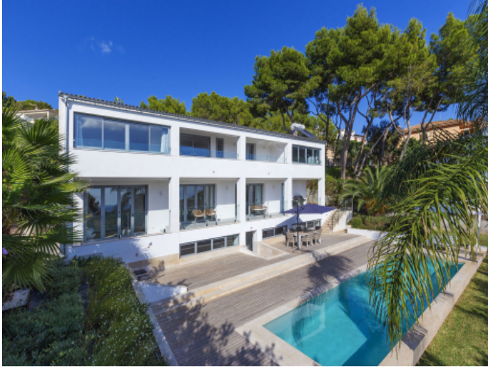
Modern villa with sea views in Costa d'en Blanes