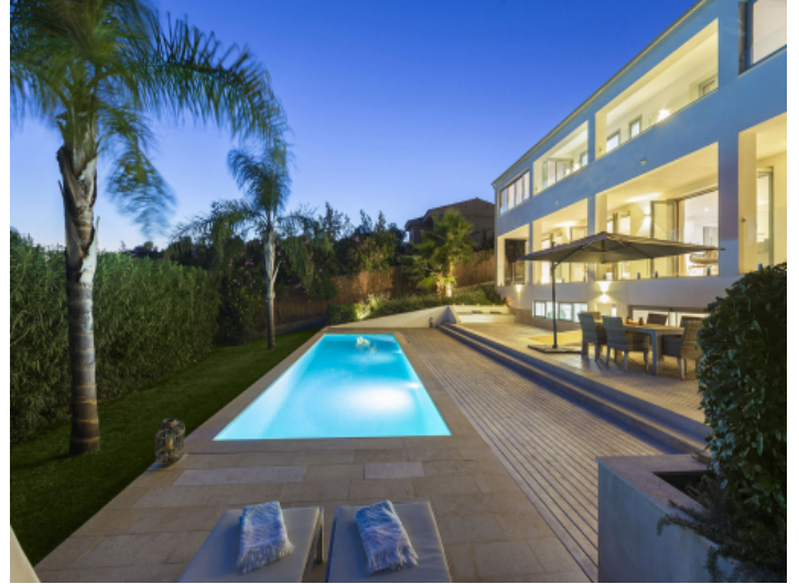
Romantic pool area by night