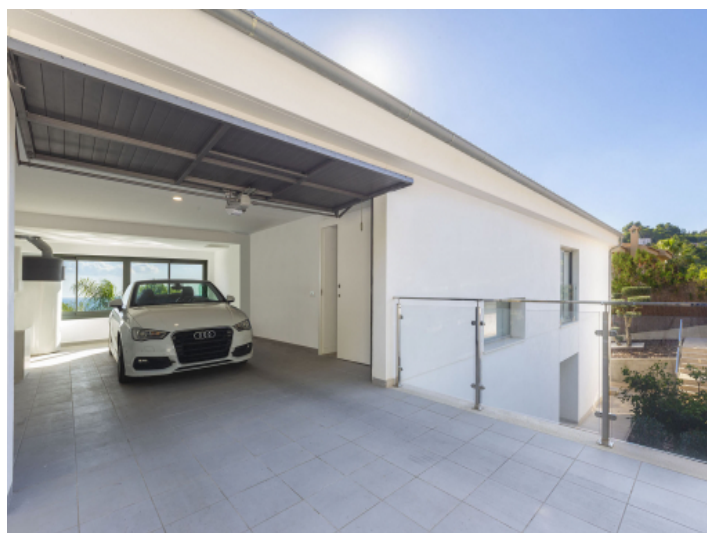
Garage of the villa