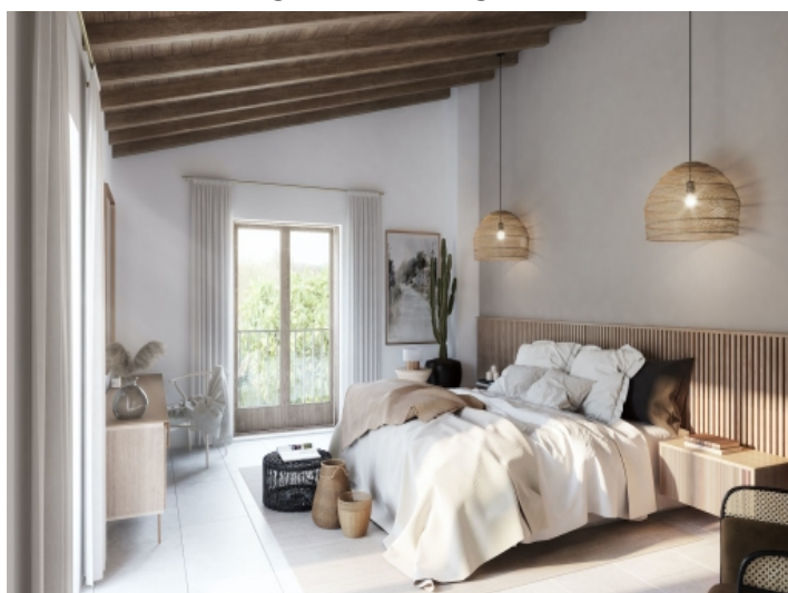
Cozy double bedroom