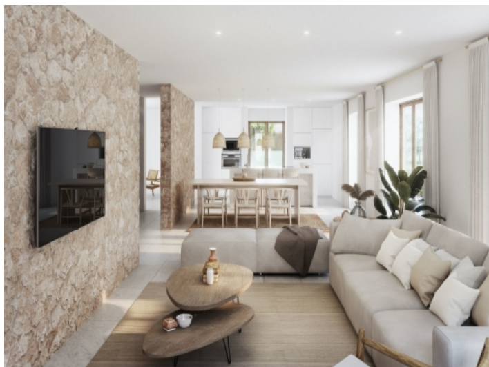
Light flooded living area