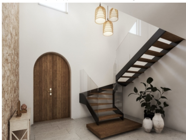
Noble entrance area with natural stone wall