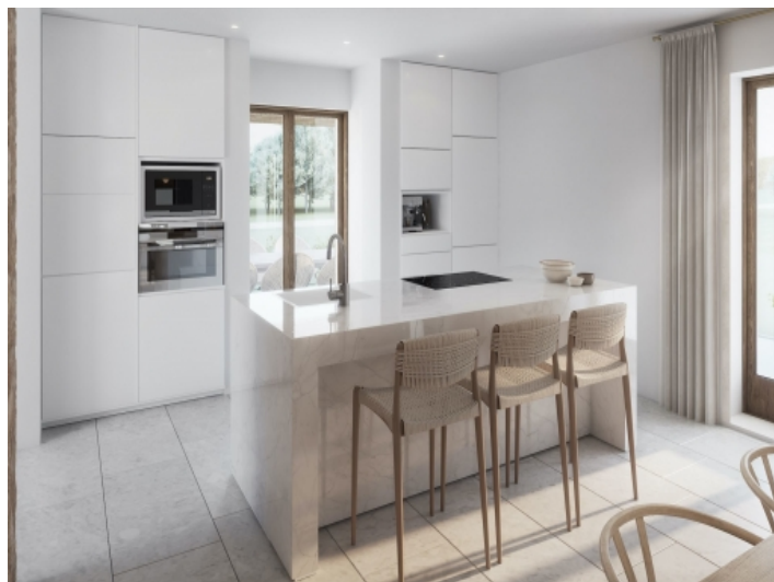
Fully equipped kitchen with coking island