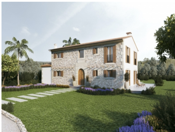
Exterior view of the finca