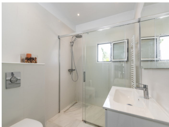
Shower bathroom with window