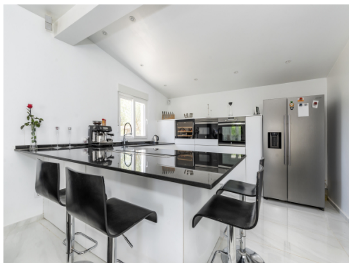
Modern kitchen in white