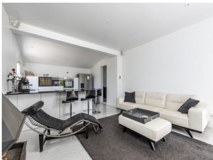
Bright, open living area