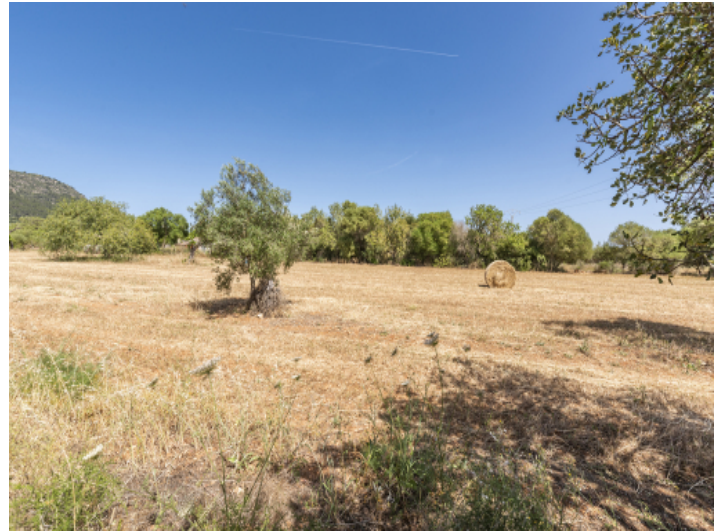
View over the plot