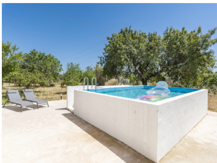
Pool and sun terrace