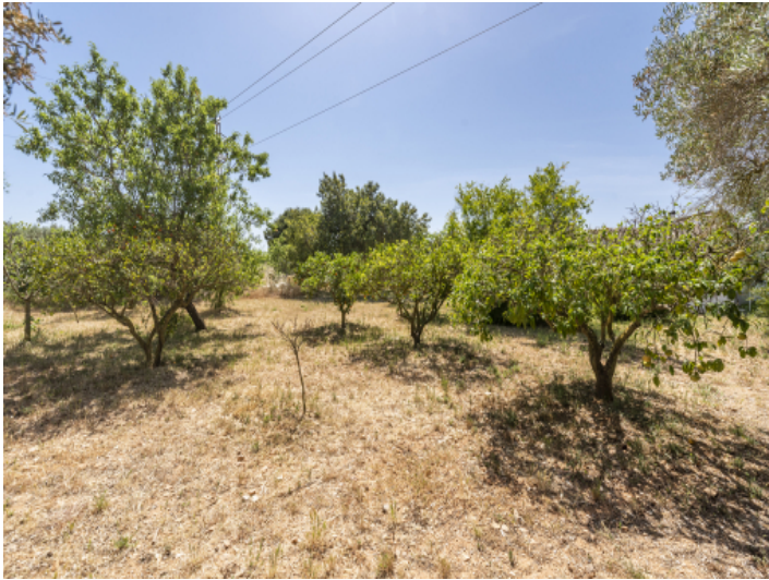
Plot with various trees