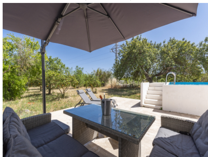
Lounge area next to the pool