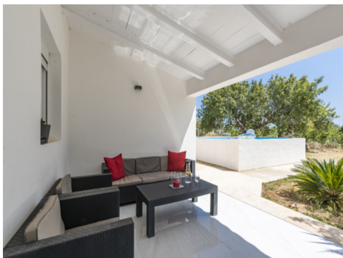
Covered bbq terrace