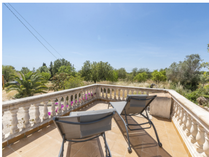
Upper terrace with views over the plot