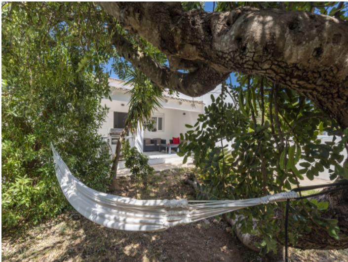
Idyllic garden with natural shade