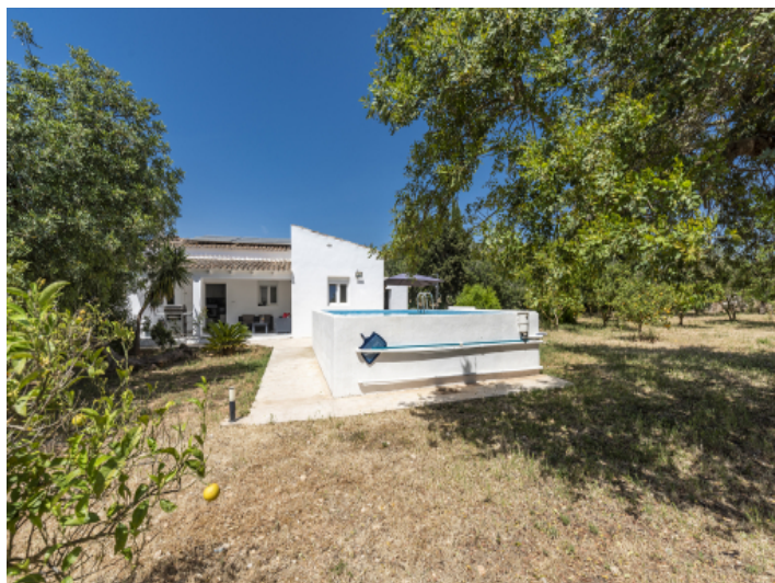
View of the finca with pool