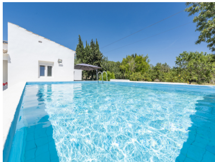
Sunny 6 x 4 metre pool