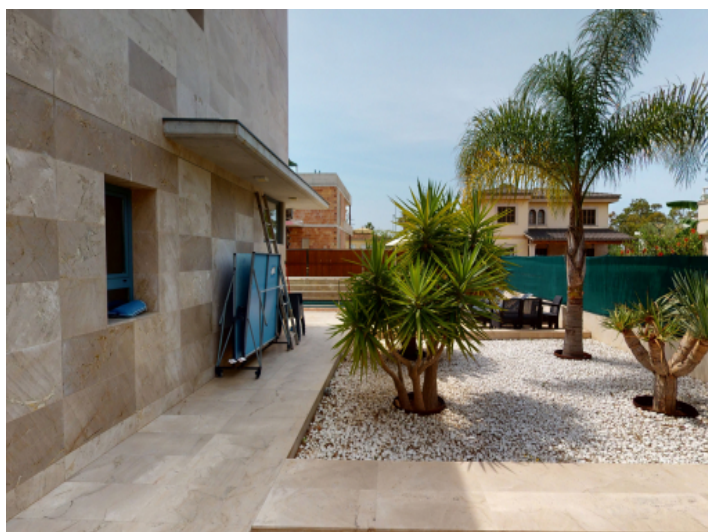
Access and garden