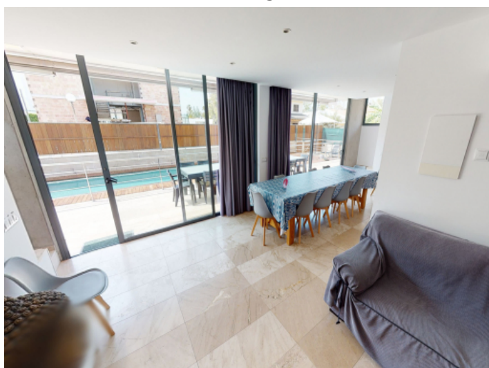
Living and dining area