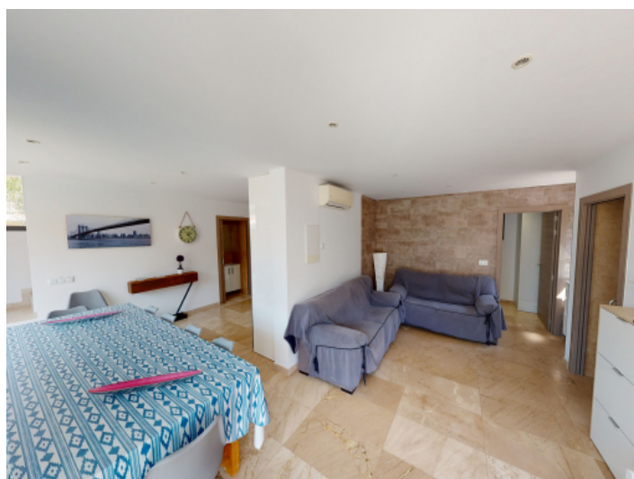
Living and dining area