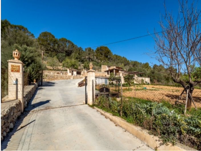
Access to the property