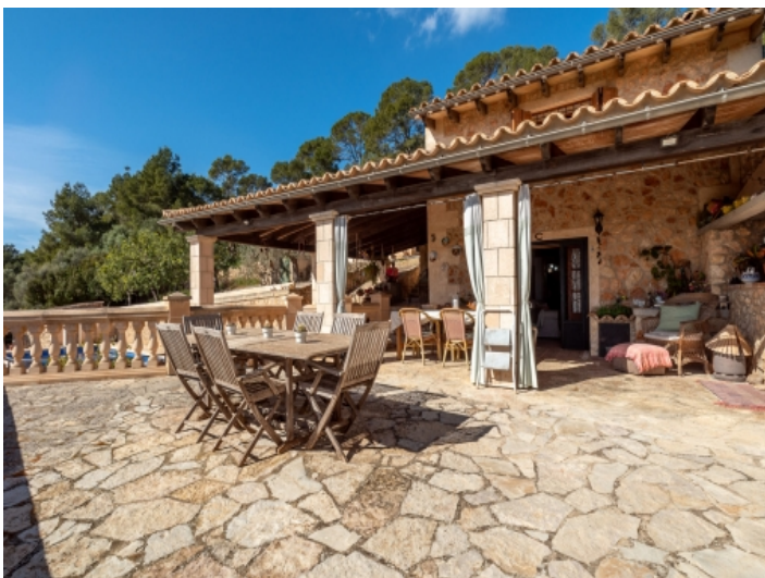
View of the 2 terraces