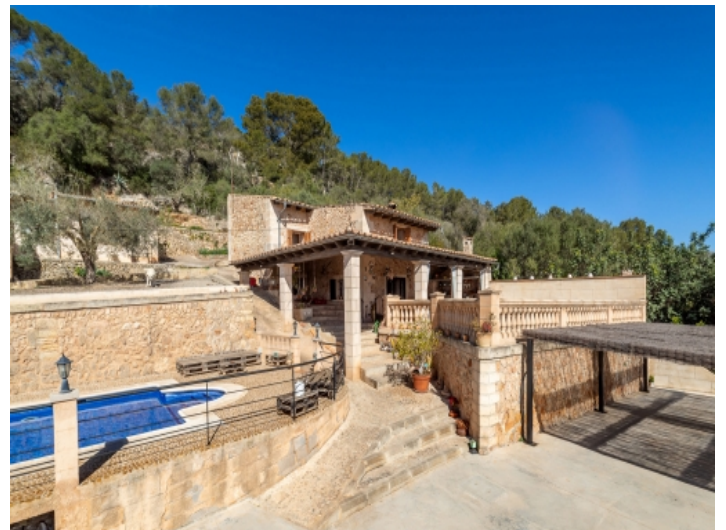
View of the finca with terraces and pool