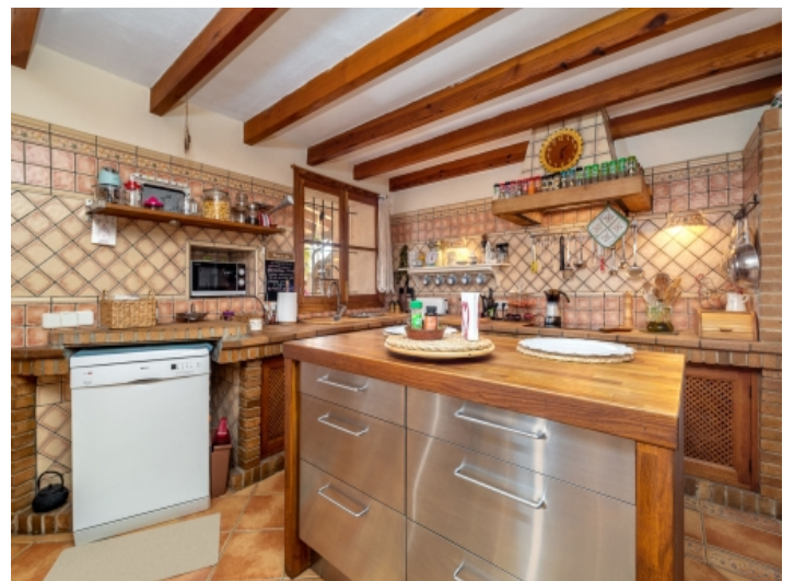
Rustic country house kitchen