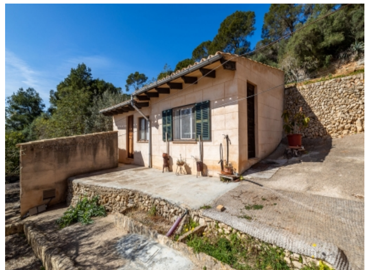
Separate guest house