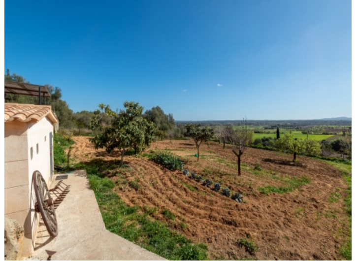
View over the plot