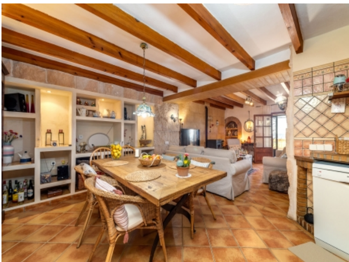
Dining area with open kitchen