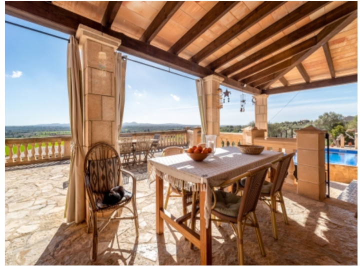
Covered terrace with panorama views