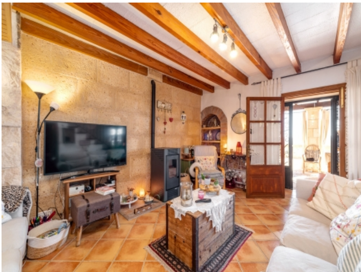
Rustic living area with terrace access