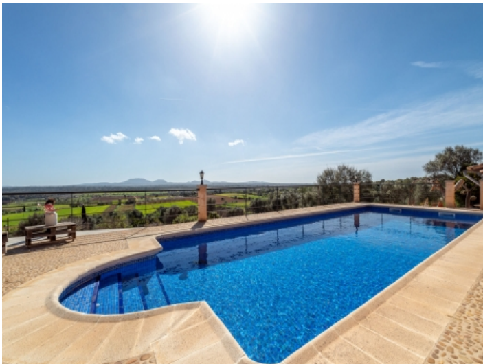
Rustic finca with wonderful sweeping views and pool on the