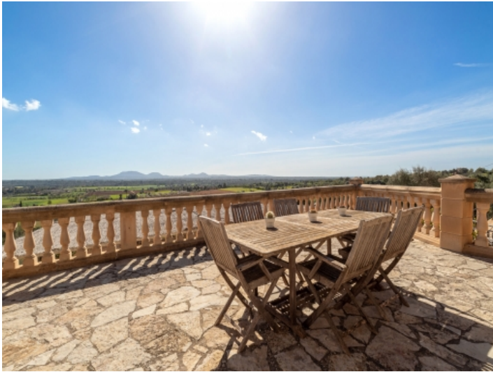
Large terrace with stunning landscape views