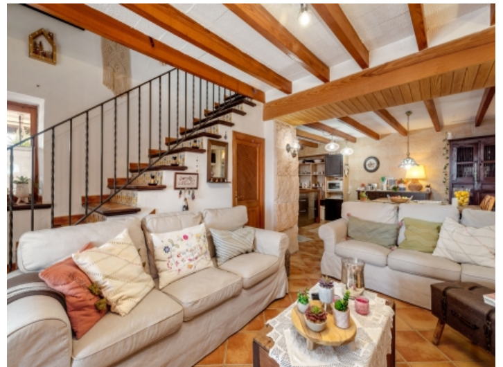
Living area and access to the upper floor