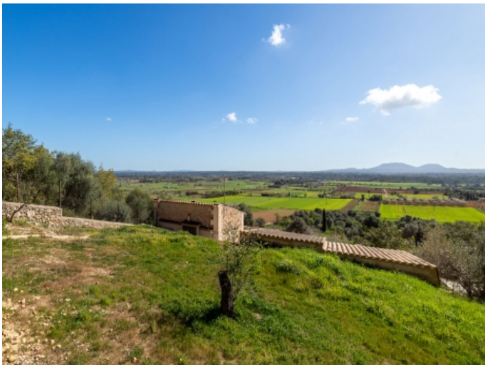
Wonderful landscape views