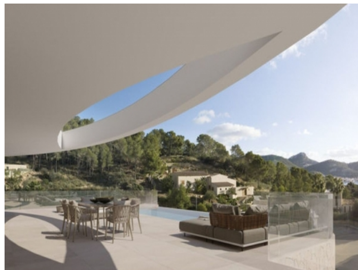
Spacious sunny terrace