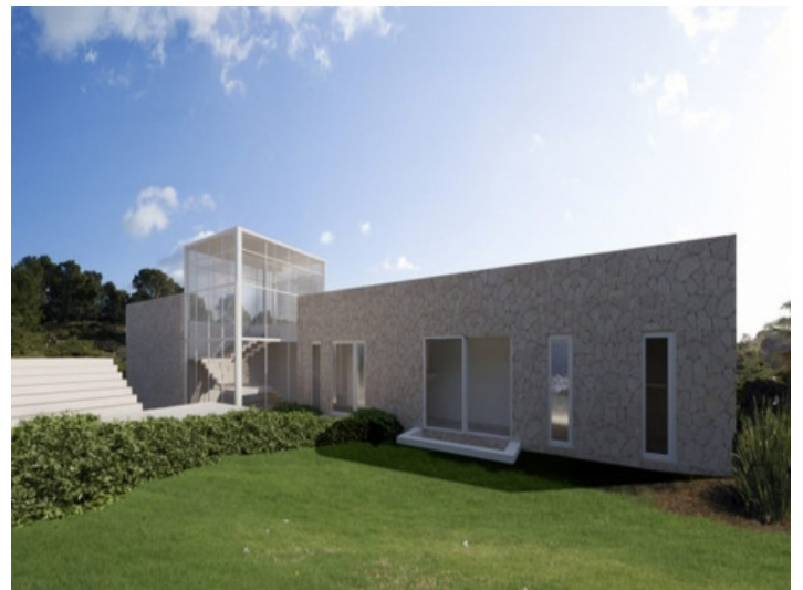
Exterior view of the luxury villa