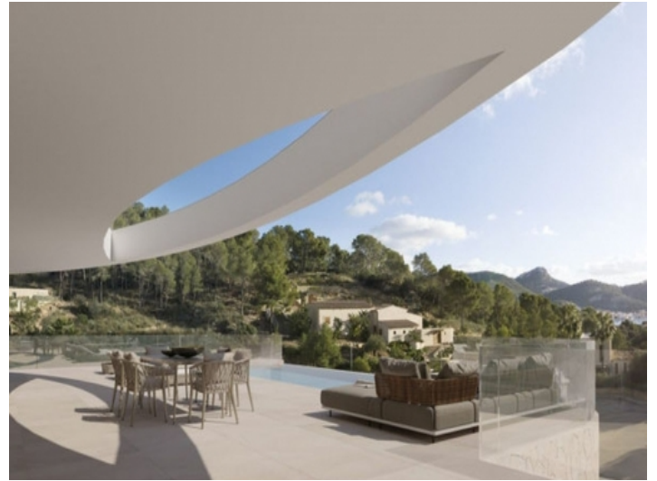
Spacious sunny terrace