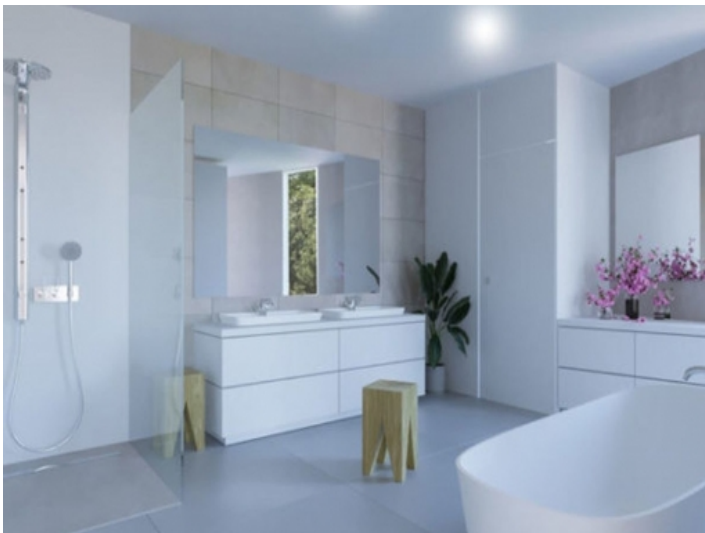
Noble bathroom design