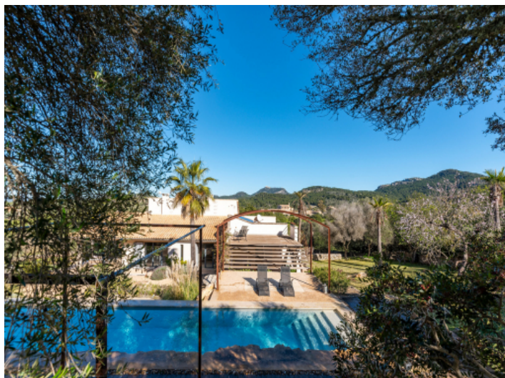
View to the pool and terrace