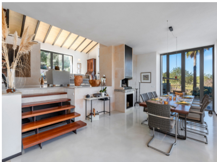
View to the living area