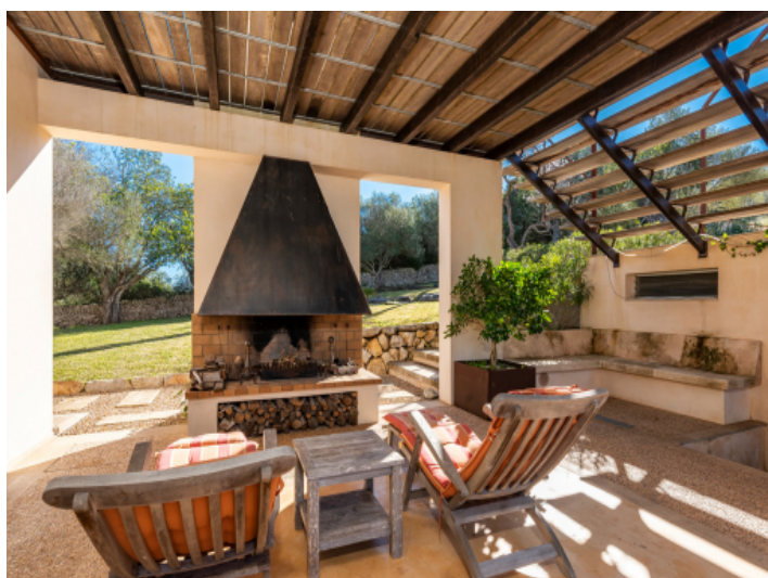
Fantastic chill-out area with fire place