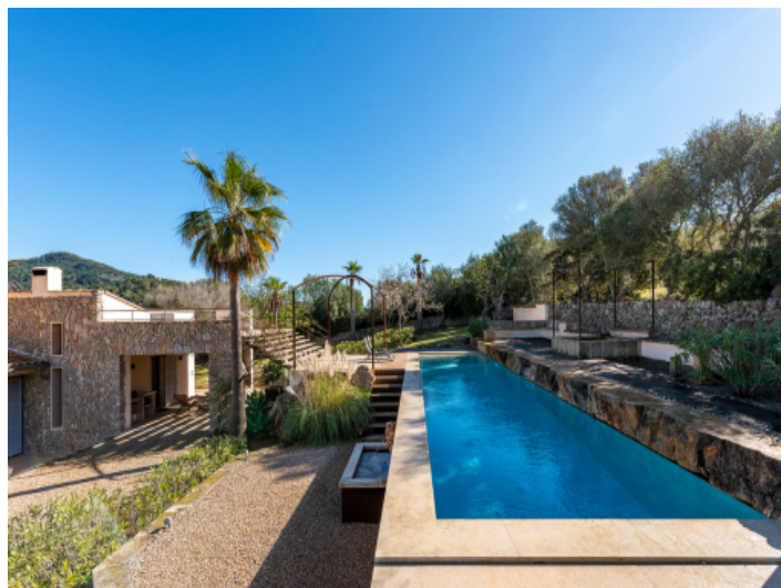
View of the pool