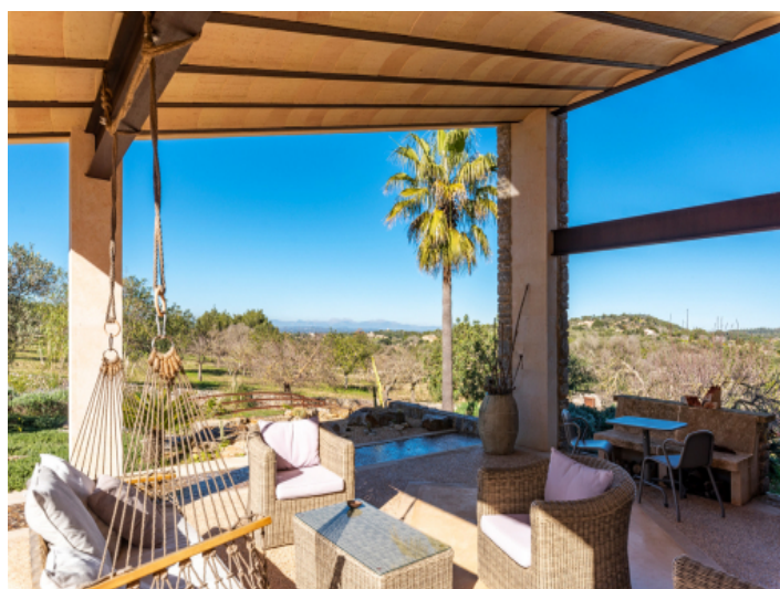
Splendid landscape views