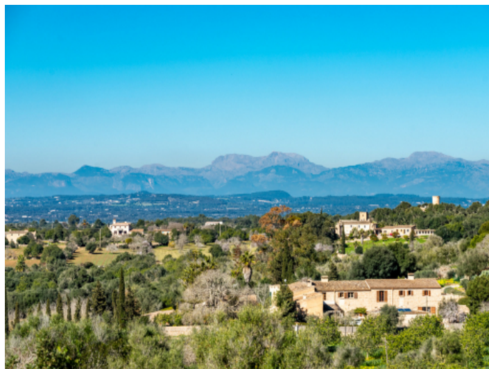
View to the sea