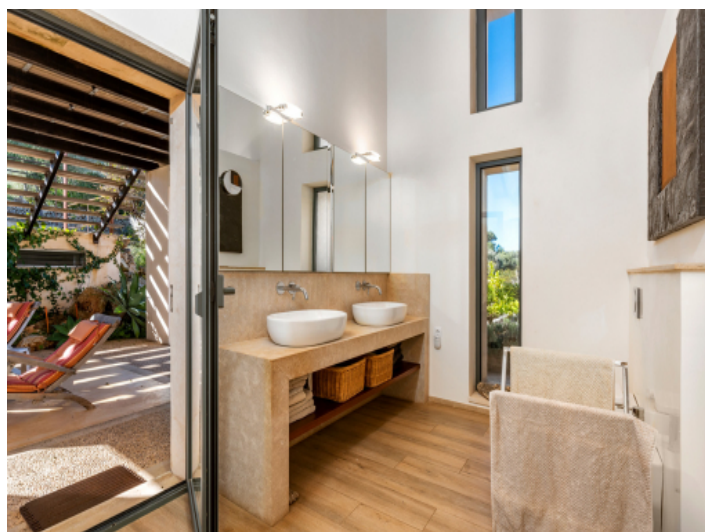
Modern bathroom with access to the terrace