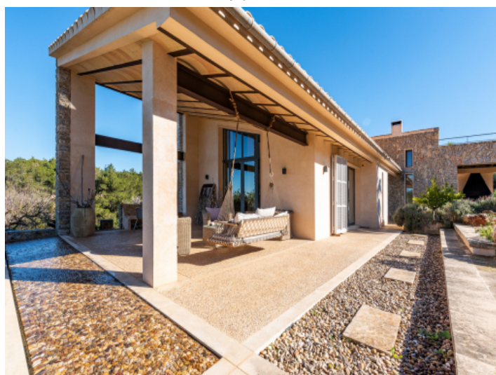
Covered chill out area