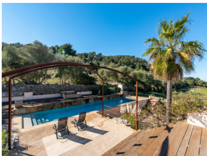
Sunny pool terrace