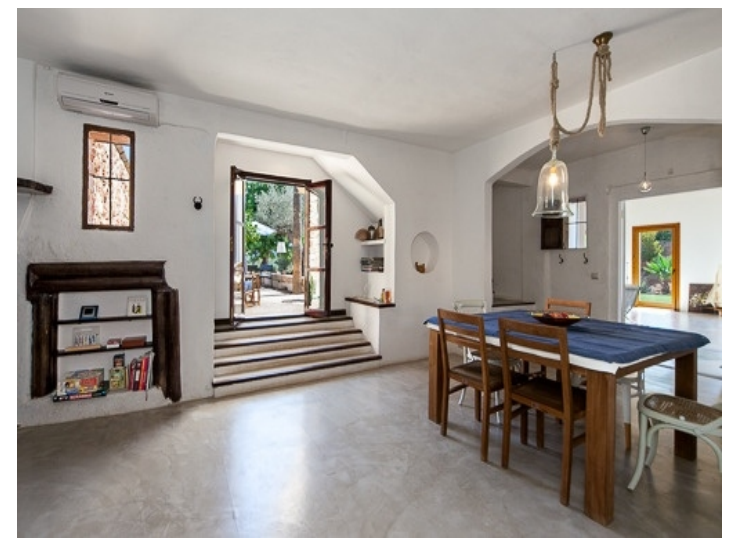
Spacious dining area with terrace acces