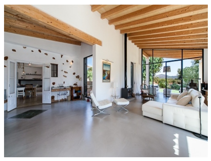
Winter garden with panoramic windows