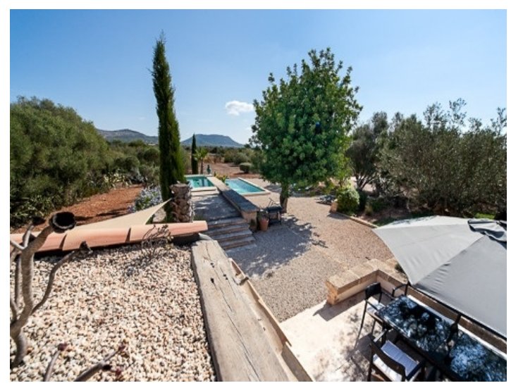
Impressive views from the balcony to the garden