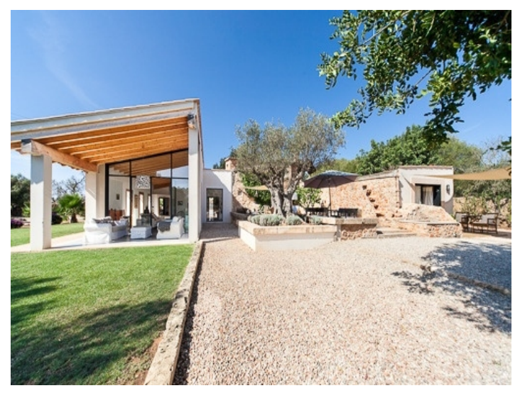
View from the garden to the fantastic wintergarden