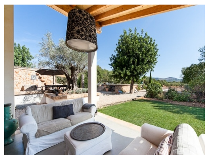
Lounge area with garden views