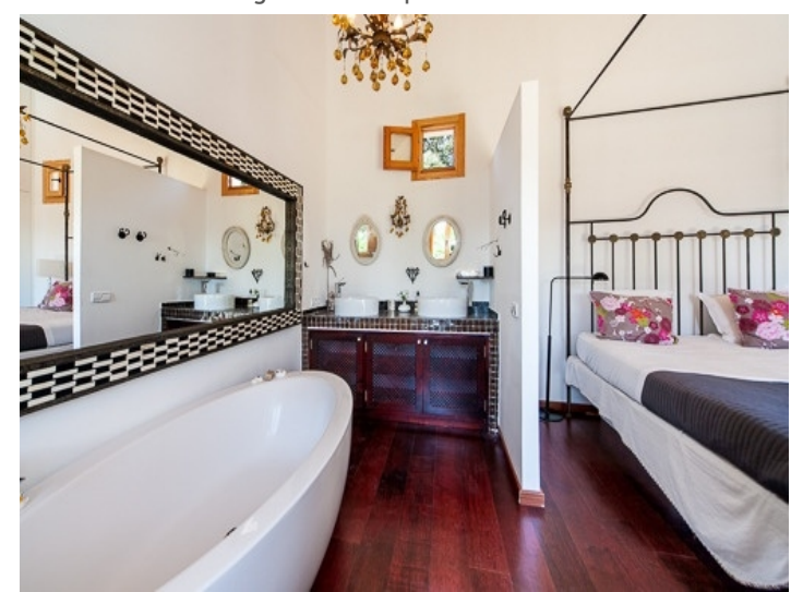
Bright bathroom with bathtub and bedroom acces