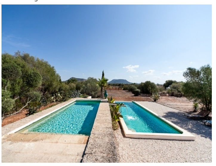
Excellent pool area