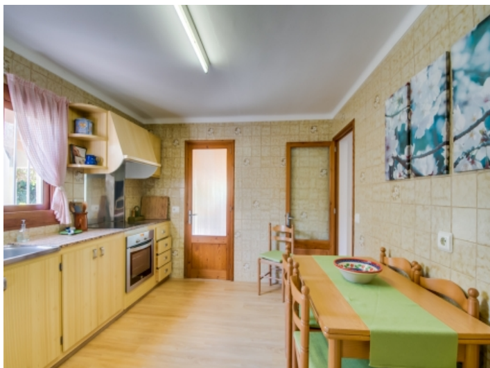
Spacious kitchen with dining area