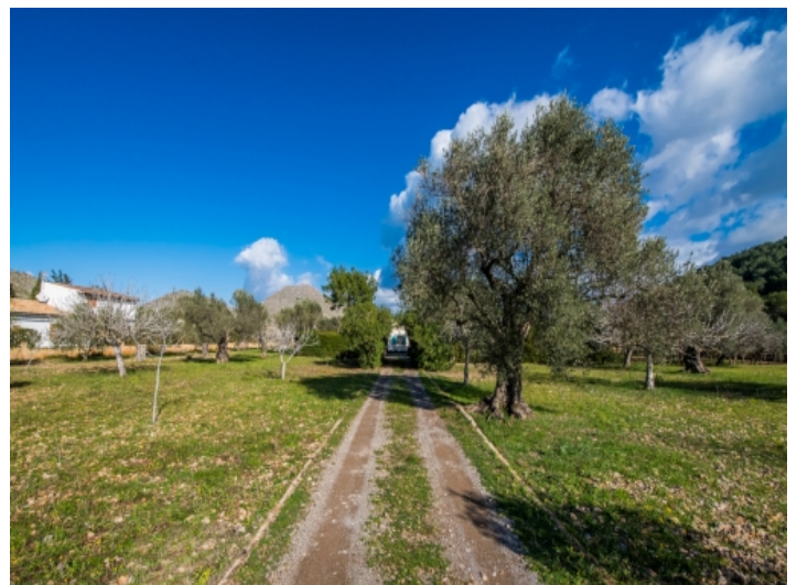
Access to the finca