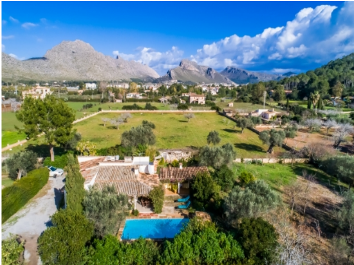
View of the finca from above