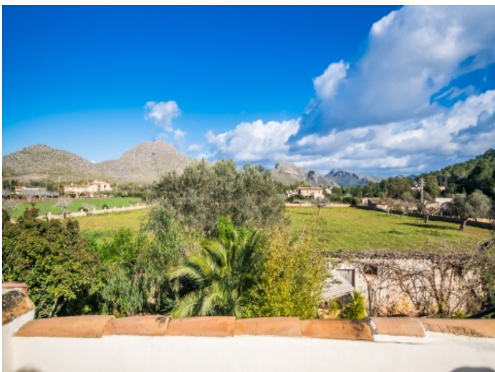
Beautiful mountain views from the roof terrace