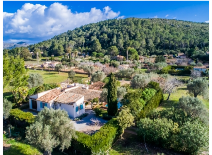
View of the finca from above