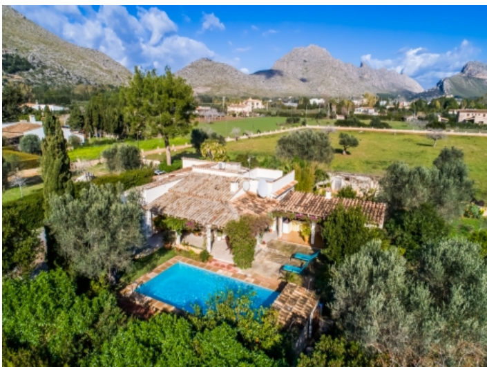
Finca from above surrounded by a green vegetation