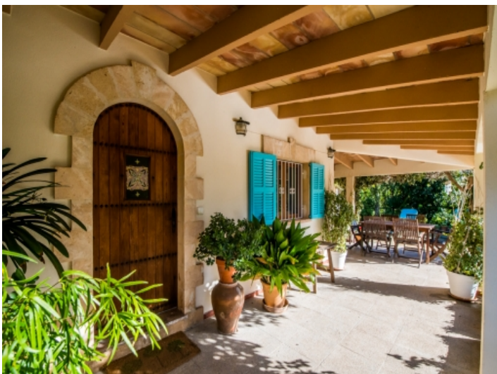
Typical and beautiful entrance to the finca