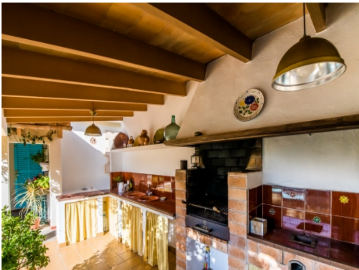
Rustic, covered outdoor kitchen