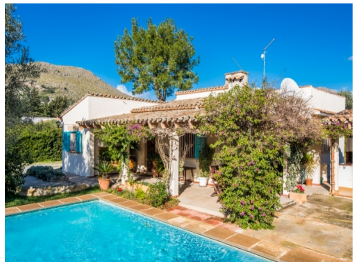
Idyllic pool and bbq terrace