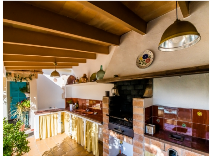
Rustic, covered outdoor kitchen