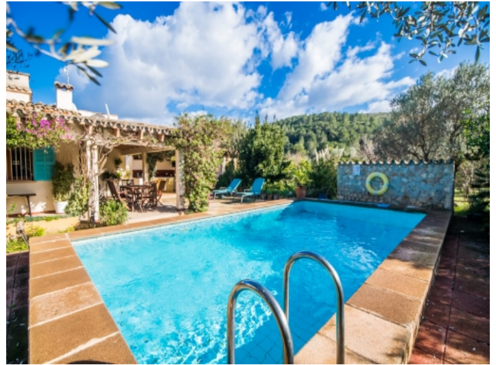
Pool with absolute privacy