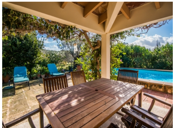
Covered terrace with views to the pool