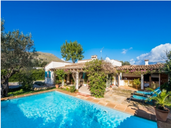
house, Puerto Pollensa