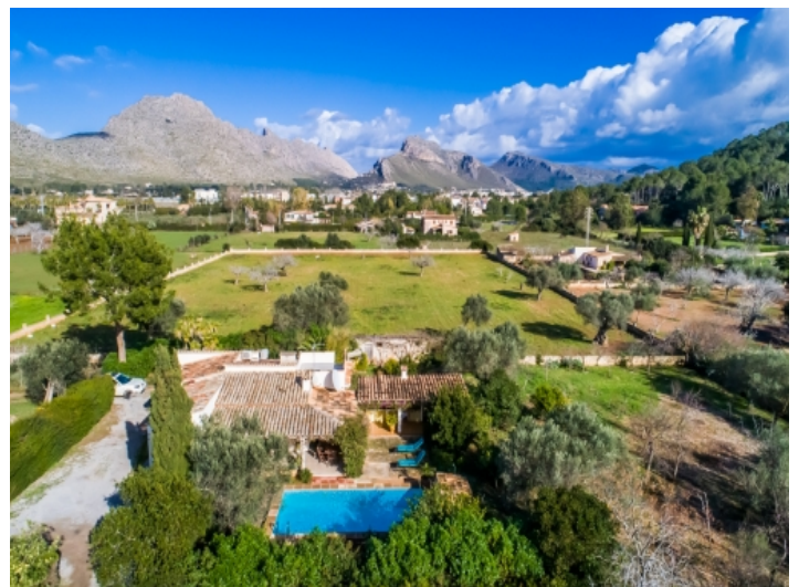
View of the finca from above