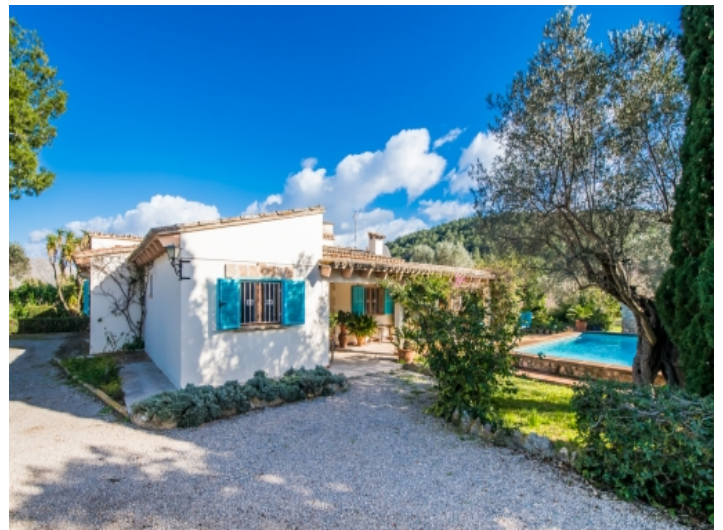
Side view of the finca