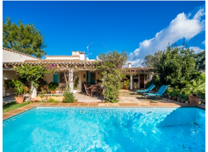
Beautiful pool with sun terrace