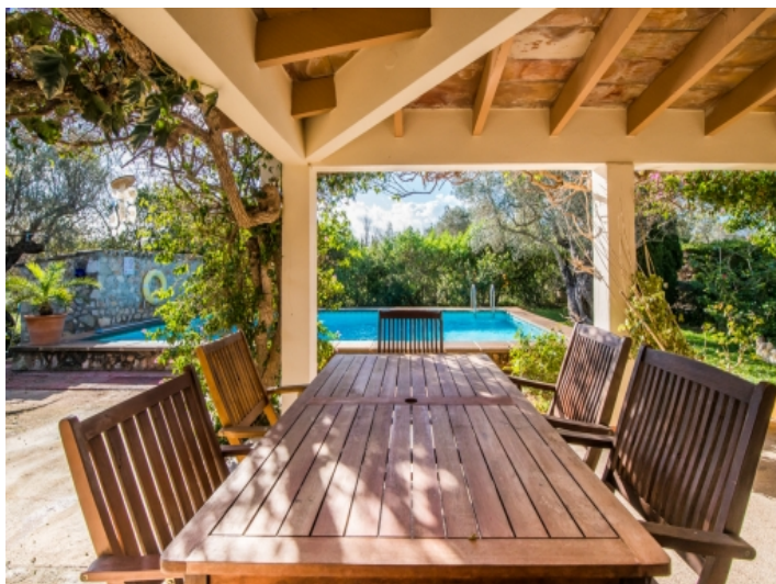
Enchanting covered dining terrace