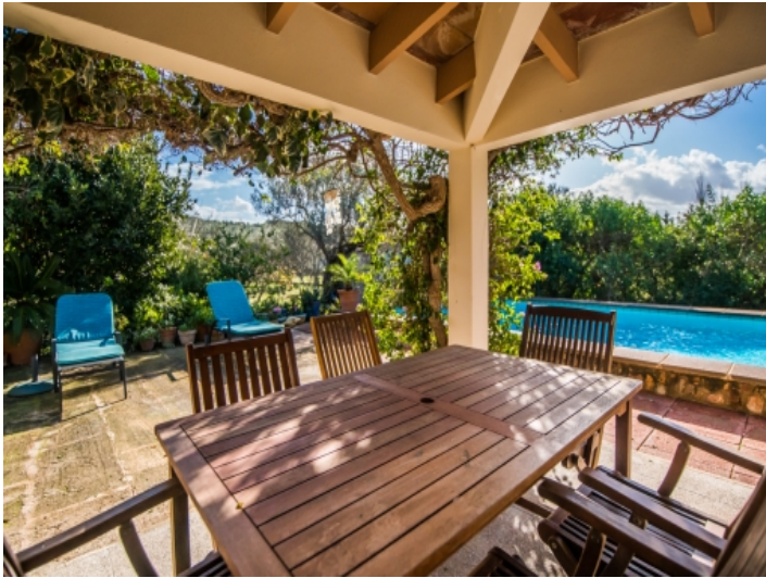
Covered terrace with views to the pool