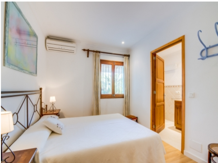
Bedroom with en suite bathroom