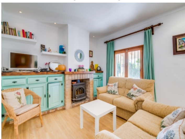
Cosy living area with fireplace