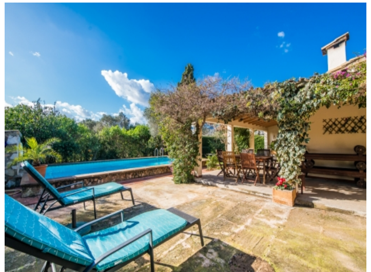
Idyllic sun terrace next to the pool