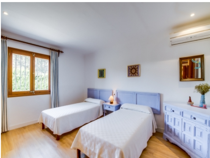
Bedroom with 2 single beds