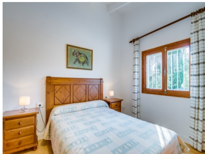
Bright double bedroom

PORTA MALLORQUINA • C./ COLOM 20 2º, 07001 PALMA, SPAIN