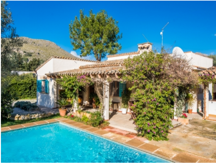
Idyllic pool and bbq terrace