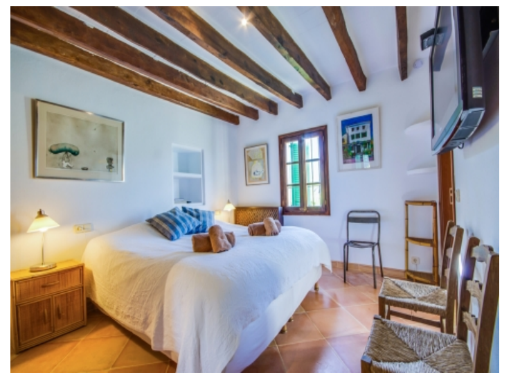
Cozy double bedroom with bathroom en suite