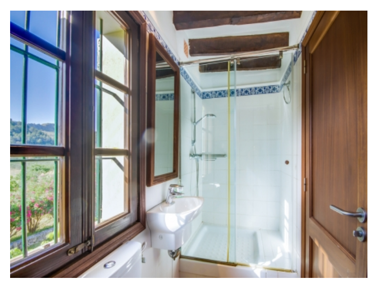
Light flooded bathroom