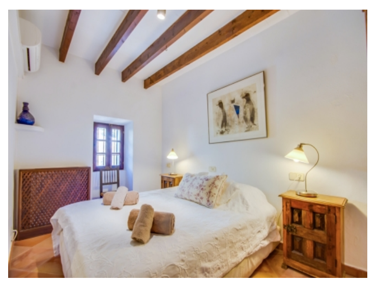
Cozy double bedroom