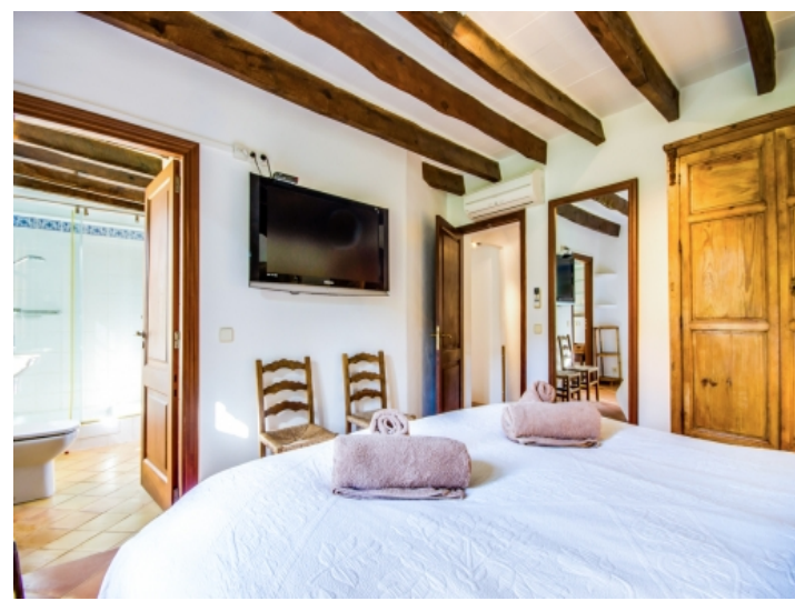
Cozy double bedroom with bathroom en suite