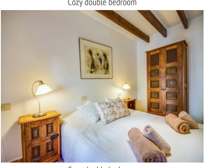
Cozy double bedroom