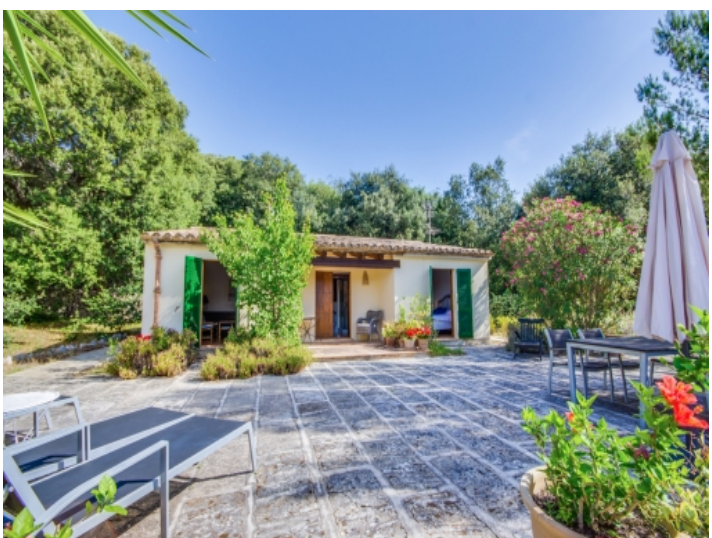
Exterior view of the guest house