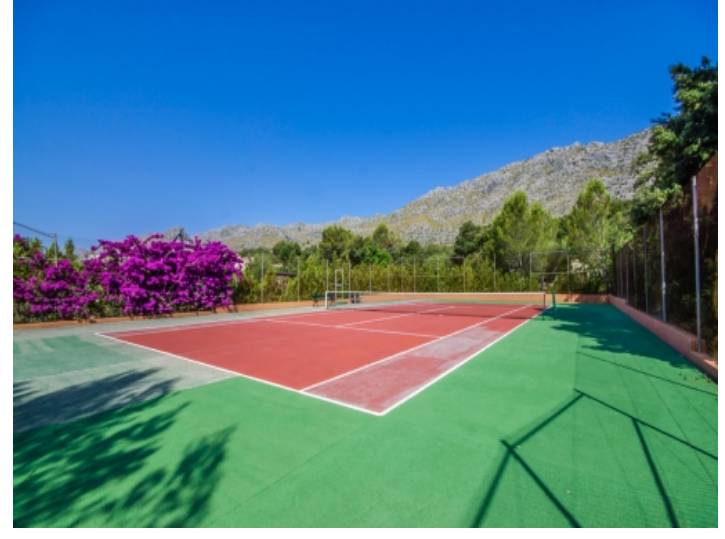
Fantastic tennis court