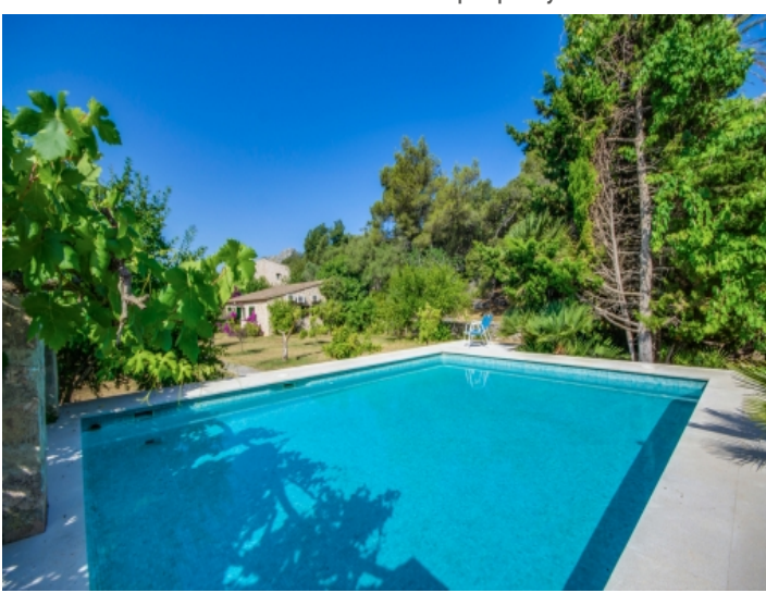
Second swimming pool of the finca