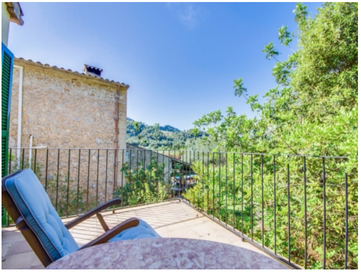
Balcony with sitting area