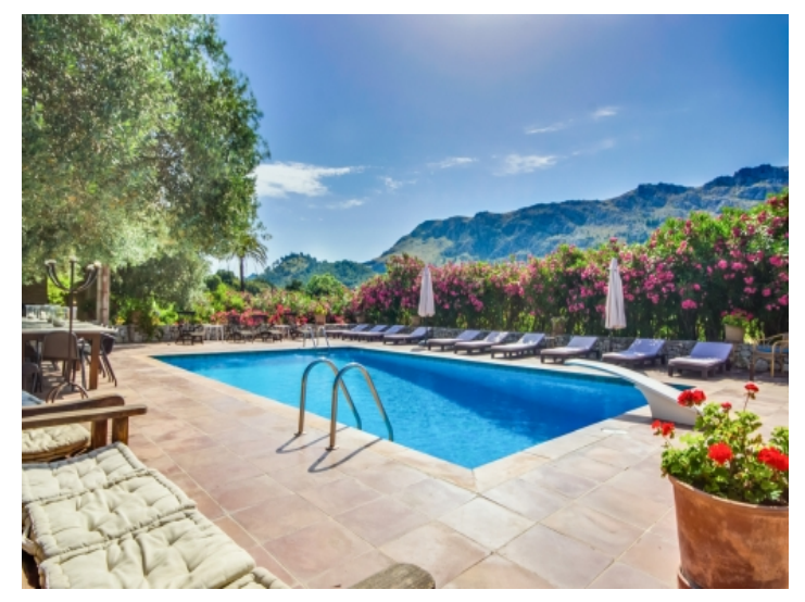
Inviting main pool area