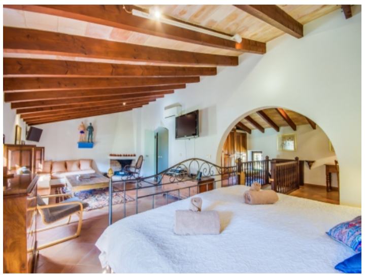
Master suite with chill out area