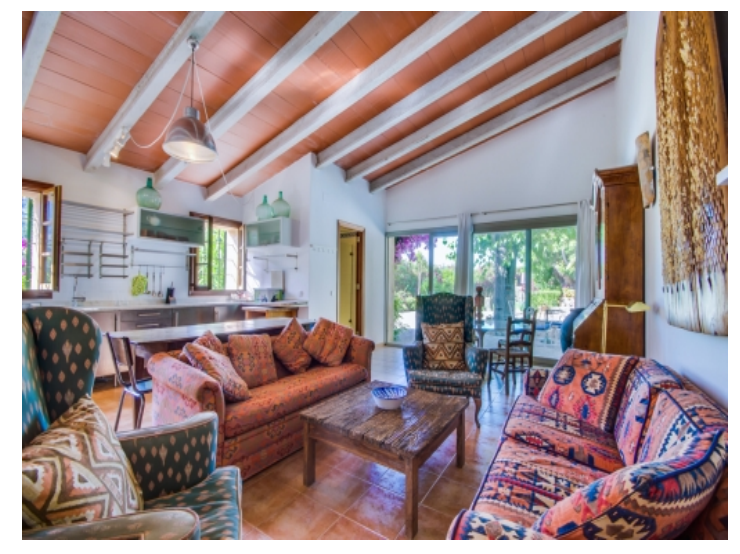
Open living and dining area of the guest house