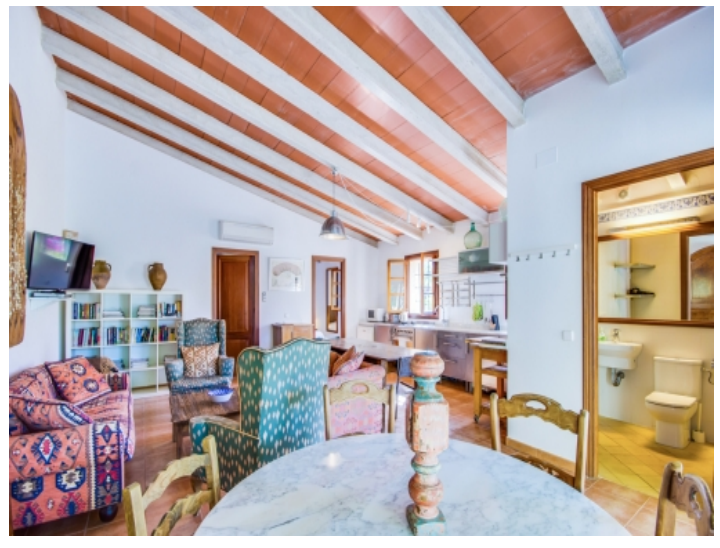
Open living and dining area of the guest house