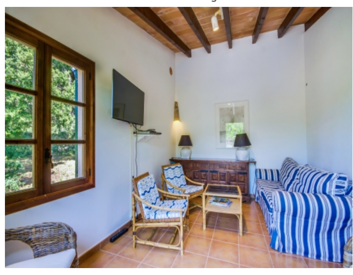
Separate living area