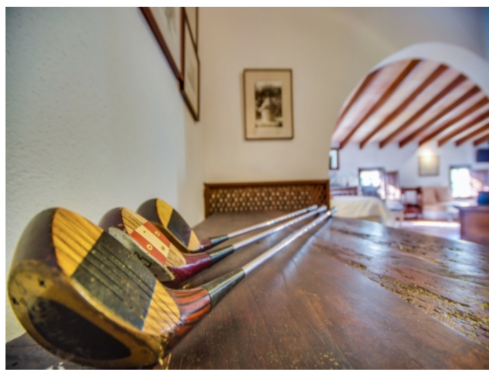
Master suite with chill out area