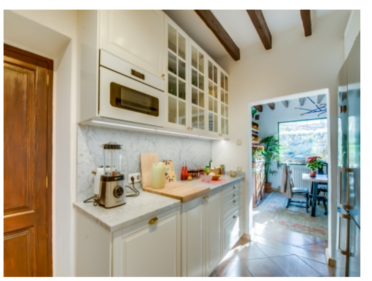
Modern kitchen in white