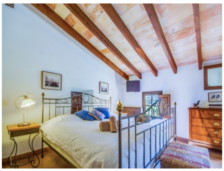
Master suite with chill out area