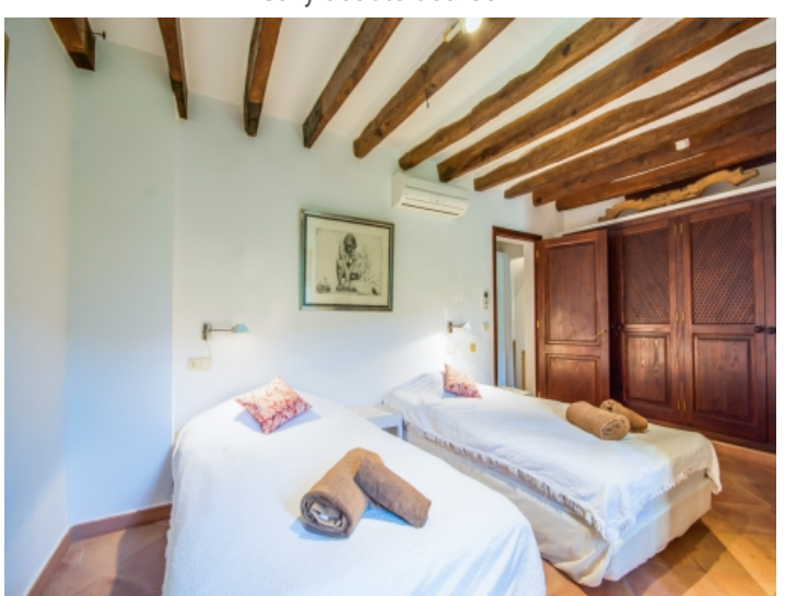
Cozy double bedroom with bathroom en suite