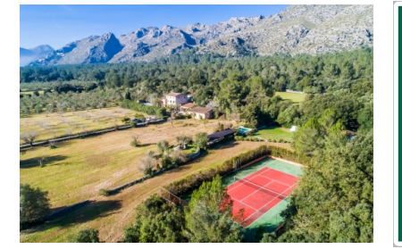
Pollensa search for property MAL-117449