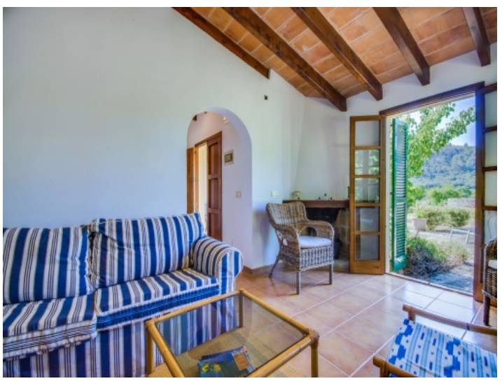
Separate living area