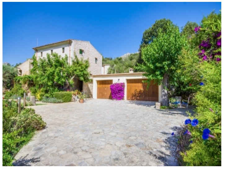
Entrance area with 2 garages