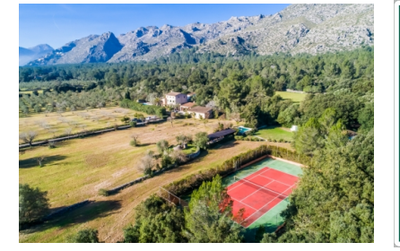
Pollensa search for property MAL-117449