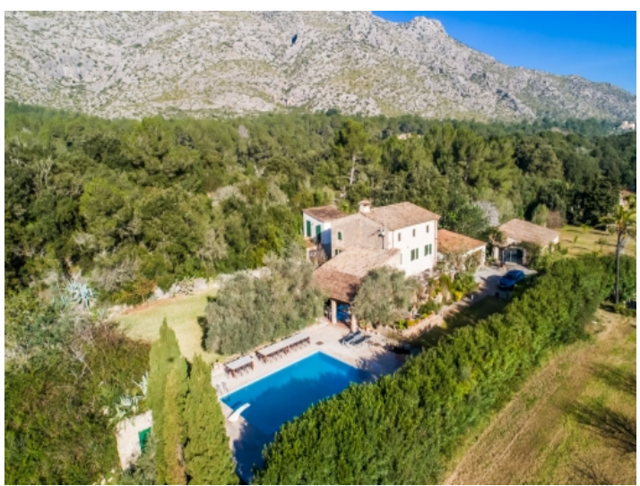
Exterior view of the property