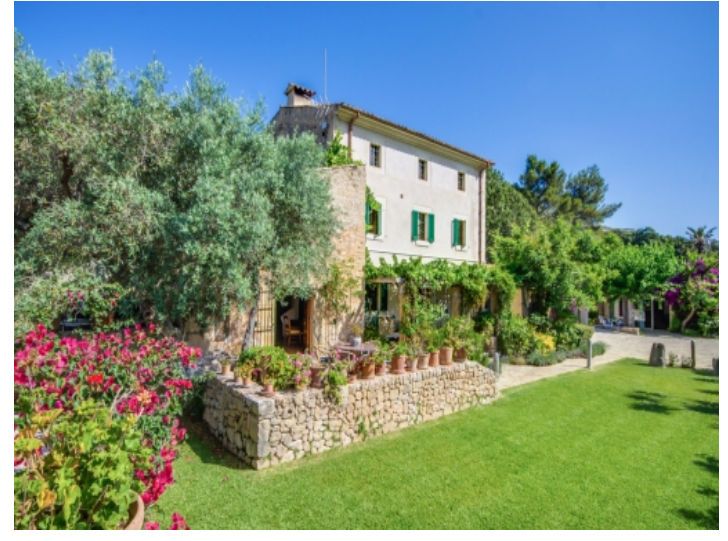
Exterior view of the main house