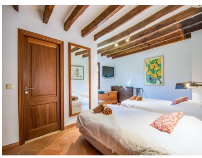
Cozy double bedroom with bathroom en suite