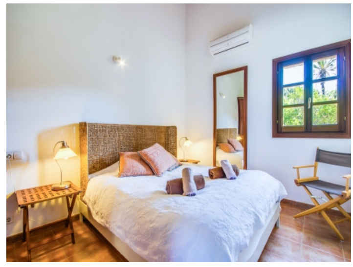
Cozy double bedroom