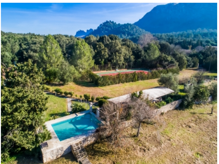
View of the tennis court and second pool