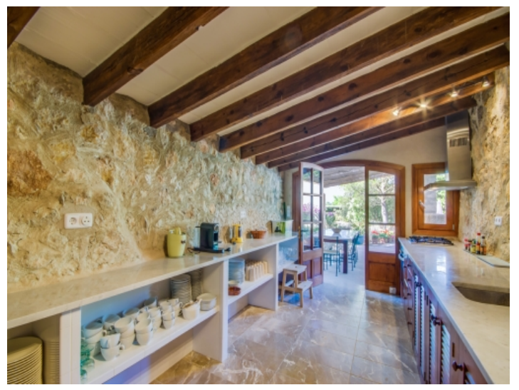
Rustik exterior kitchen