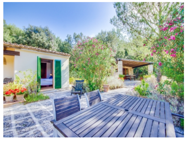
View to the guest house and exterior kitchen