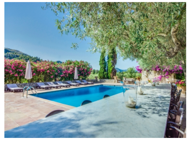
Dining area by the main pool