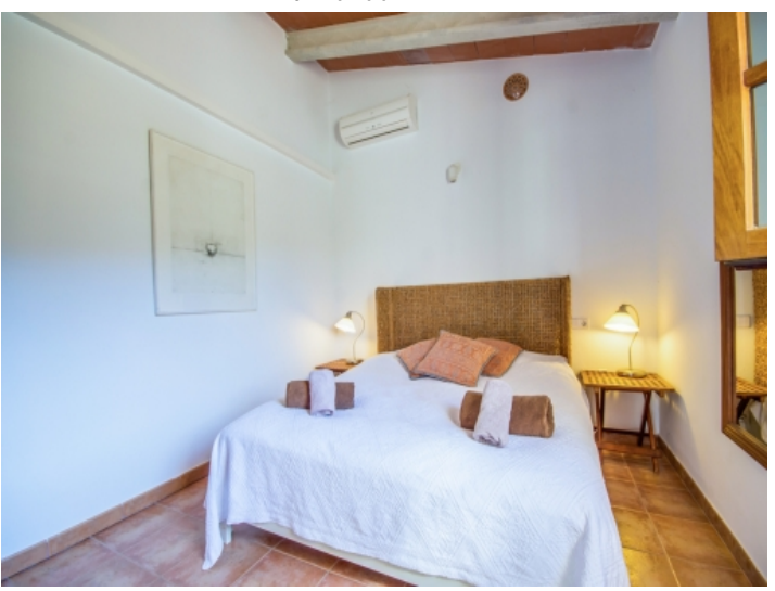
Cozy double bedroom