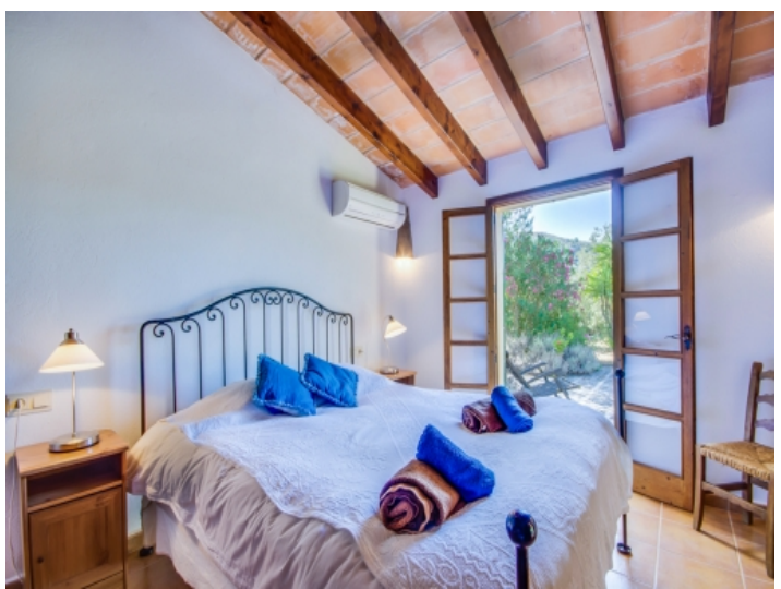
Double bedroom of the guest house