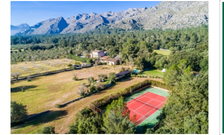
Pollensa search for property MAL-117449