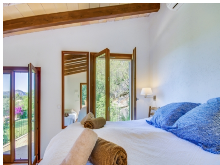
Cozy double bedroom with balcony