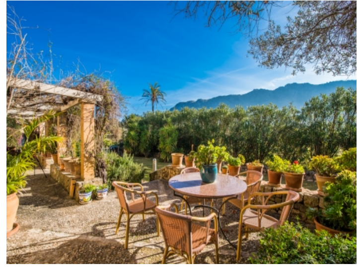
Another terrace with sitting area