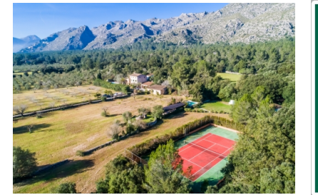
Pollensa search for property MAL-117449