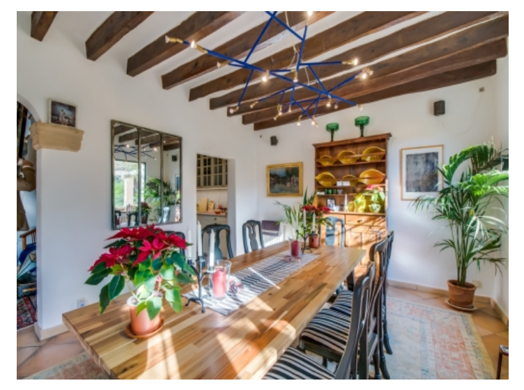
Dining area of the finca