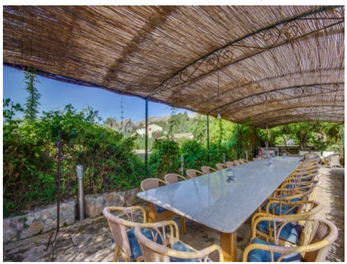
Dining area by the second pool