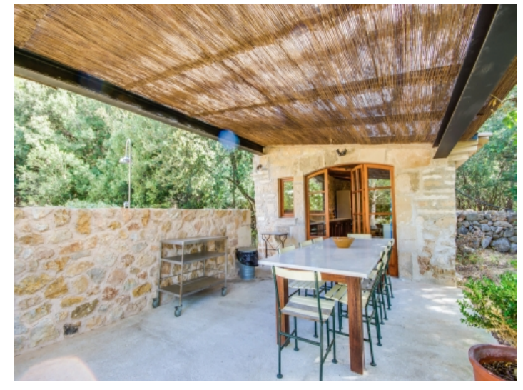
Terrace of the exterior kitchen