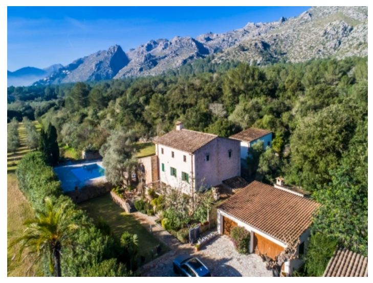
Exterior view of the property