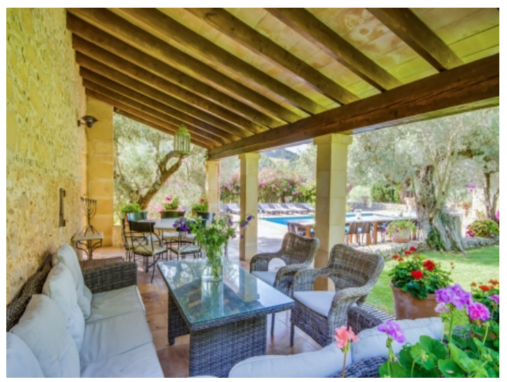
Covered chill out area on the terrace