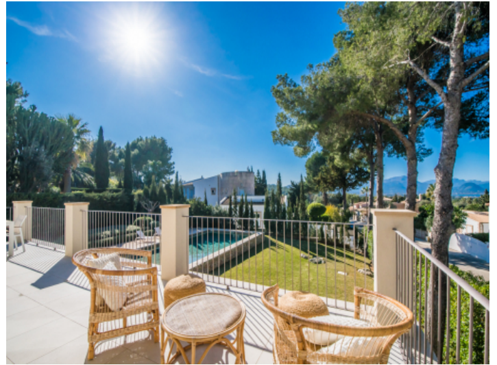
Upper terrace with garden views