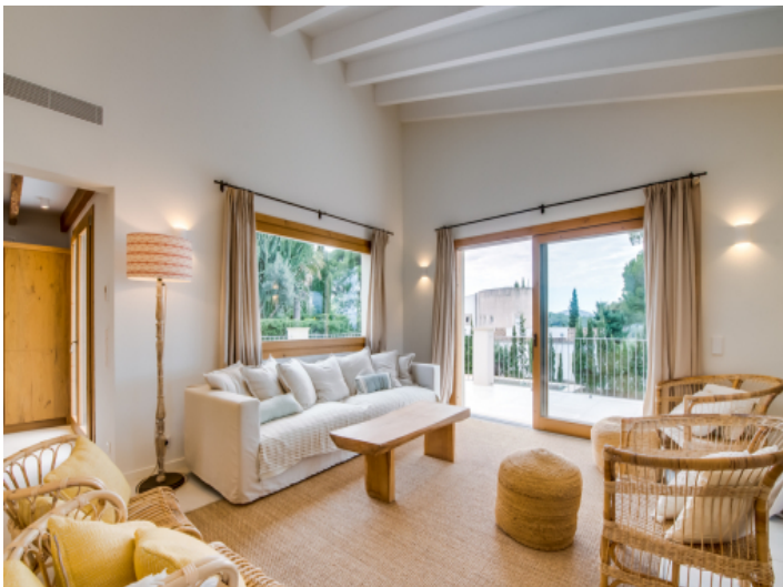
Tastefully furnished living area