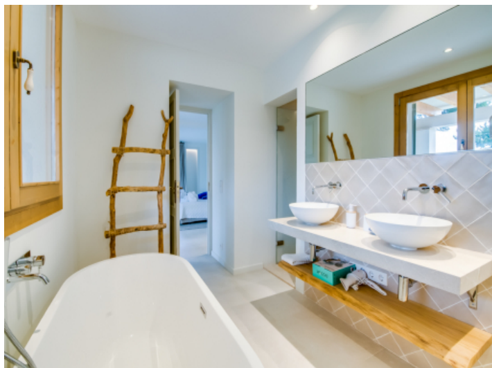
Wonderful bathroom with bathtub