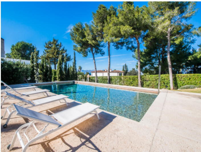
Sun loungers by the pool