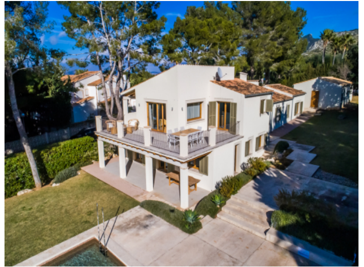
View of the 2 terraces