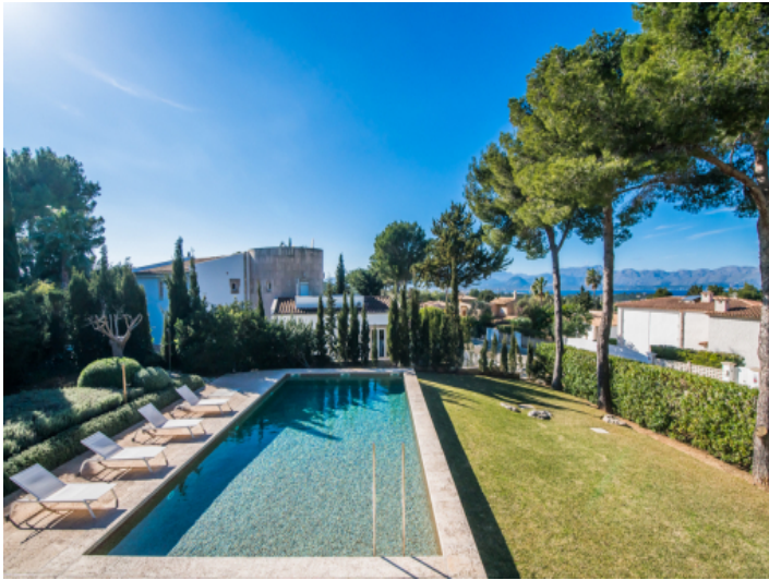
Modern pool area with sun terrace