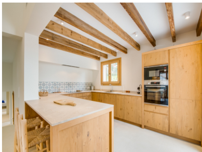
New kitchen with wooden ceiling beams