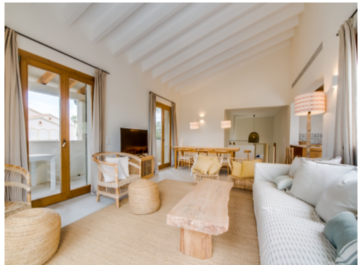
Bright and open living area