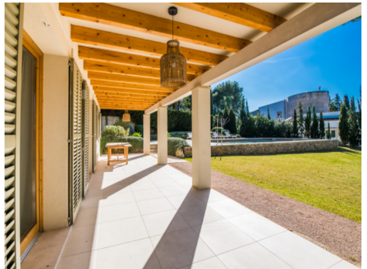
Covered terrace with garden views