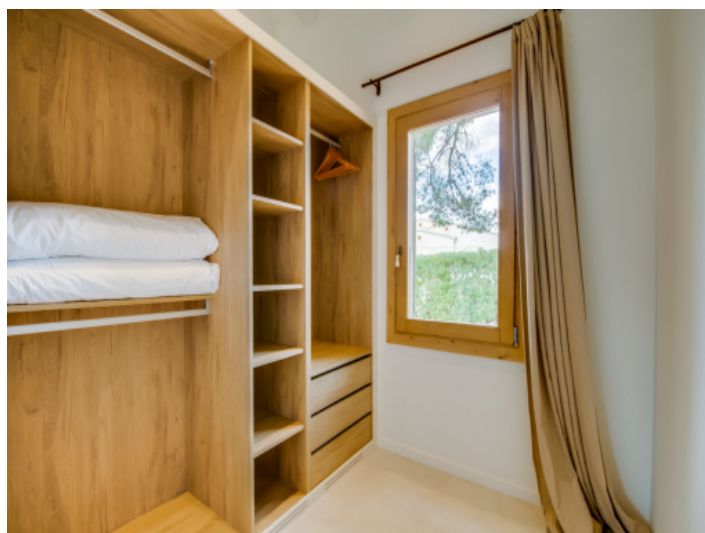
Separate dressing area