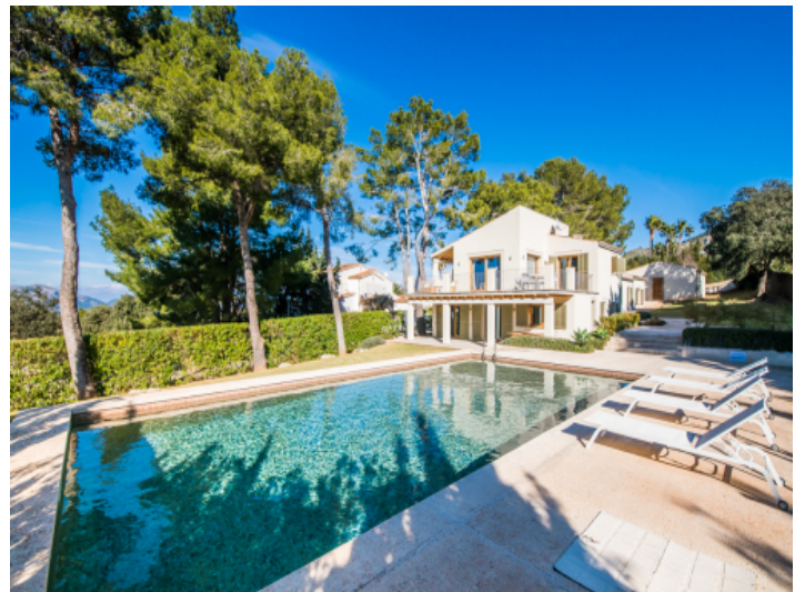
Large pool with sun terrace