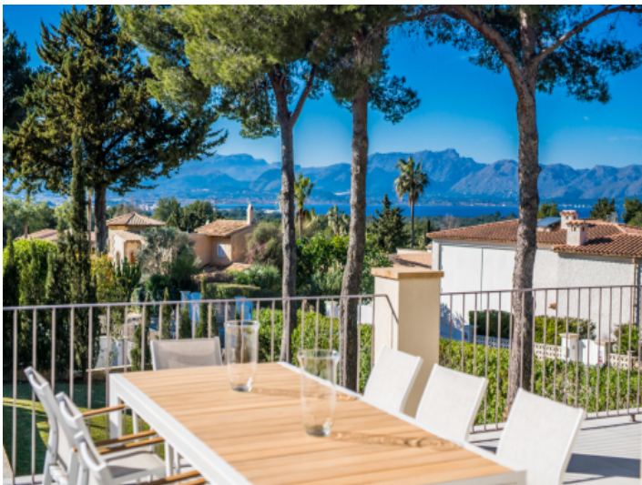
View as far as the bay of Alcudia