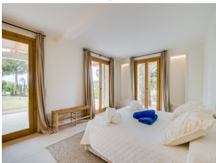
Bedroom with garden access