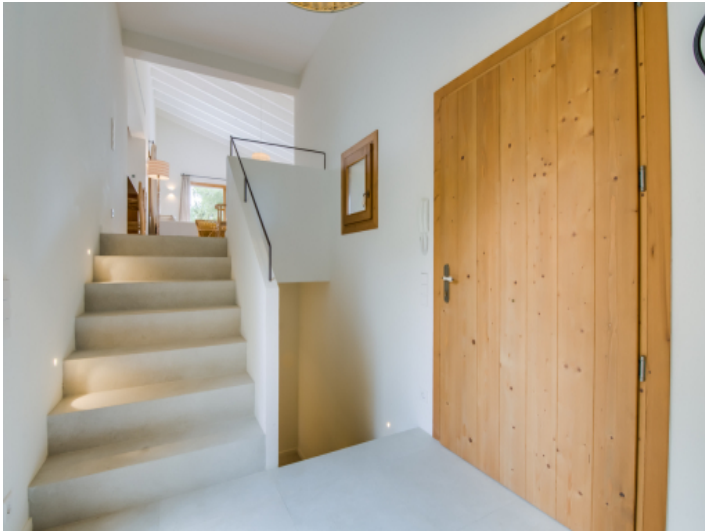
Entrance to the house