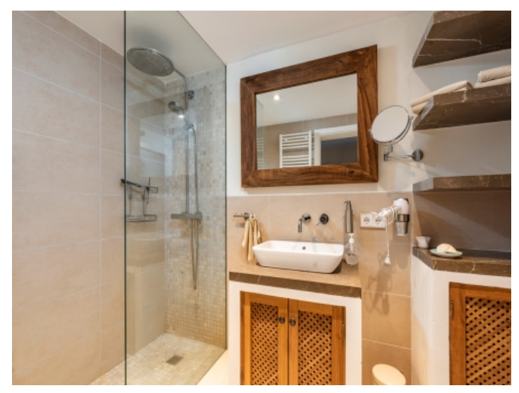
Modern shower bathrom with charme