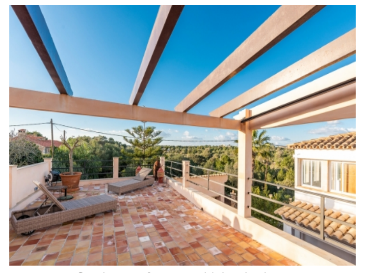
Spacious roof terrace with lovely views