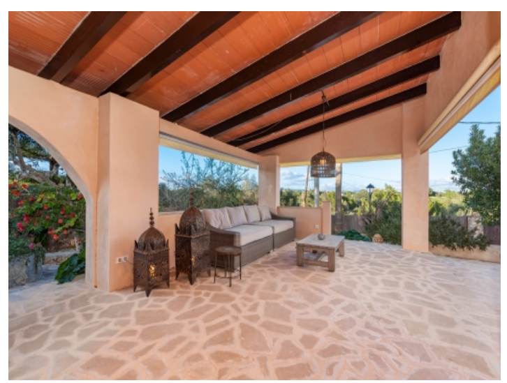
Large, covered lounge terrace