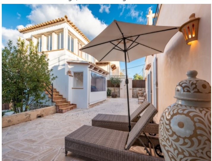
Patio and view to the guest house