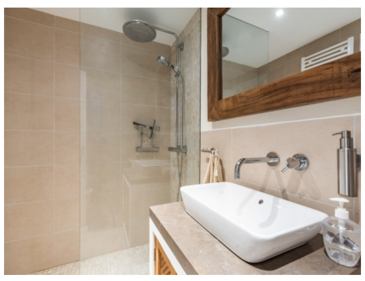
Second shower bathroom