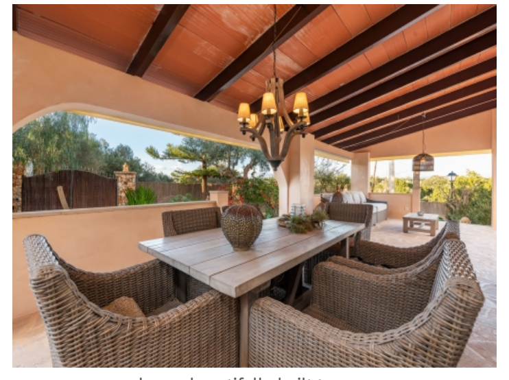
Large, beautifully-built terrace