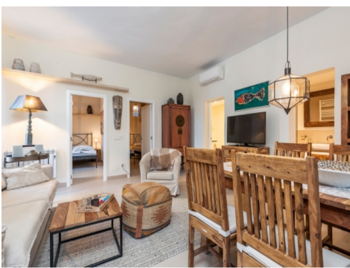
Tastefully furnished main house