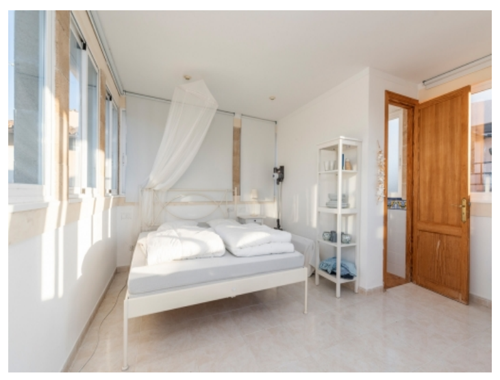
Guest house bedroom with bathroom