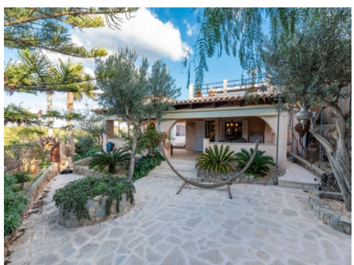
View to the charming main house