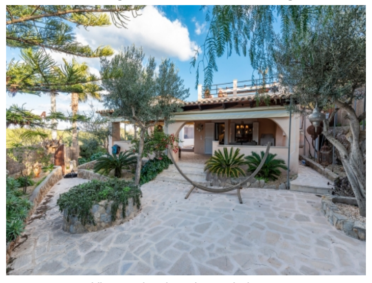
View to the charming main house