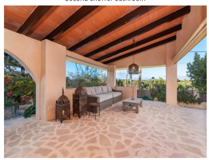
Large, covered lounge terrace