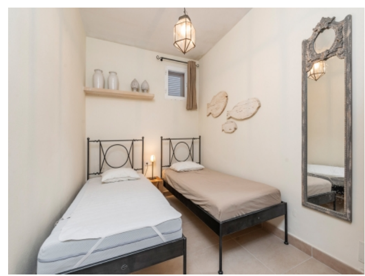
Second bedroom in the main house