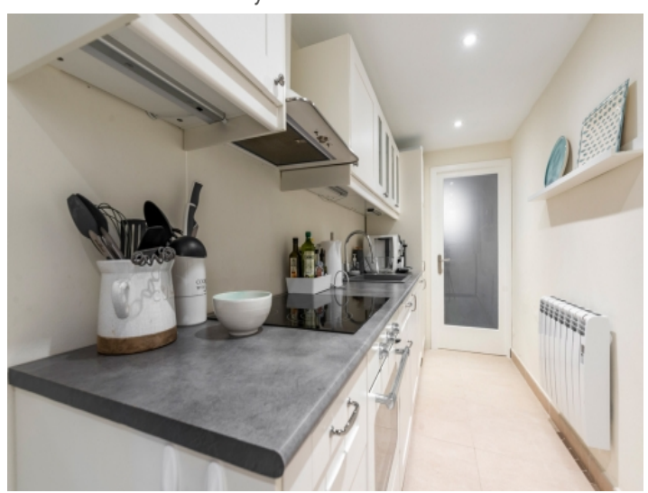
Separate, modern kitchen in white