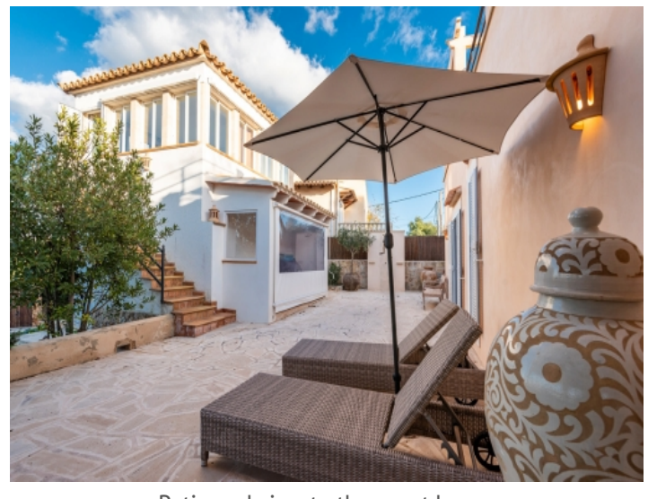
Patio and view to the guest house