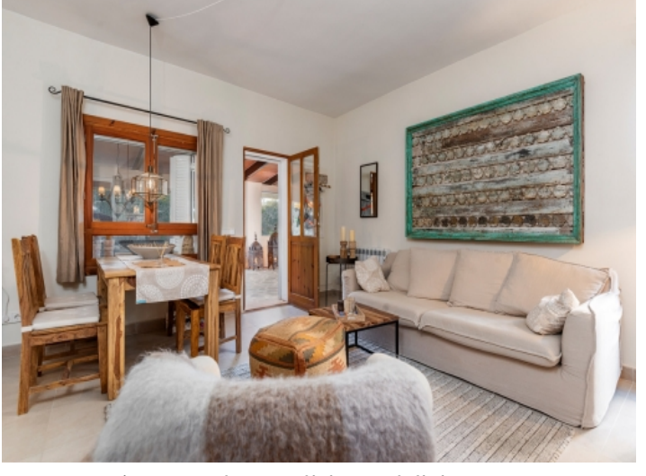
Access ot the cosy living and dining area