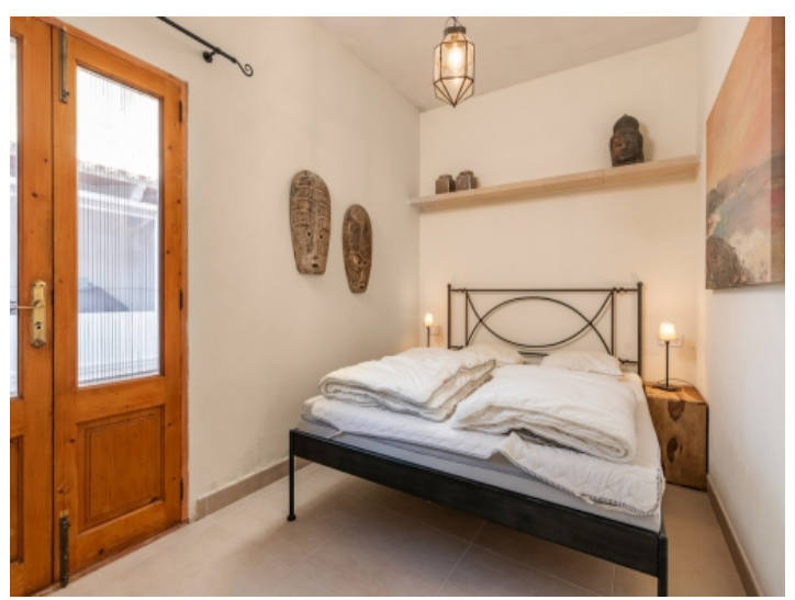
Double bedroom with access to the outside