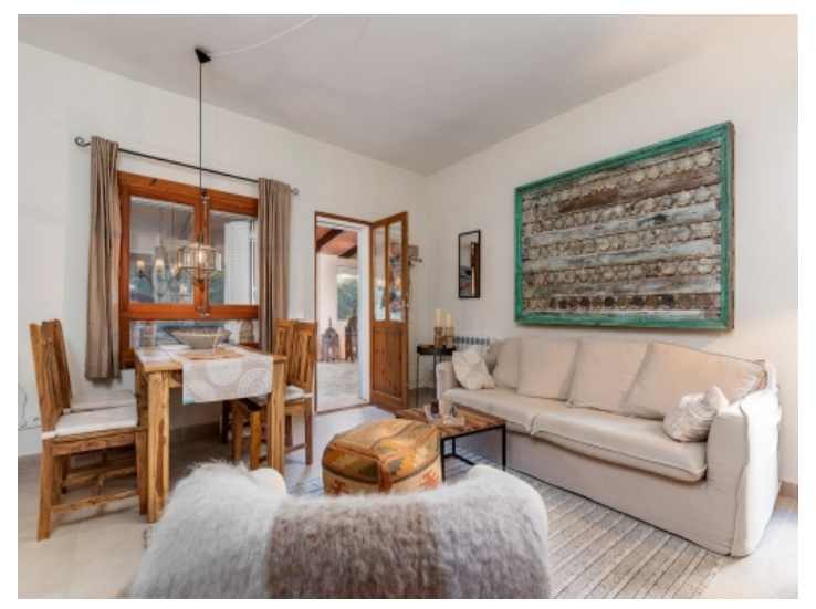
Access ot the cosy living and dining area