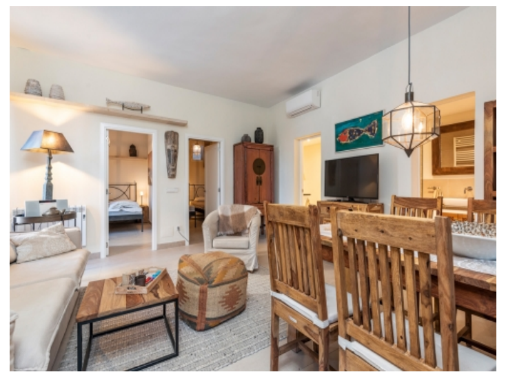
Tastefully furnished main house