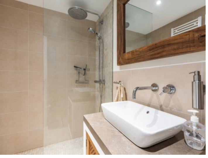
Second shower bathroom