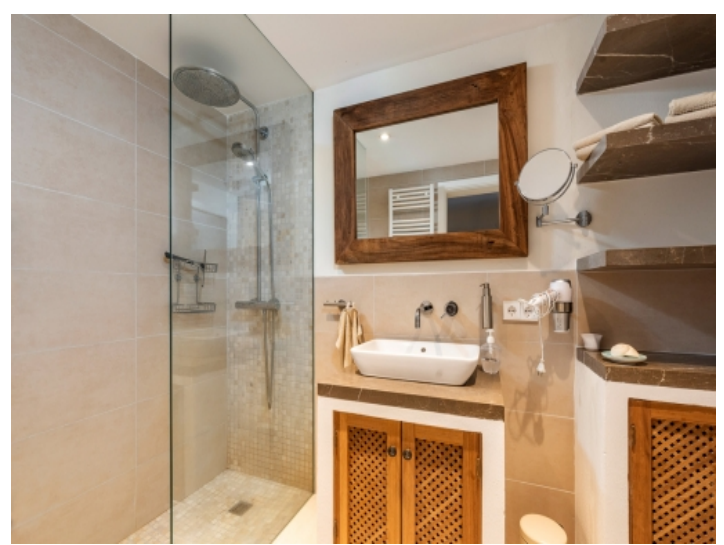
Modern shower bathrom with charme