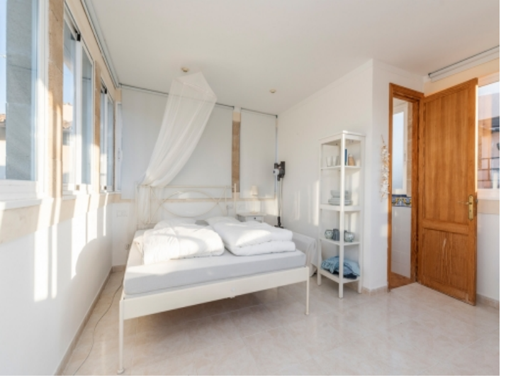
Guest house bedroom with bathroom