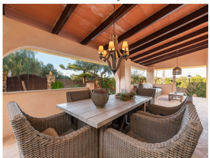
Large, beautifully-built terrace