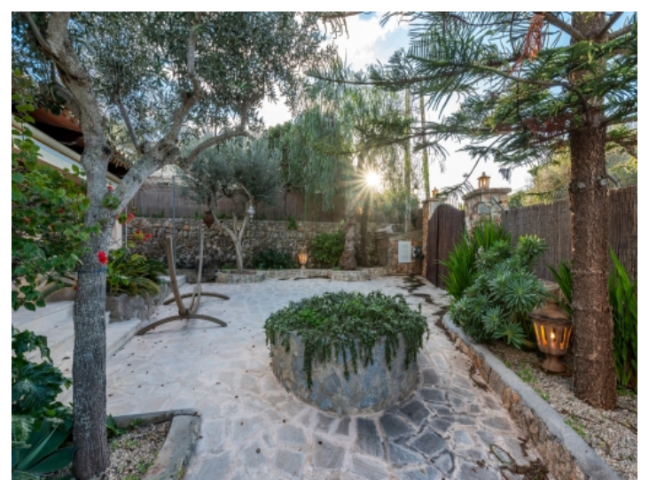
Access through a beautiful, mediterranean garden