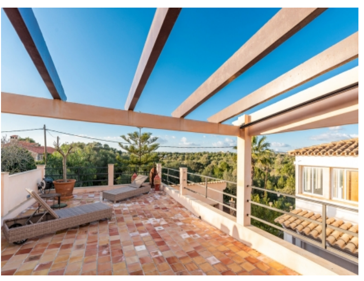
Spacious roof terrace with lovely views