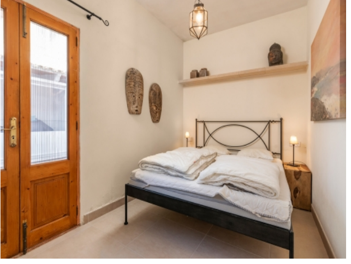
Double bedroom with access to the outside