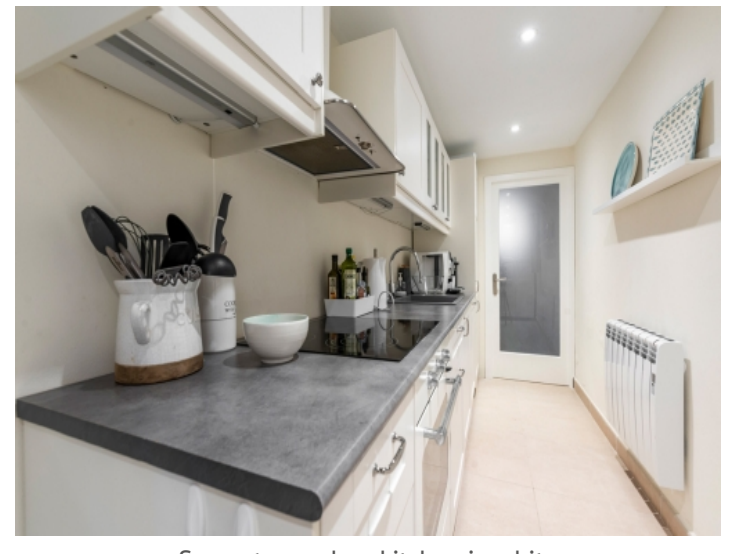
Separate, modern kitchen in white