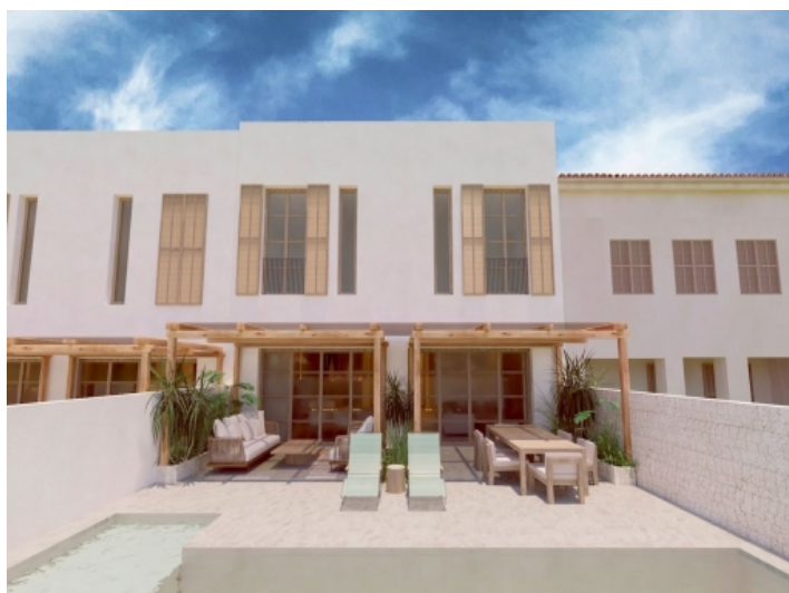
View of the terrace