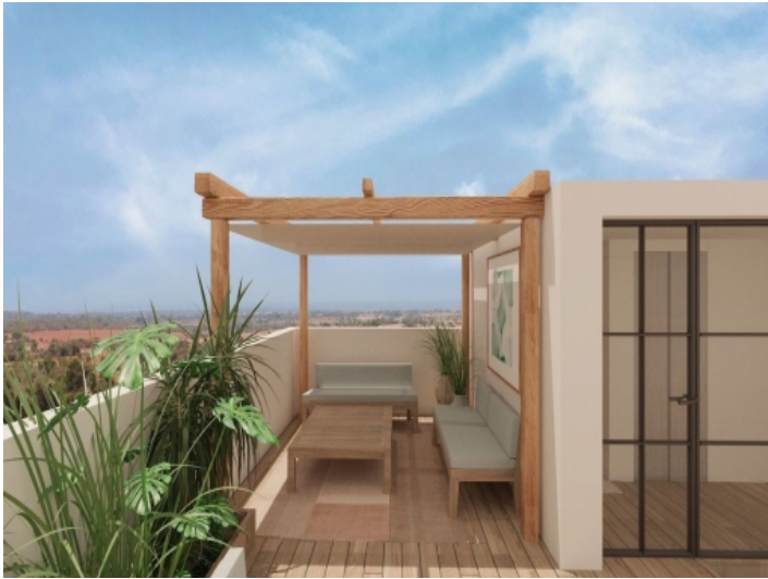
View of the roof terrace