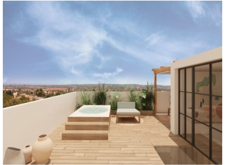
Spacious roof terrace