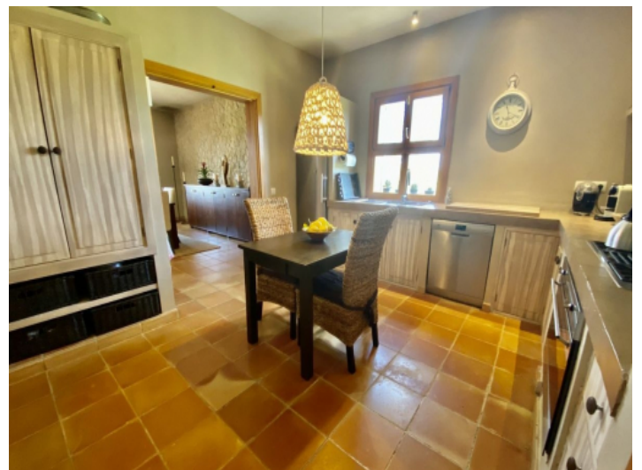
View of the kitchen