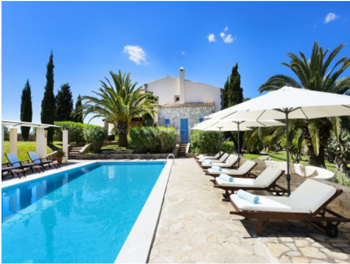
Inviting pool area with sun loungers