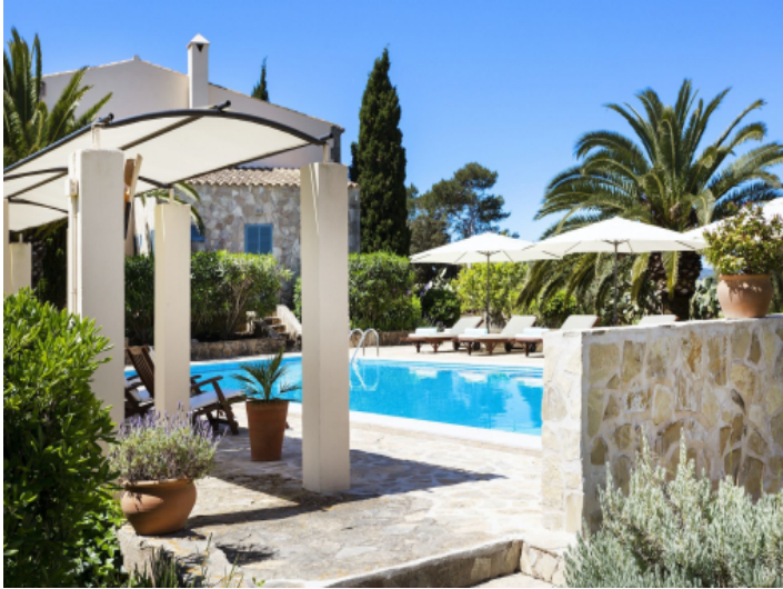
Inviting pool area with sun loungers