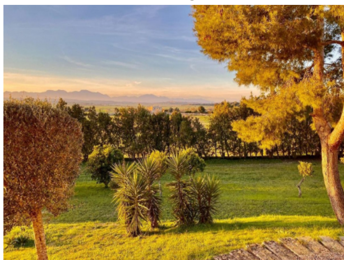
Idyllic landscape views