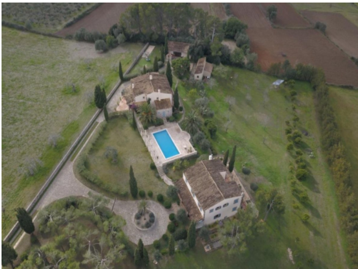
The finca from a birds-eye view