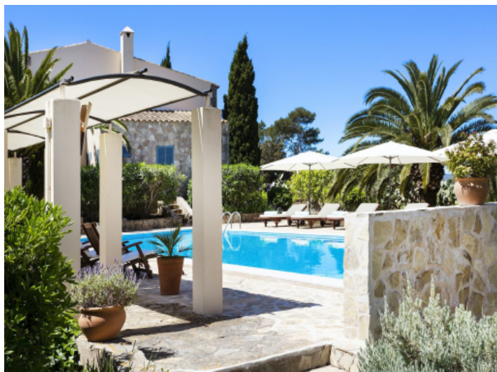
Inviting pool area with sun loungers