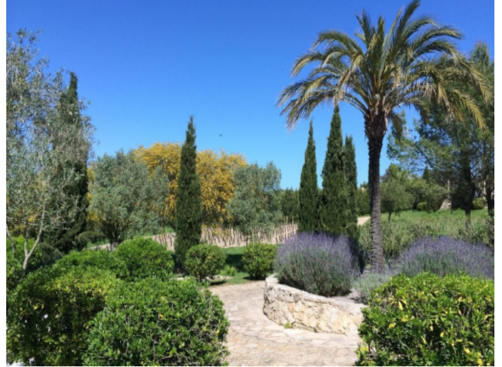
View of the garden