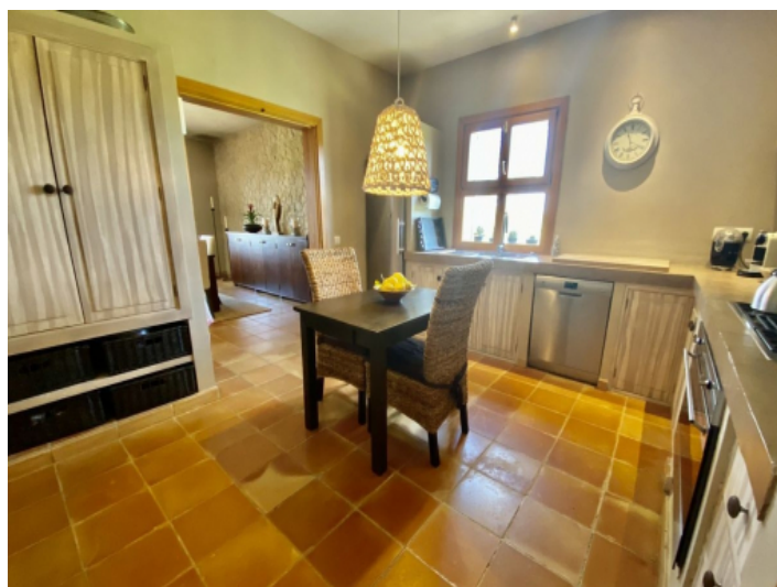
View of the kitchen