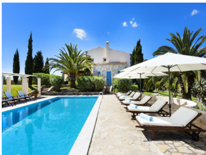
Inviting pool area with sun loungers