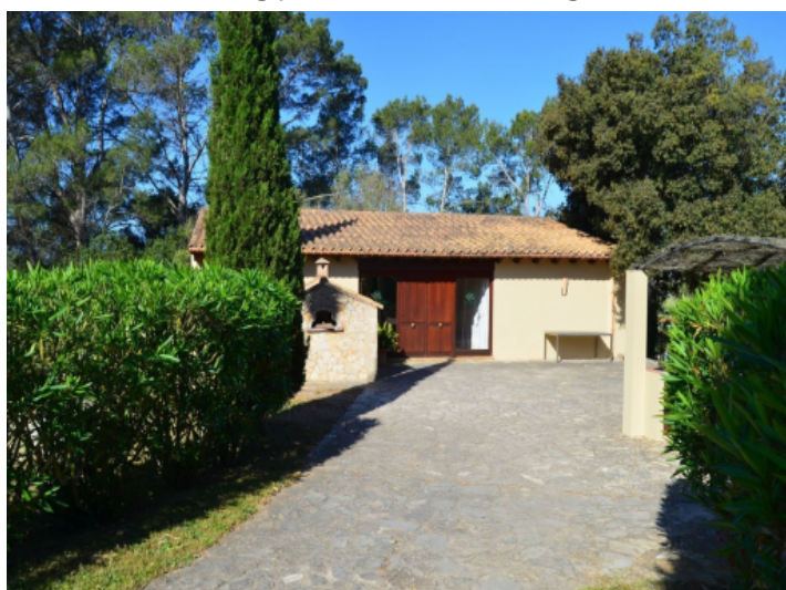
View of the garden