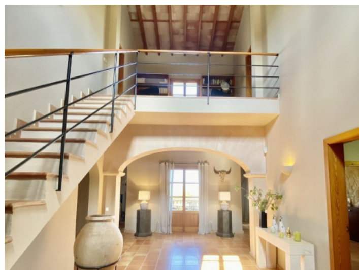
Impressive entrance area