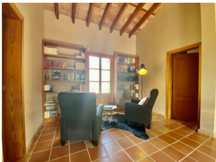
Separate sitting area