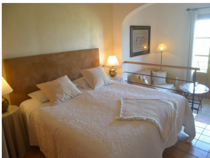
One of 11 bedrooms