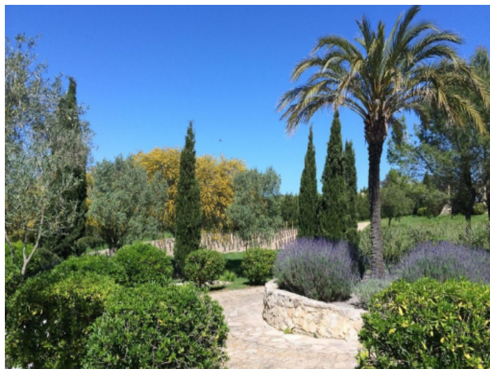
View of the garden