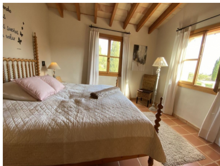
One of 11 bedrooms