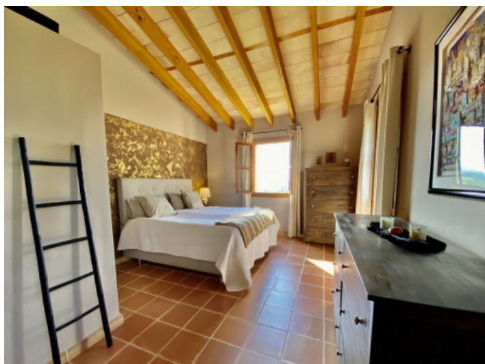
Noble double bedroom