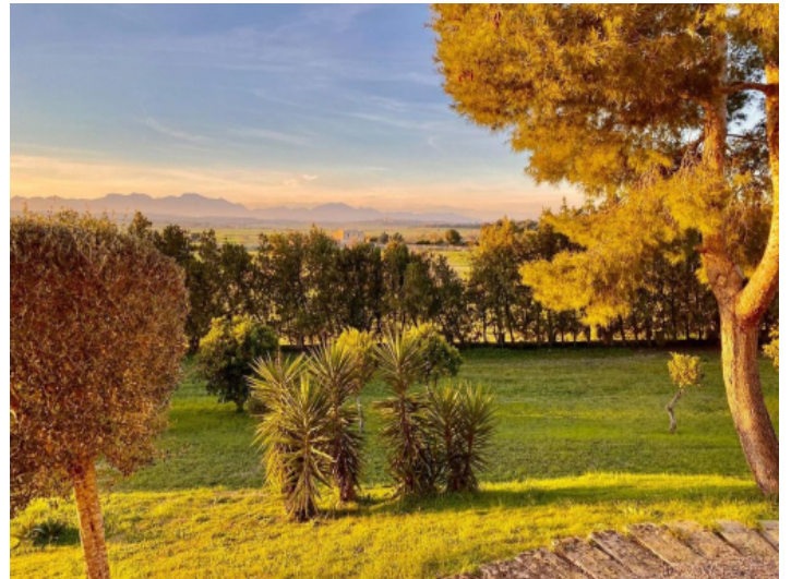
Idyllic landscape views