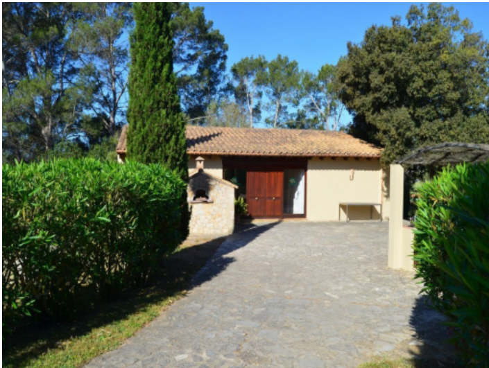
View of the garden