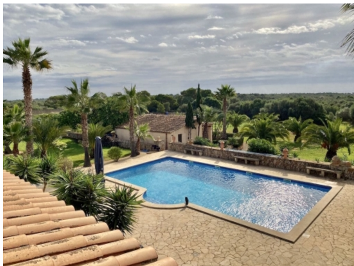
View to the pool area