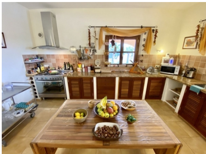
Alternative view of the kitchen