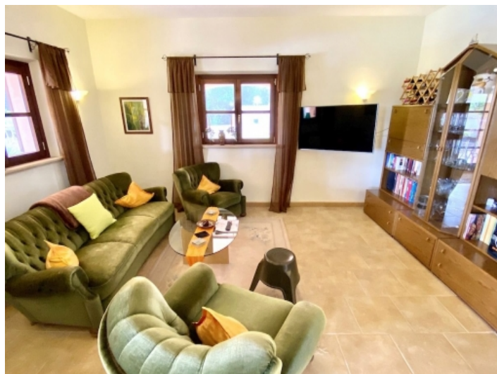
Cozy living area