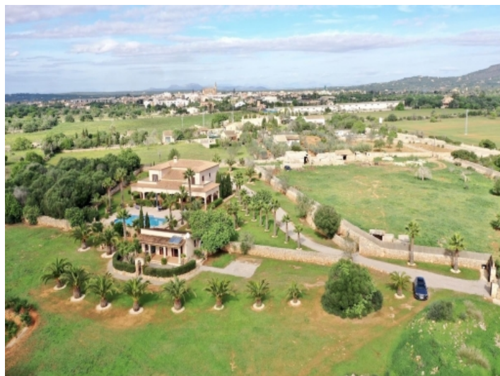
Idyllic landscape view