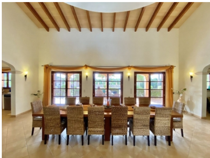
Alternative view of the dining area