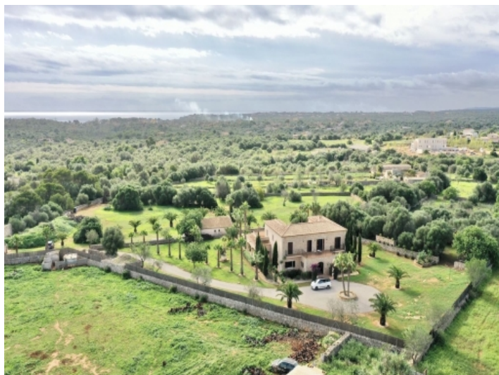
Exterior view of the property