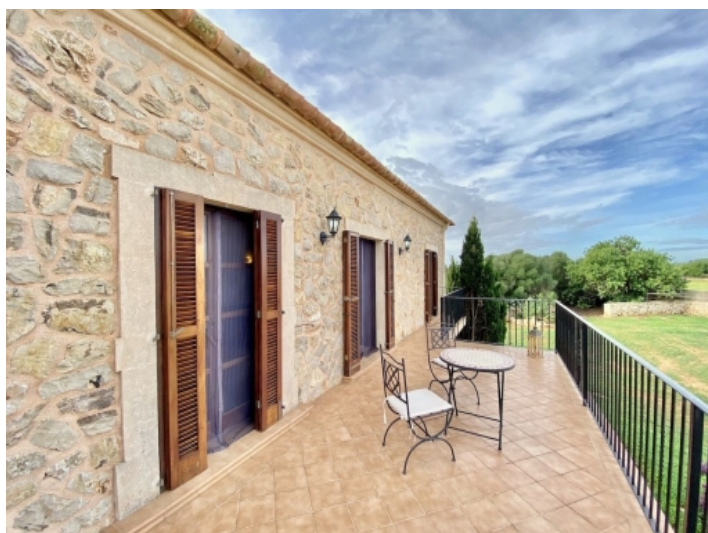
Balcony with sitting area