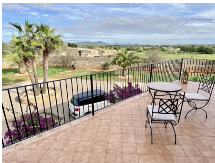
View of the balcony