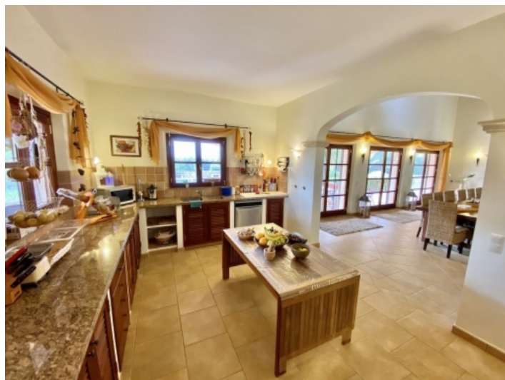
Rustic kitchen with cooking island