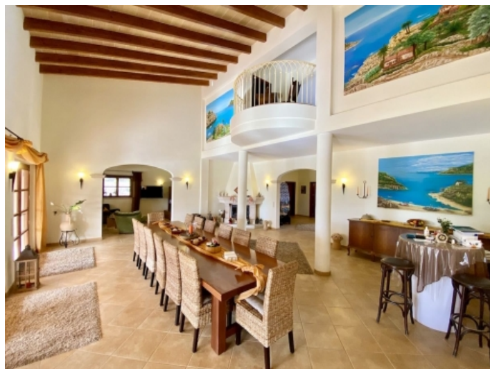
Impressive dining area