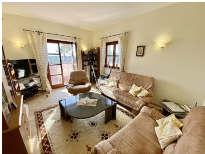
Separate living area