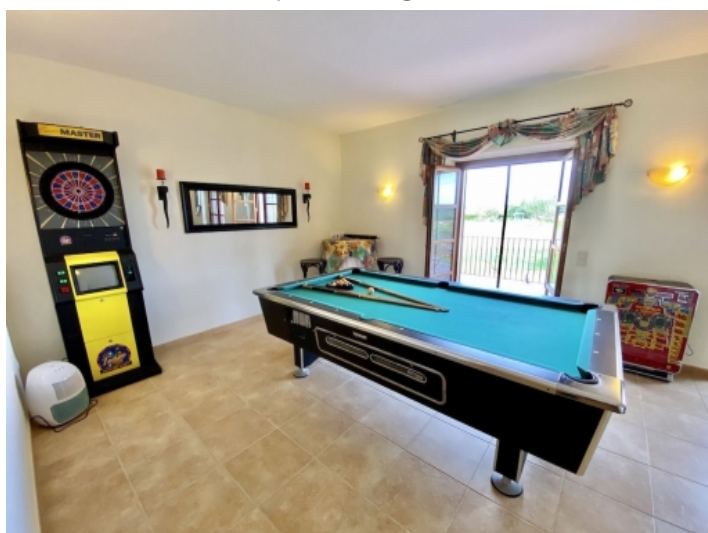
Fantastic hobby room