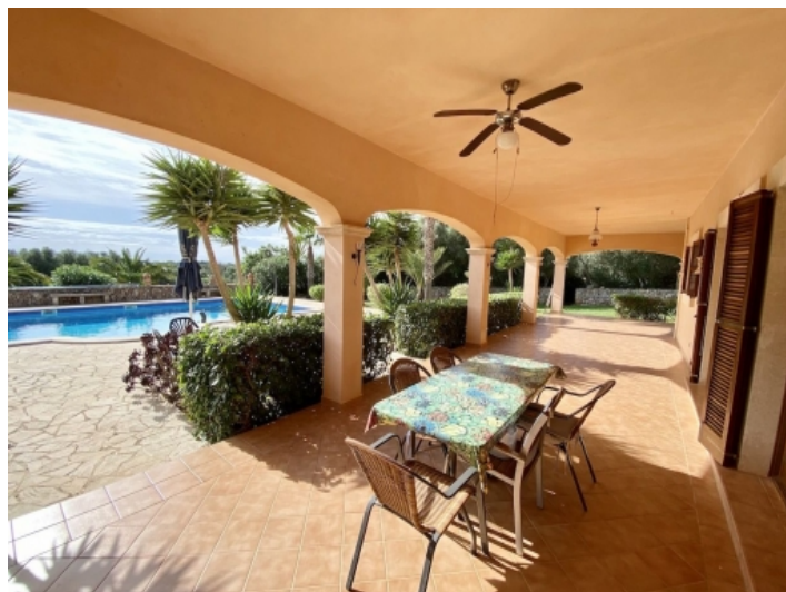
Covered dining area