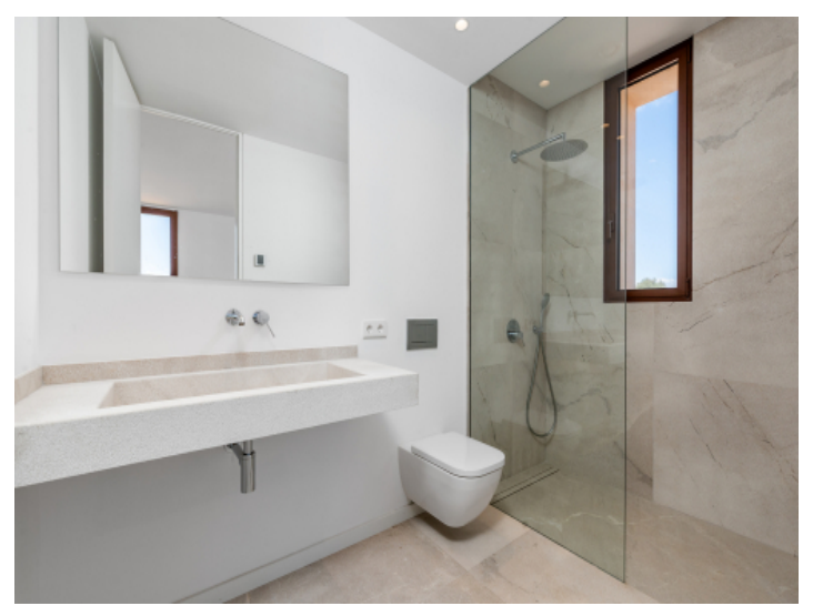
One of 6 bathrooms