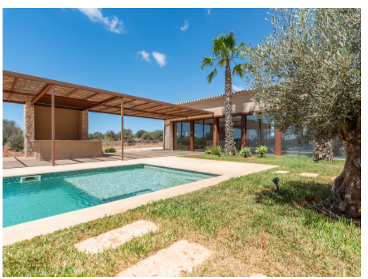
Pool and terrace Garden