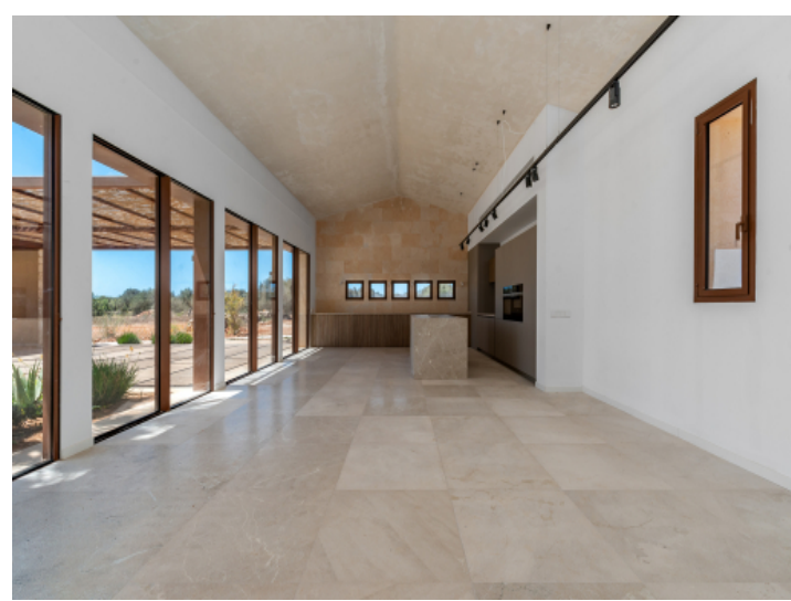
Kitchen and living area