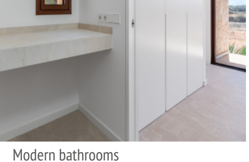
All bedrooms with bathroom en suite