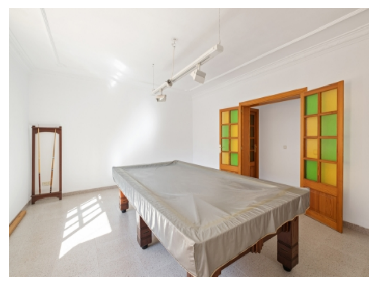
Hobby room with pool table