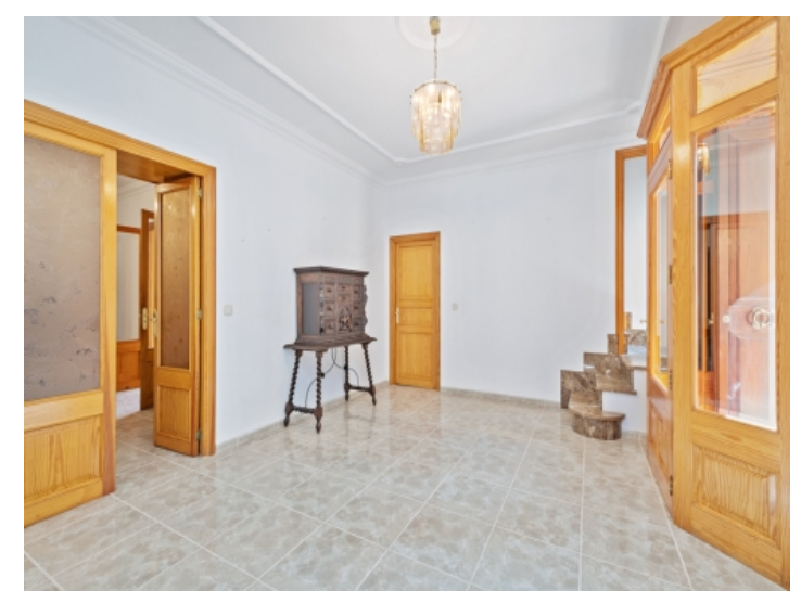
Elegant entrance area