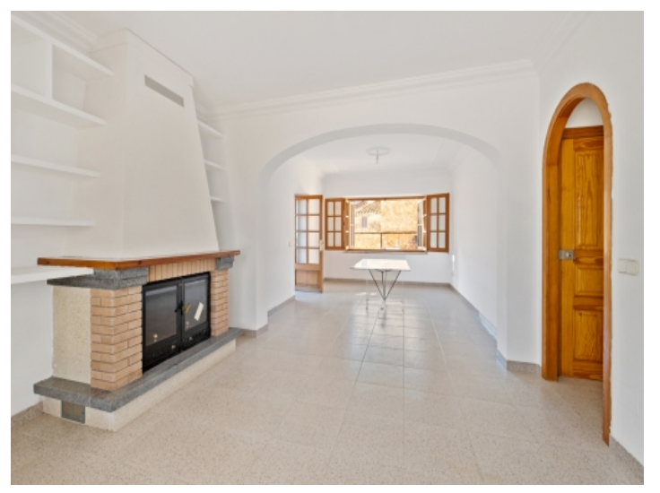
Living area with fire place