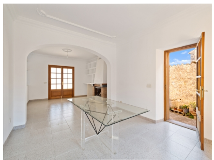
Cozy living area with fire place