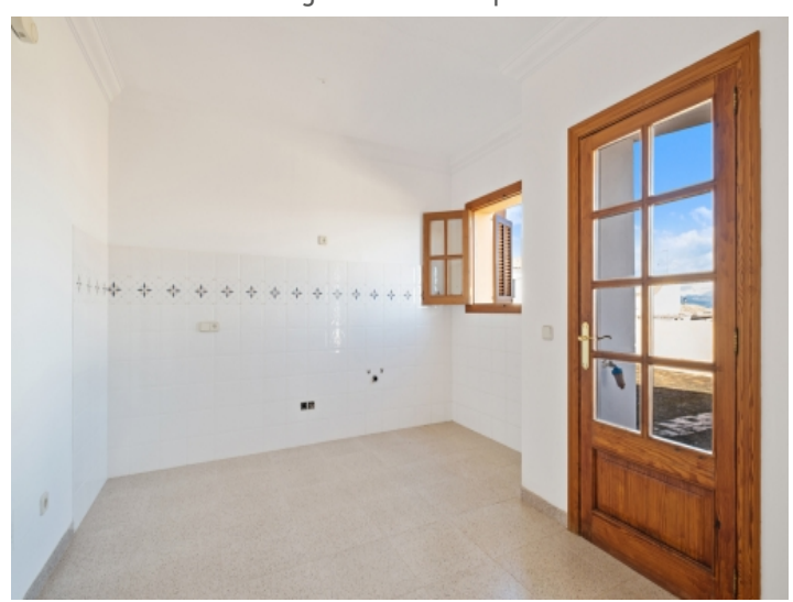
Kitchen with access to the terrace