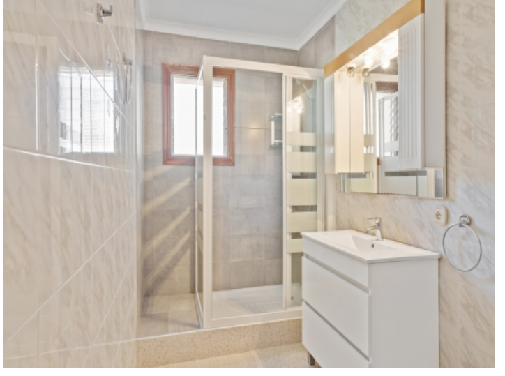
Bathroom with shower