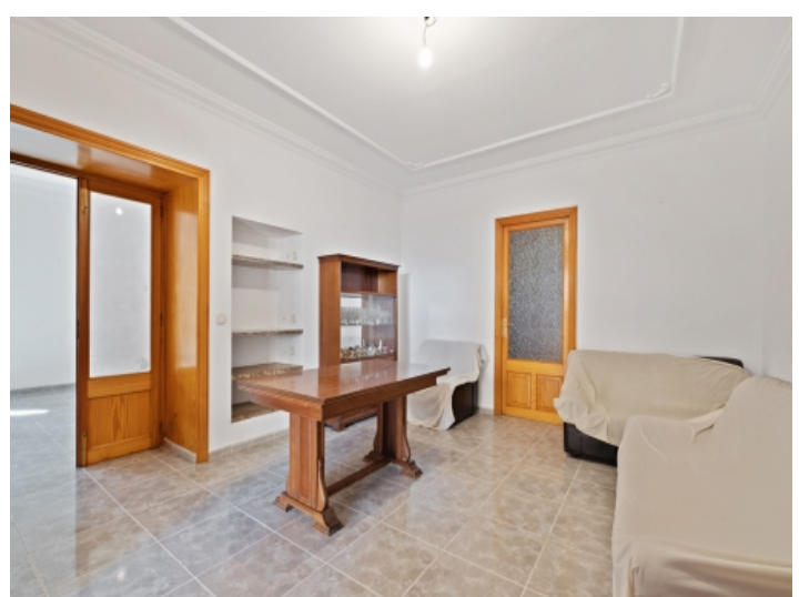
Second living area