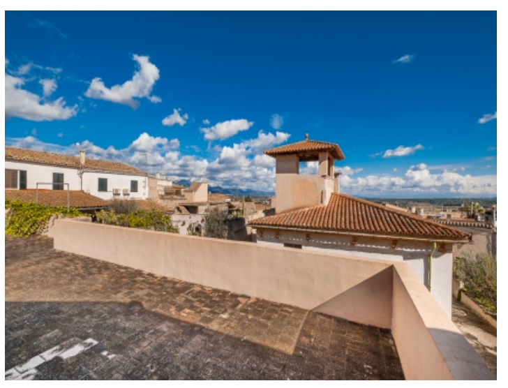
Large terrace with a view