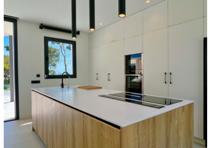
Dining area Kitchen