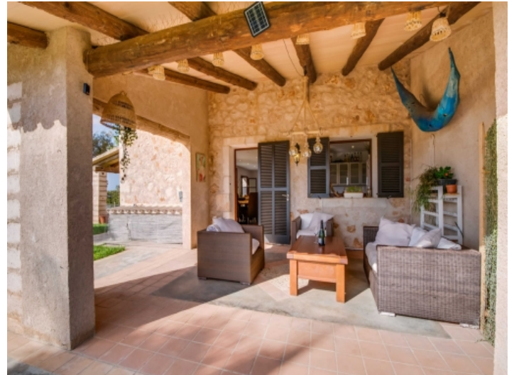
Covered lounge area