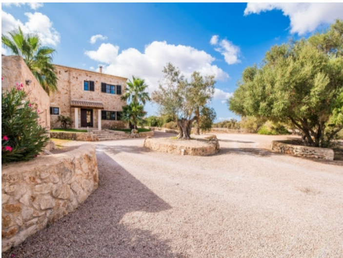
Driveway to the finca