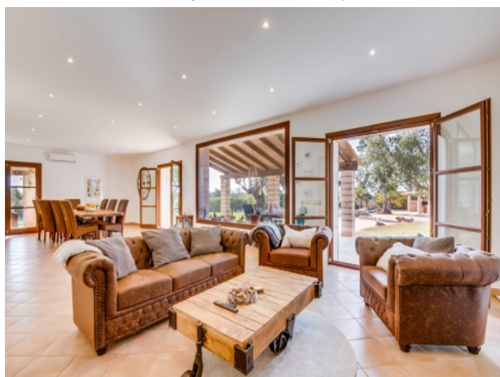
Bright living area with terrace access