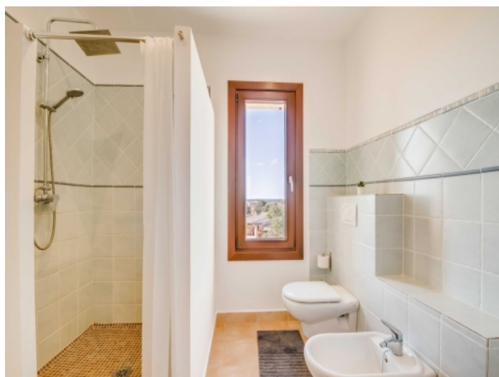
One of 4 bathrooms