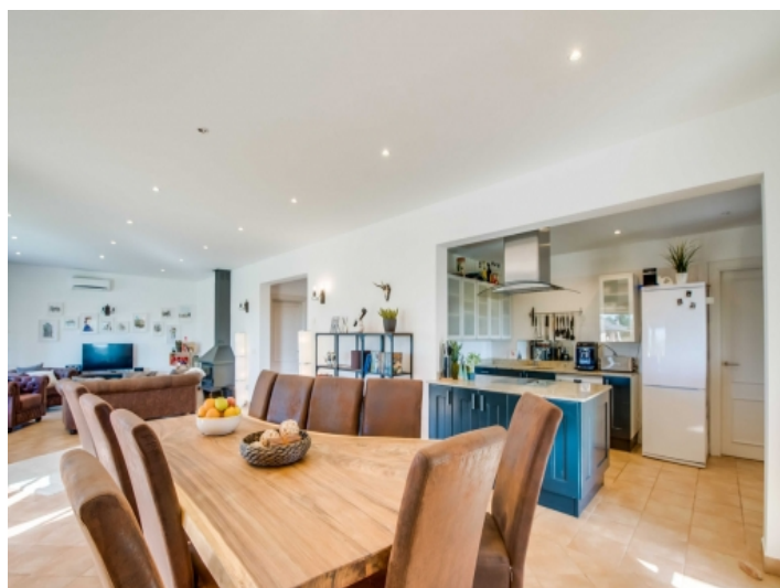
Open dining area