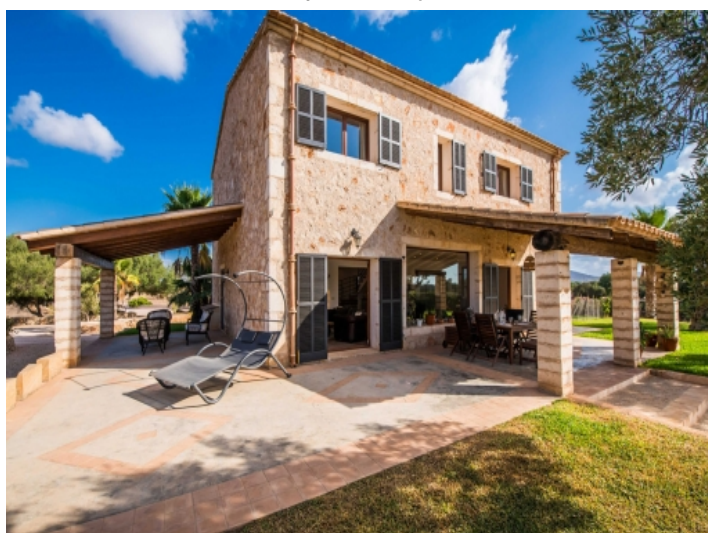
Large covered terrace