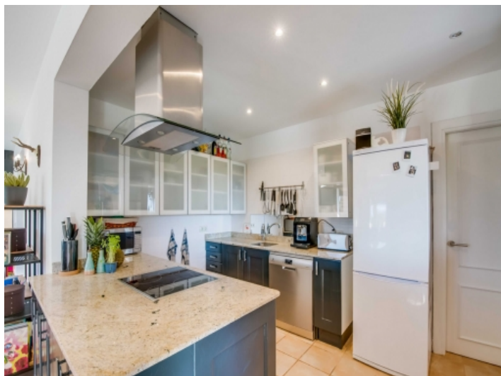
Modern kitchen with cooking island