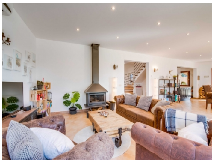
Beautiful living area with fireplace