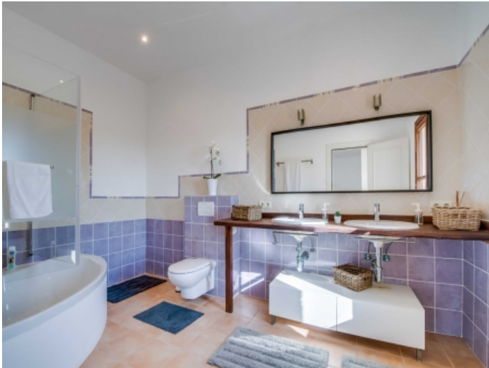
One of 4 bathrooms