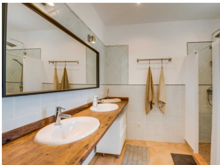
One of 4 bathrooms