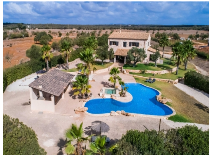
Bird's eye view of the finca