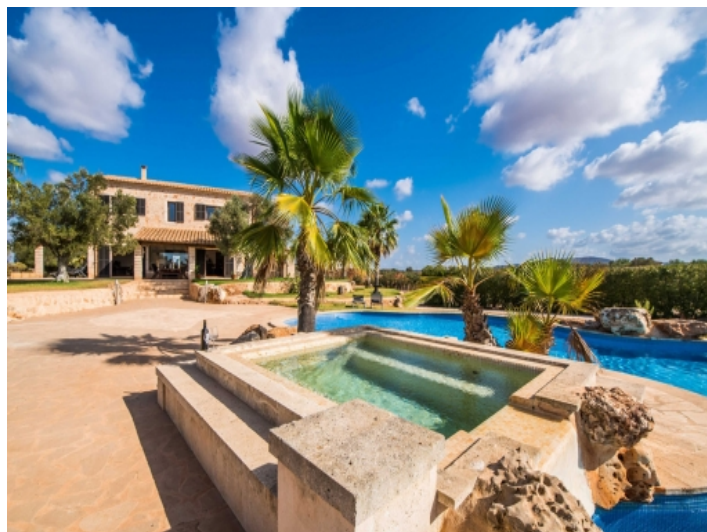
Private jacuzzi next to the pool