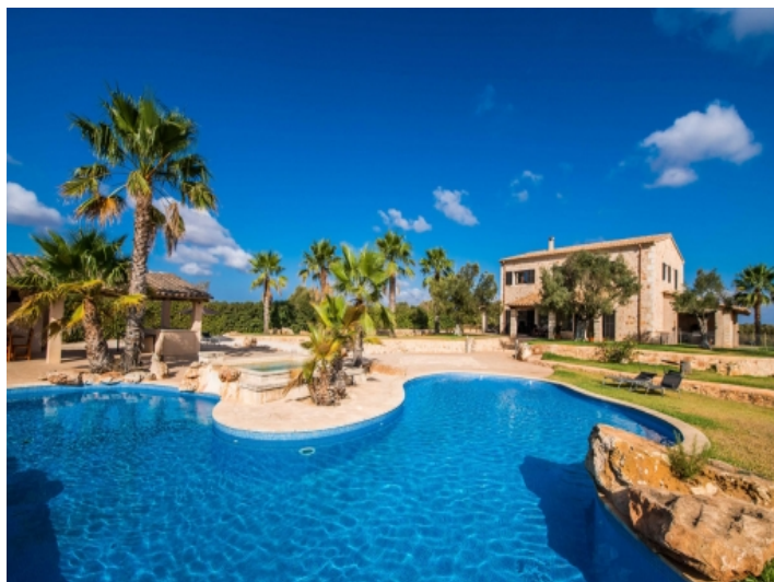
Beautifully laid-out pool area