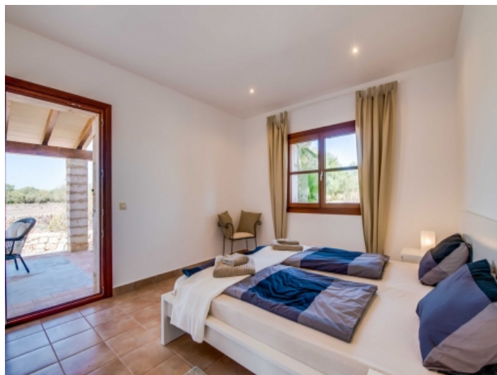
Double bedroom with terrace access