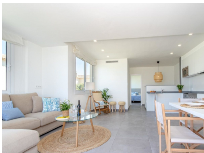
Modern living and dining area