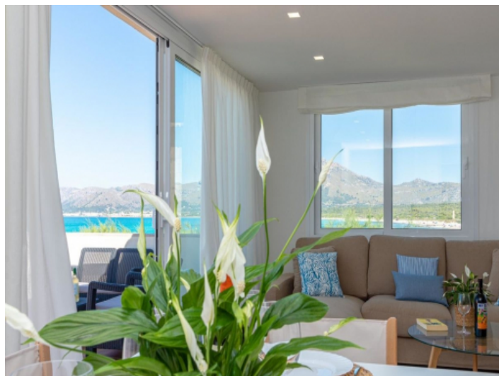
Access to the living area