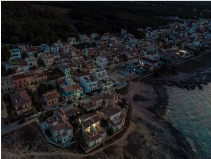
Bird's eye view of the duplex