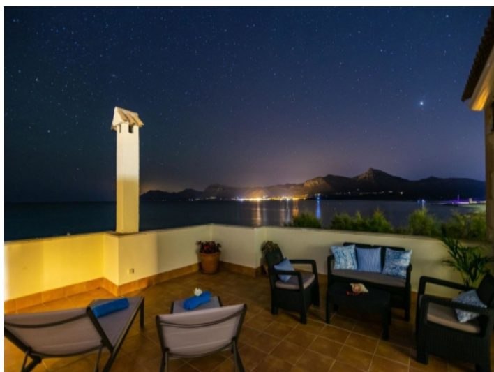
Roof terrace by night