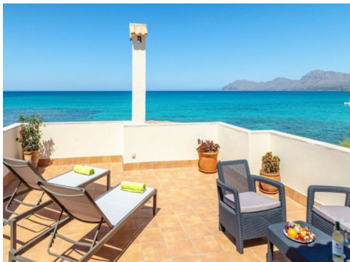
Stunning sea view terrace