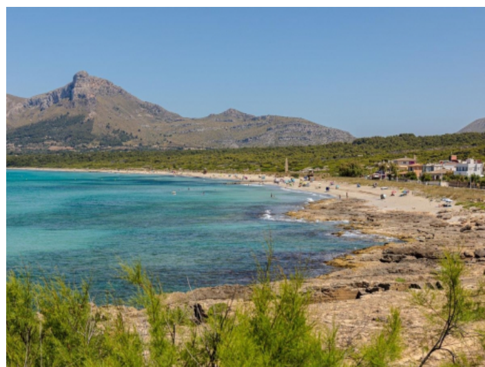
Beach of Son Serra de Marina