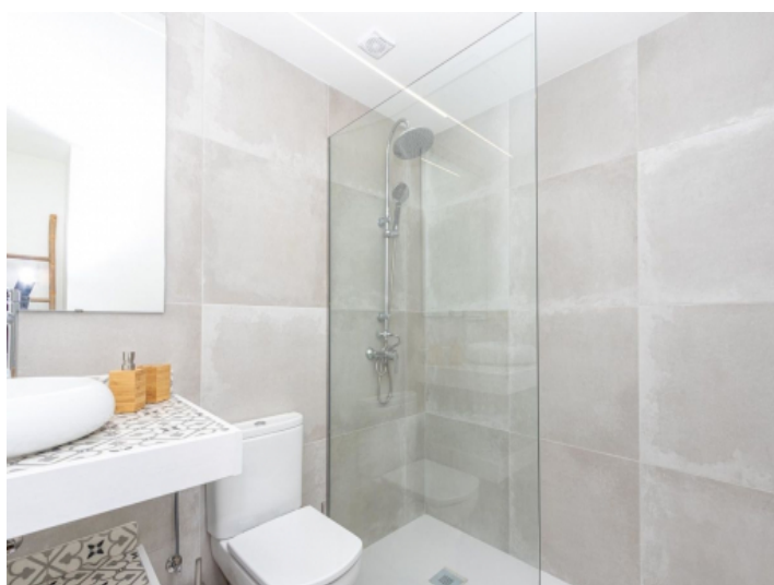
Modern shower bathroom