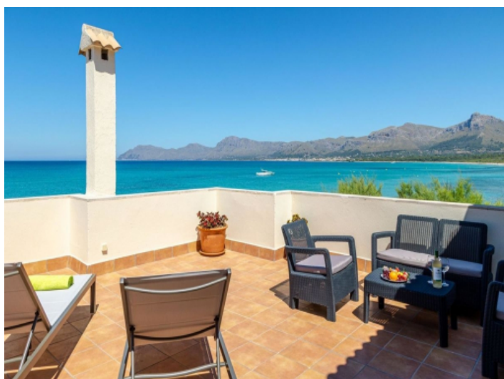
Dreamlike sea view terrace