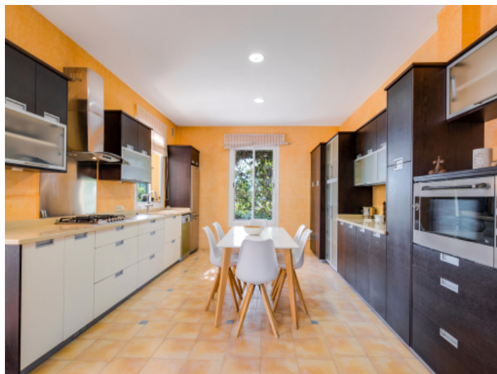
Large, modern kitchen