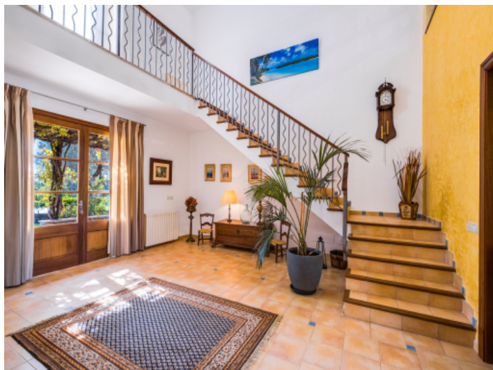
Inviting entrance hall