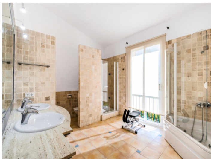
Modern en suite bathroom