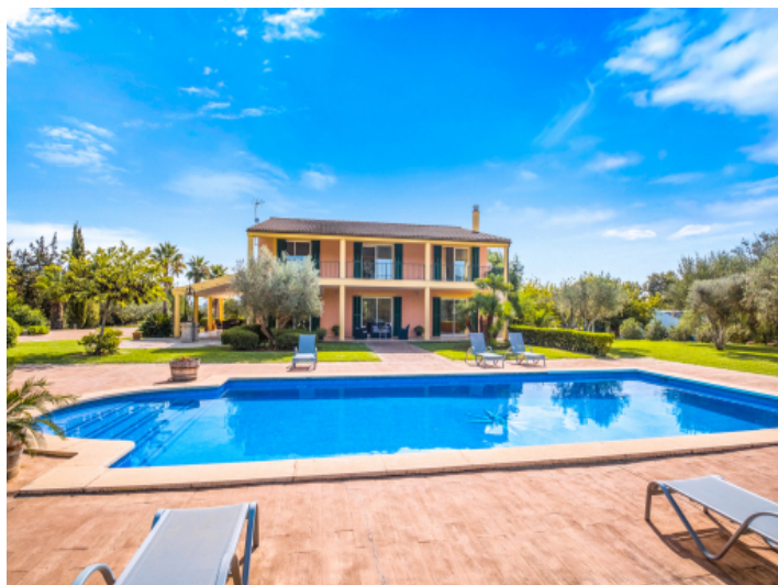
Exterior view and beautiful pool area