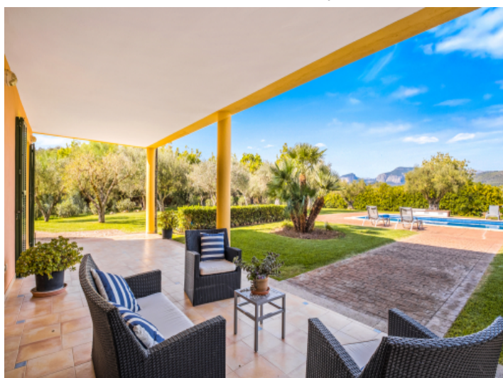
Covered lounge terrace of the living area