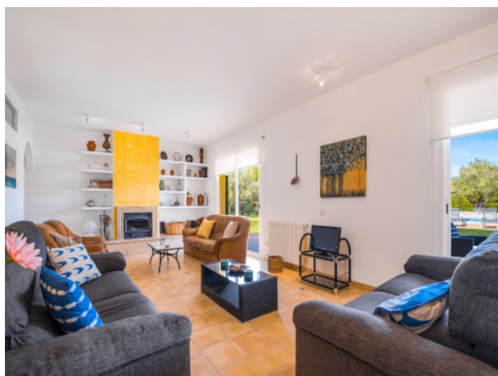
Large, light flooded living area