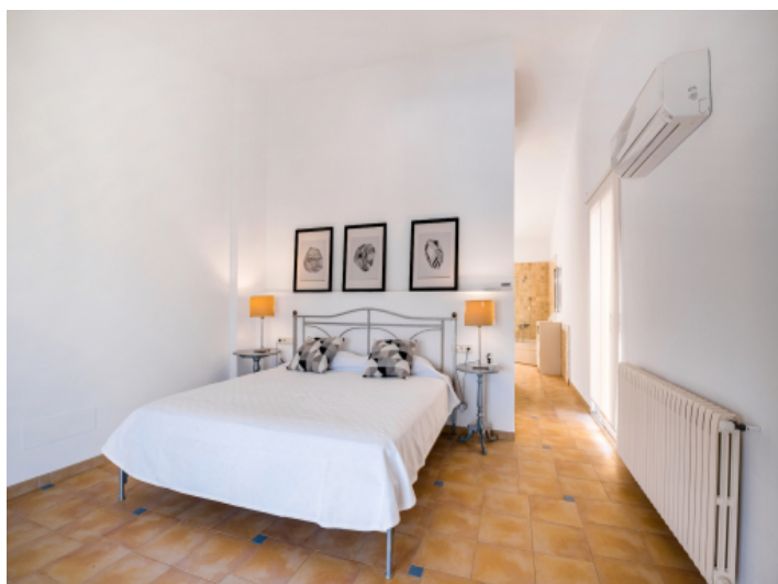
Bedroom with open en suite bathroom