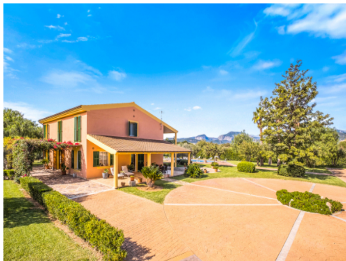
Extensive outdoor area with terraces