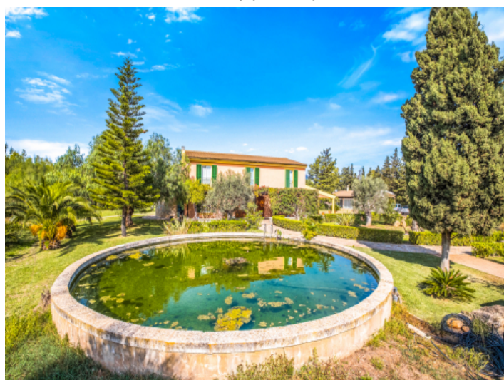
Wonderfully laid-out garden with ponds