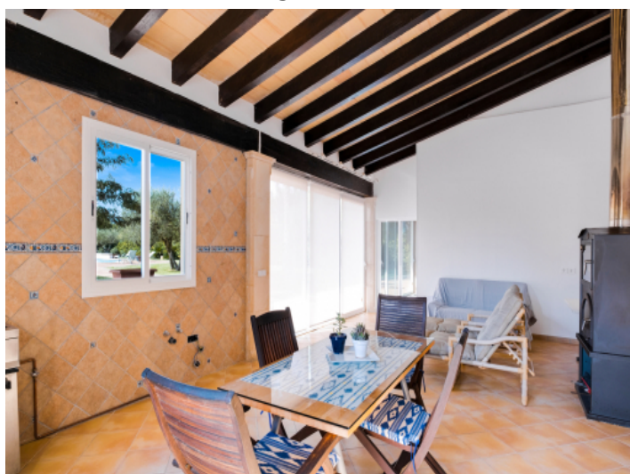
Separate guest house