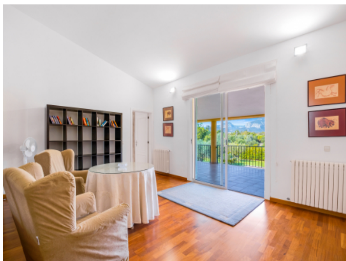
Further living room on the upper floor