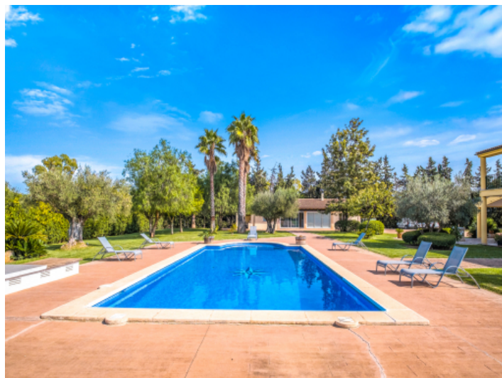
Luxurious, very private pool area