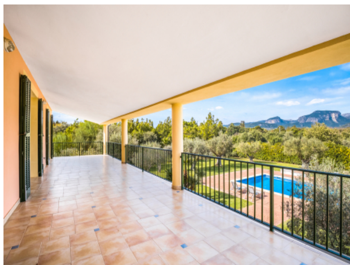
Covered upper terrace with mountain views