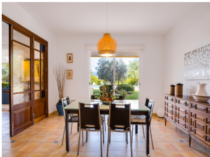
Bright dining area with terrace access