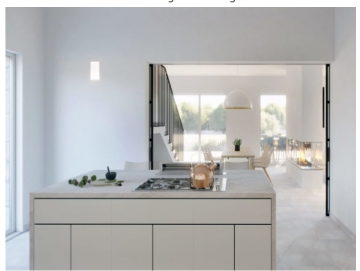
Cooking island with view to the dining area