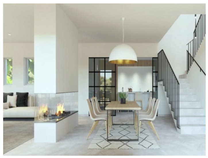
Modern living and dining area