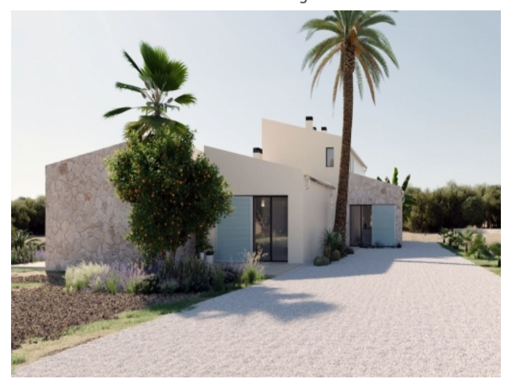
Exterior view and terraces