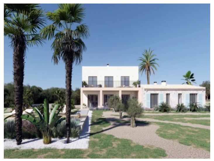
Exterior view and garden