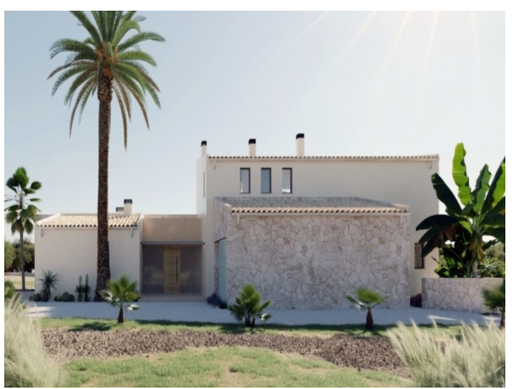
Front view and entrance