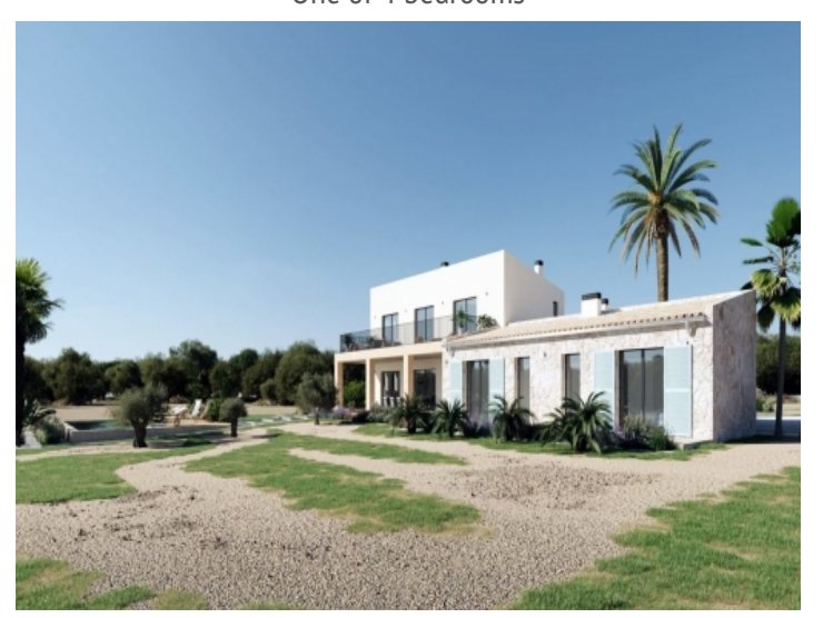
Exterior view and garden