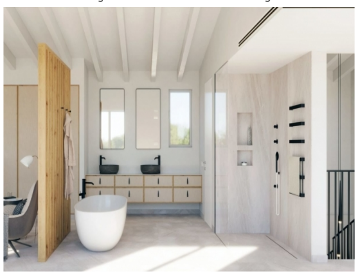
NOble en suite bathroom