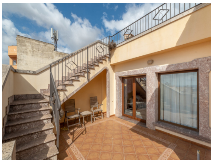
Terrace with access to the rooftop