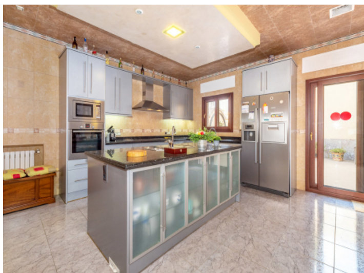
Fully equipped kitchen with cooking island