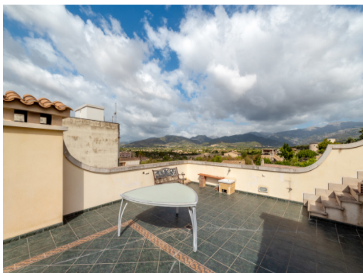
Roof terrace with mountain view