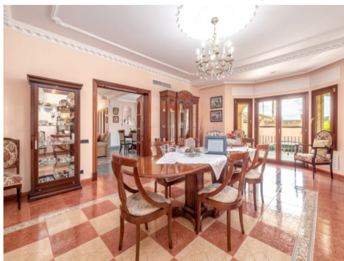
Traditional dining area