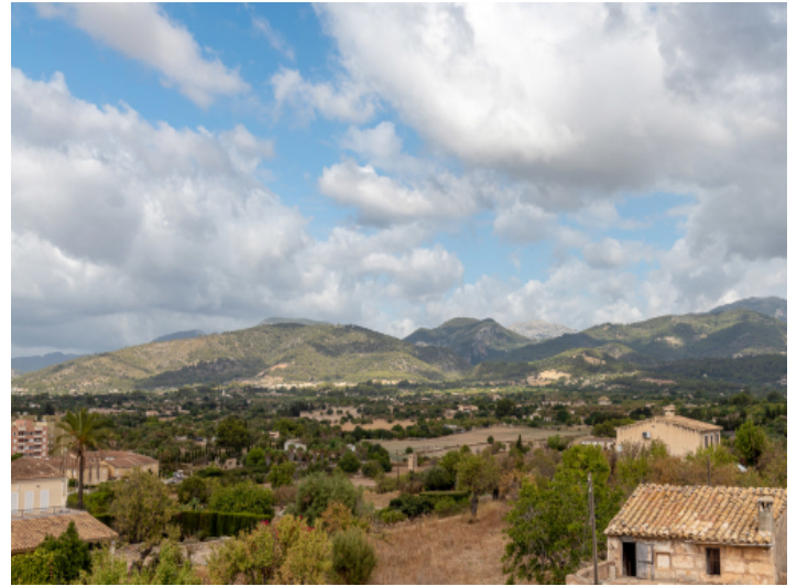
Views to the Sierra de Tramuntana