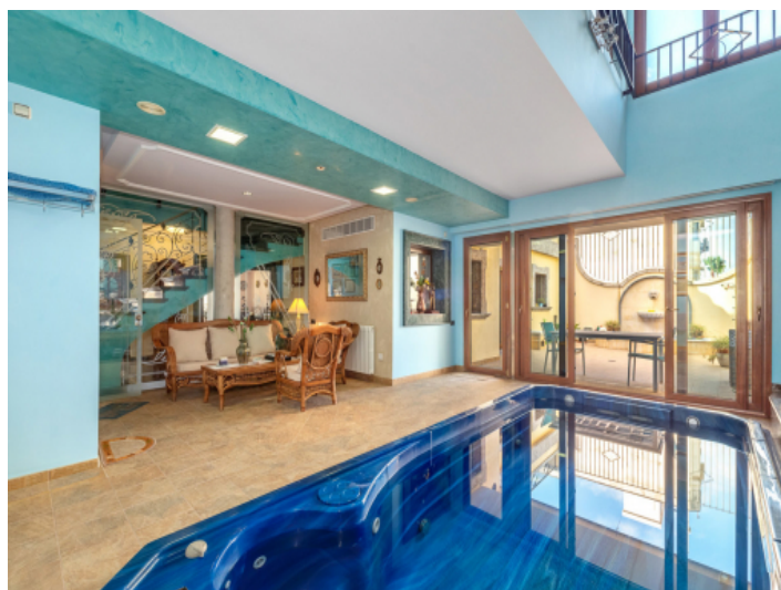
Light flooded spa