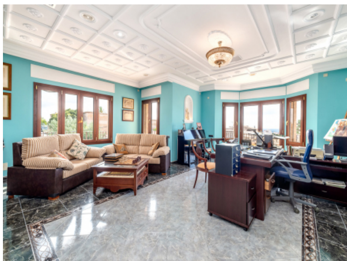
Office and living room