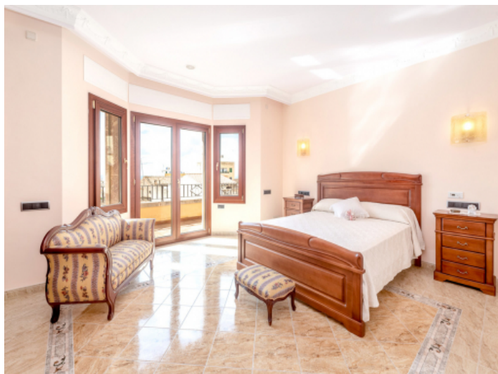
Second double bedroom