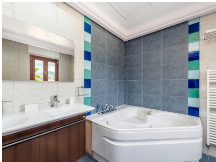
One of 5 bathrooms