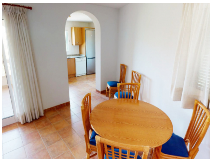
Inviting dining area