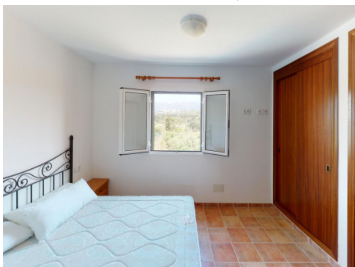
Master bedroom with built-in wardrobe