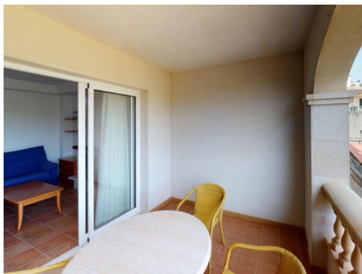
Covered dining area on the terrace