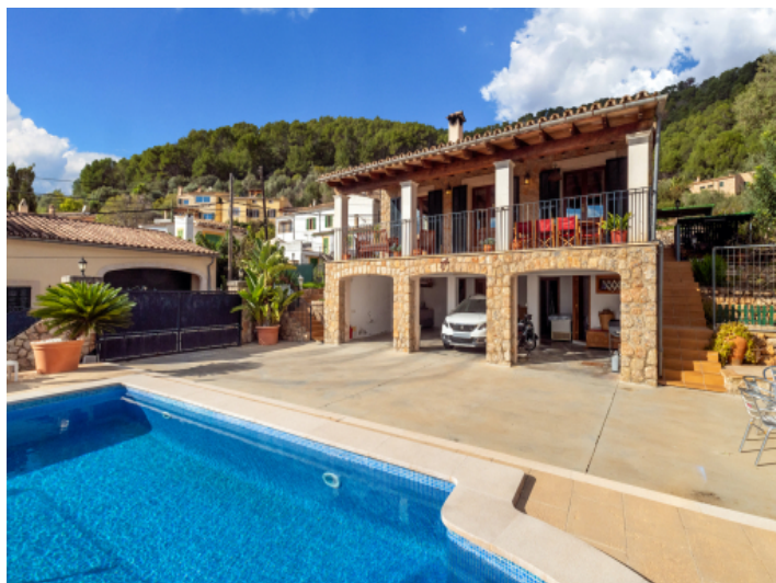
Pool area and terrace