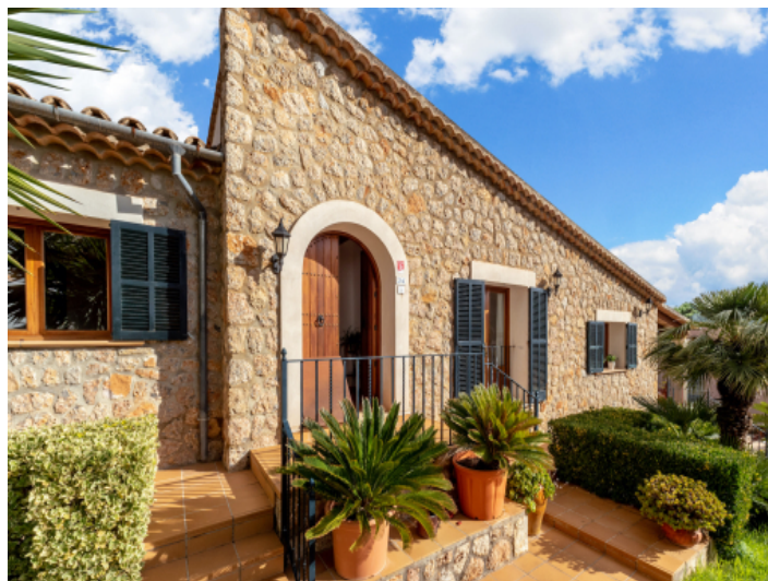
Access to the house