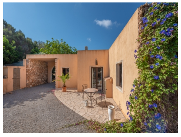
Idyllic terrace next to the house