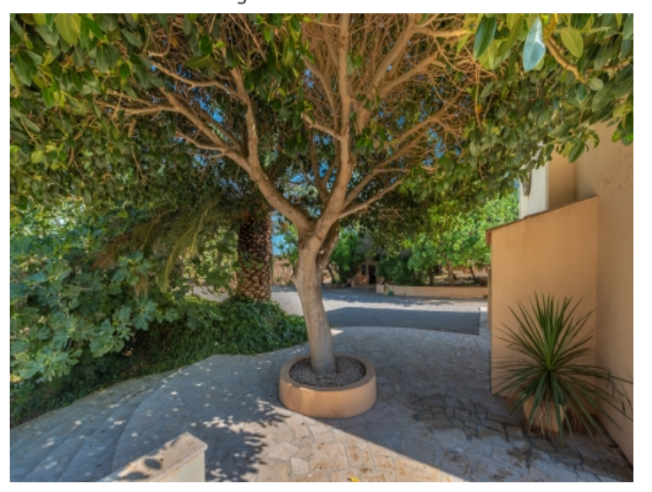
Lovely outdoor area