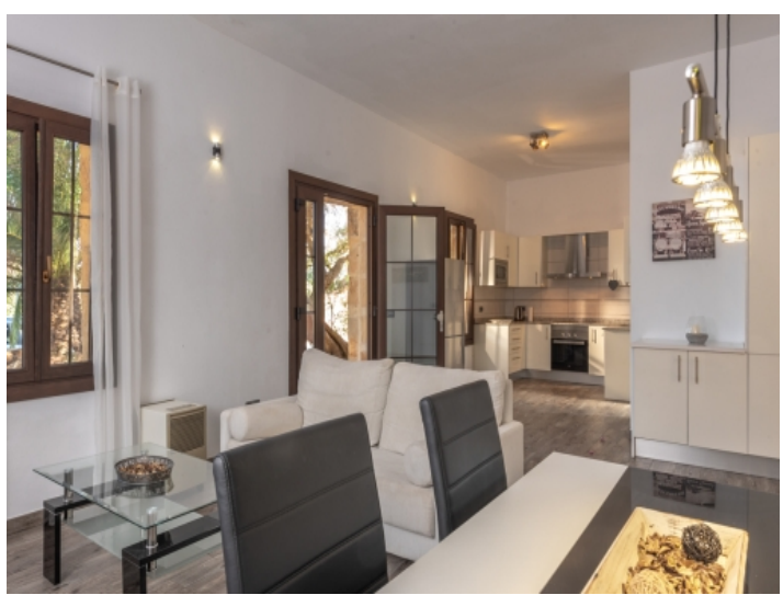
View to the entrance and kitchen