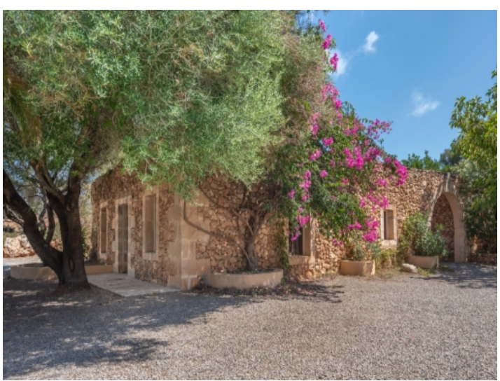
Finca building with charme