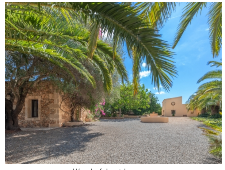
Wonderful outdoor area