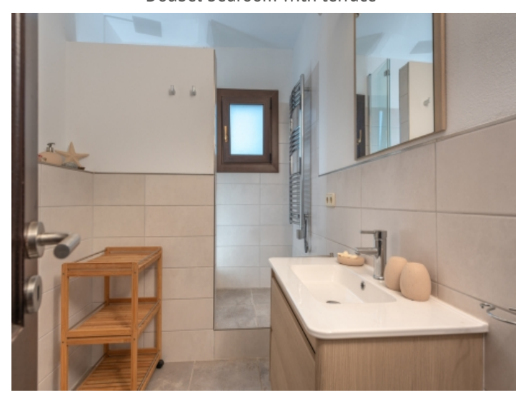
Modern shower bathroom