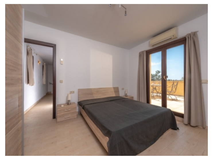
Doubel bedroom with terrace