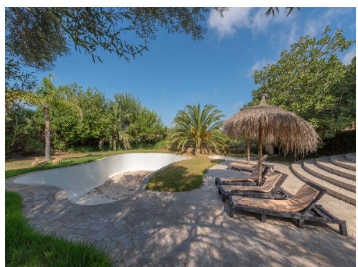
Pool area in absolute privacy