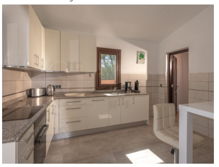
Modern kitchen in white