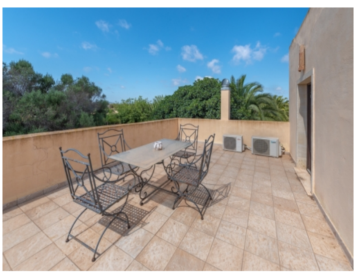
Spacious upper terrace