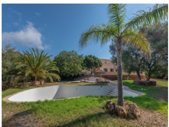
Mediterranean pool area and finca