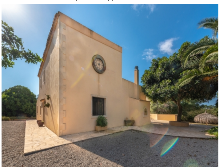
Exterior view of tthe main huse