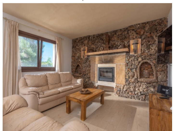
Living area with rustic stone wall