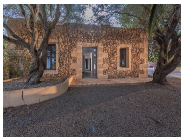
Stone-clad guest house