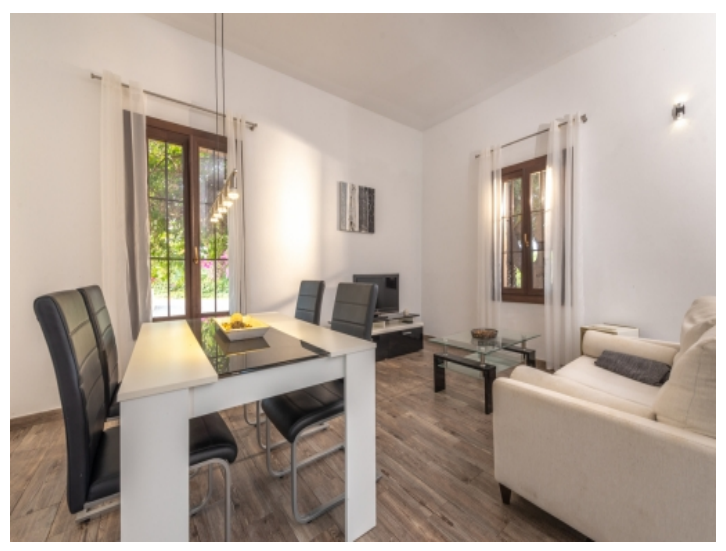
Living and dinin area of the guest house