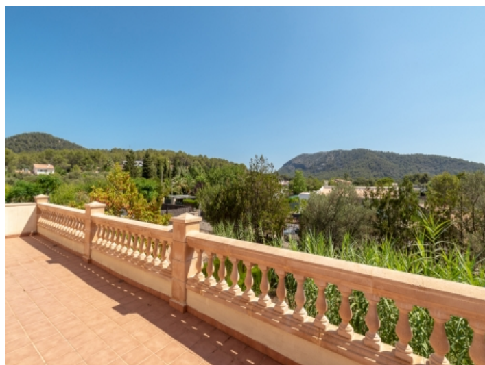
Upper terrace with a view