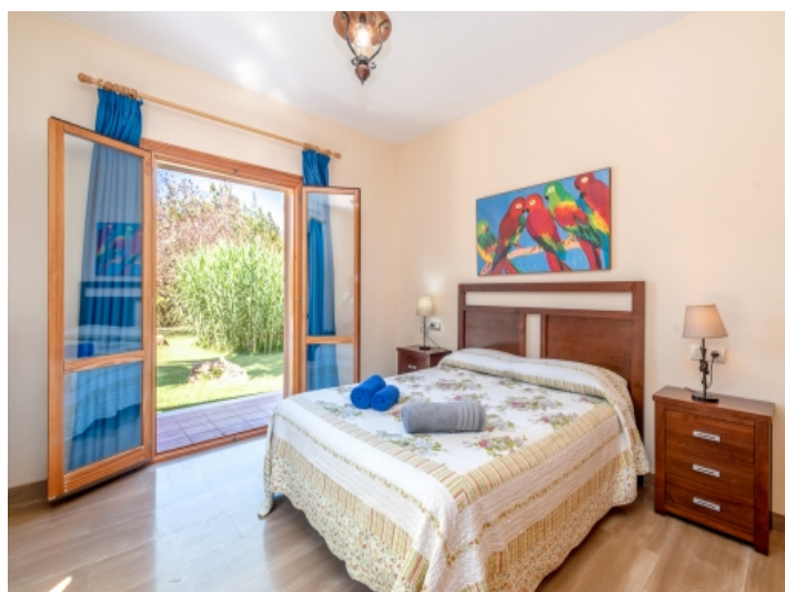
Double bedroom with garden access