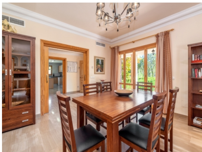
Bright dining area with terrace access