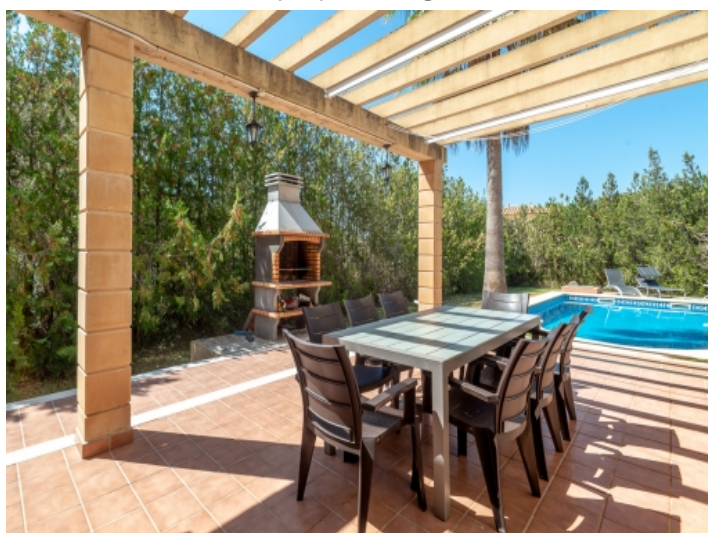
Beautiful terrace with bbq