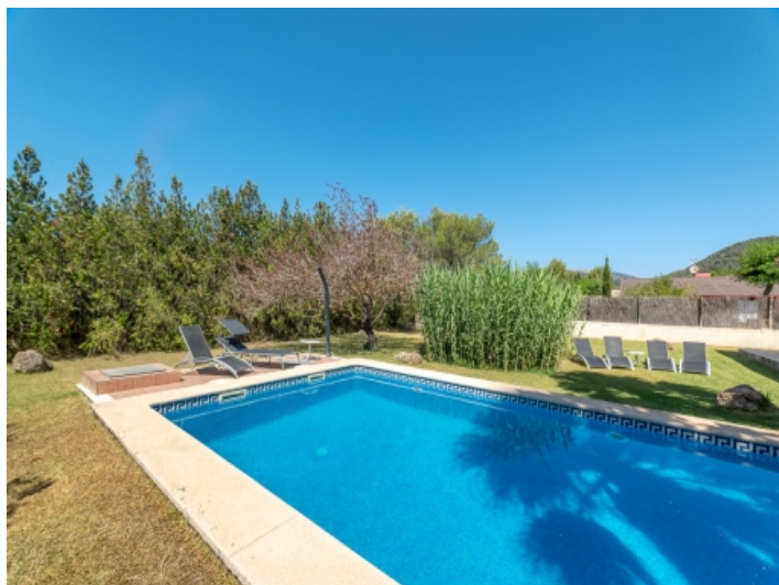
Tranquil pool and garden