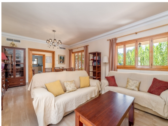
Spacious living and dining area