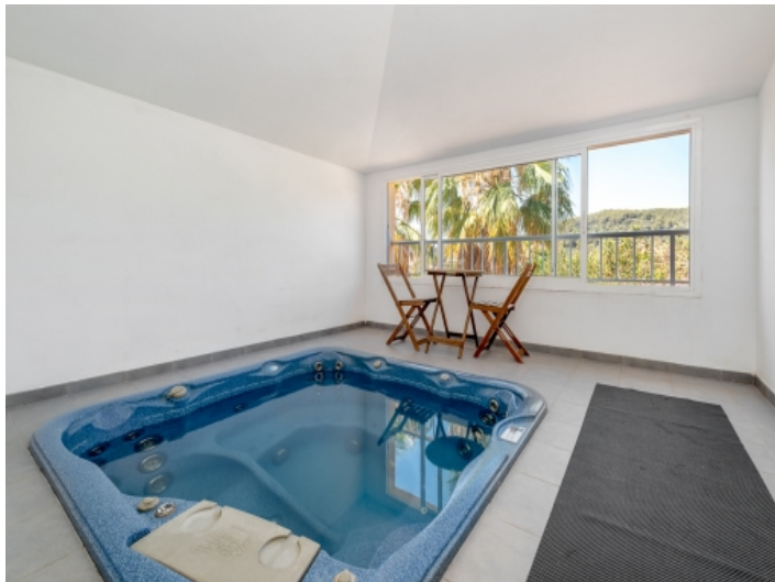
Additional room with jacuzzi