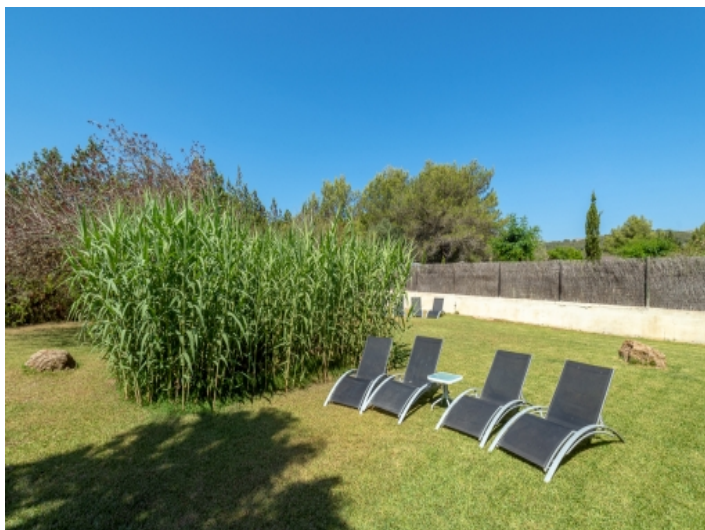
Garden with privacy