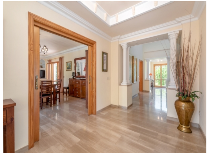
Inviting hall and corridor