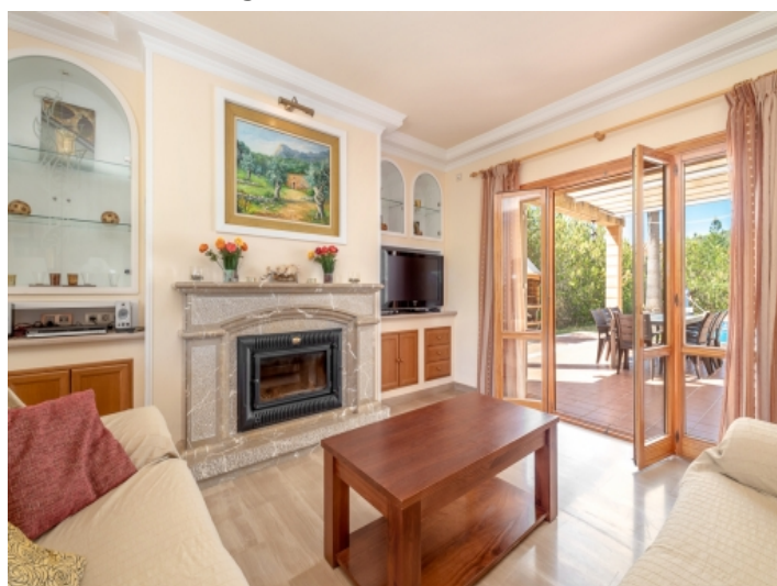
Living area with terrace access