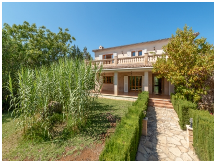
Front garden and access to the house