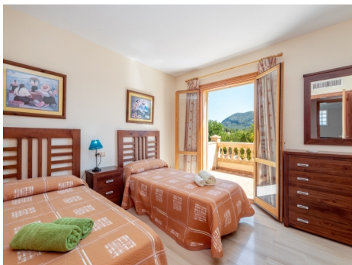
Bedroom with access to the upper terrace