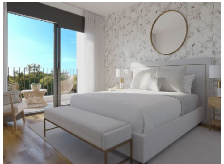
Noble double bedroom with balcony