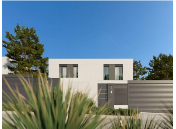
Exterior view of the house