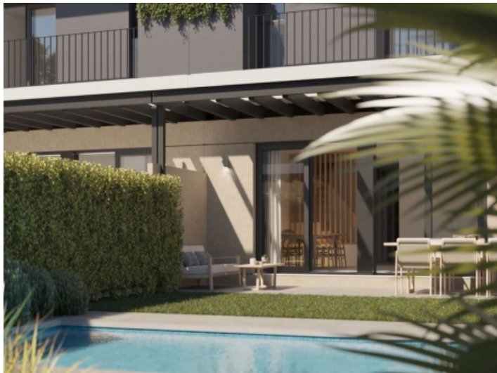
Garden and pool