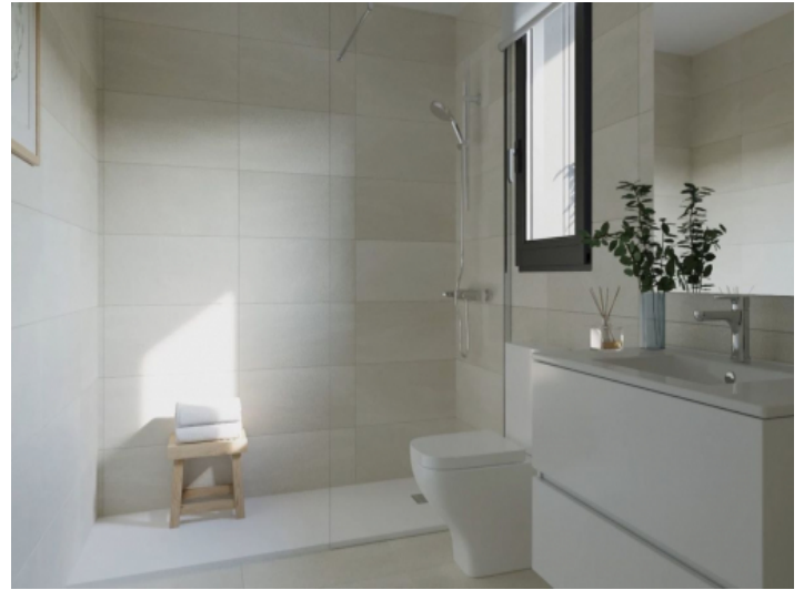
Elegant bathroom with walk-in shower