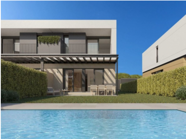
View from the pool