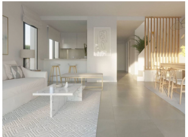
Alternative view of the living area