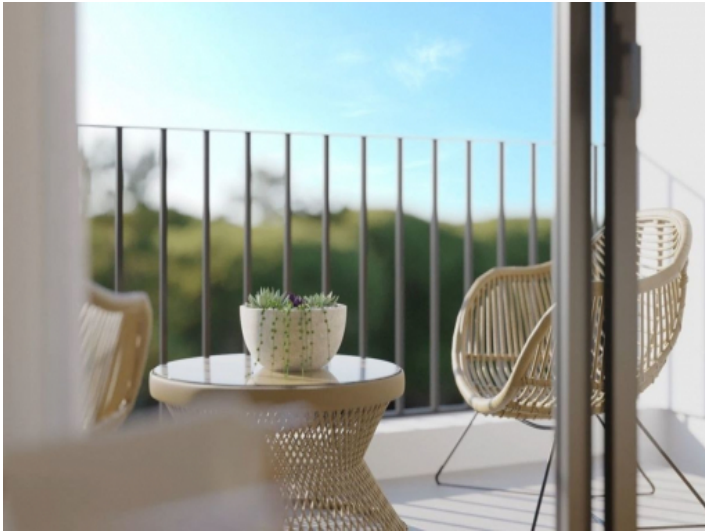
View to the balcony