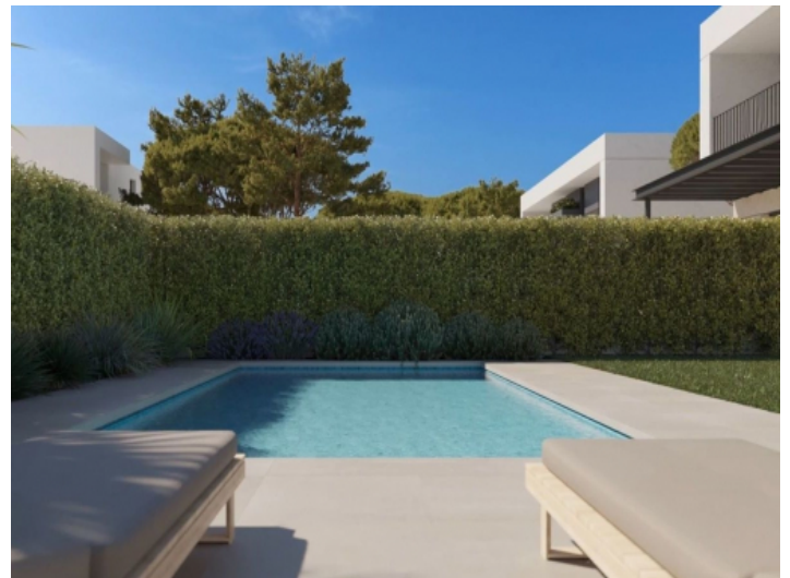
Sun loungers by the pool