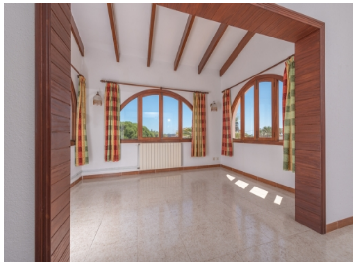
Lightflooded living and dining area