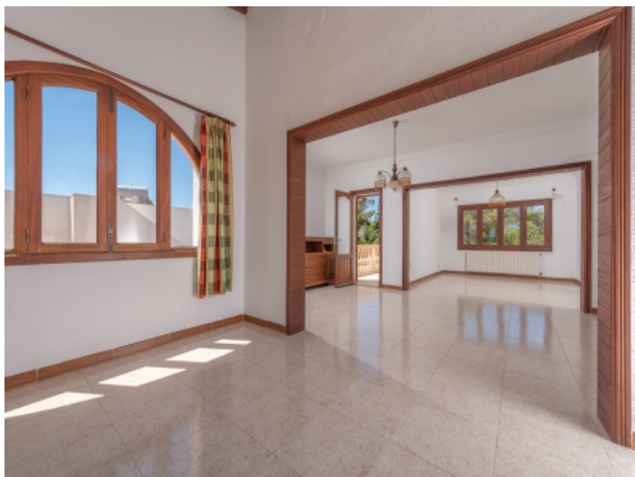
Large living and dining area