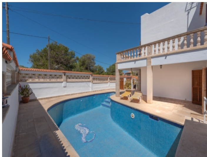
Private pool area