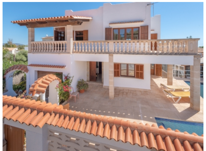
Front view and entrance to the house