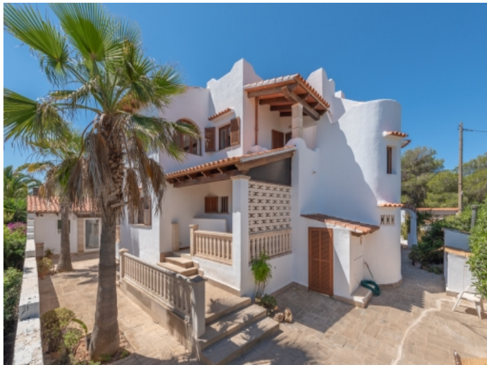
Exterior view of the large chalet