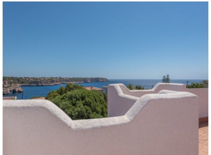
Beautiful sea views