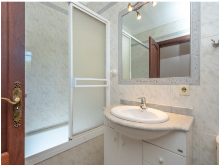
One of 2 bathrooms