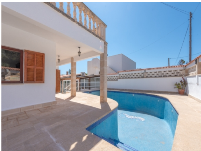
Sunny pool area