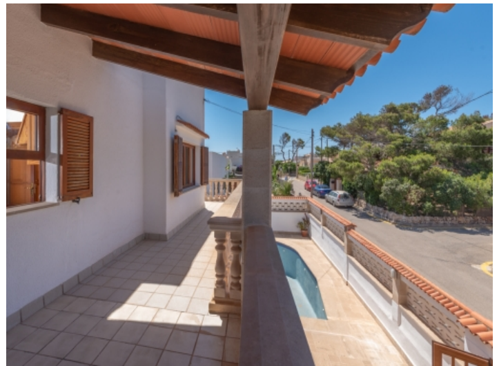
Covered balcony on the upper floor