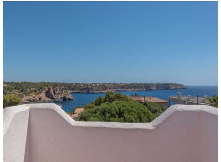
Wonderful sea views from the roof