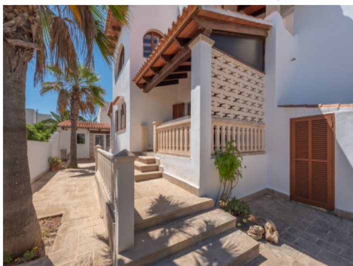
Outdoor area and terraces