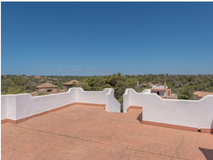
Large roof terrace with sweeping views