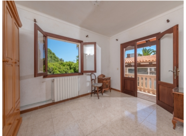
One of 3 bedrooms