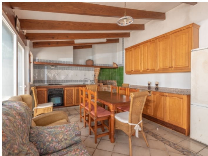
Summer house with kitchen next to the pool