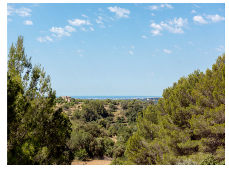
Wonderful panoramic views as far as the sea