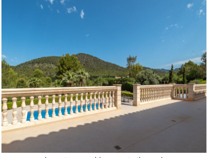
Large terrace with access to the pool