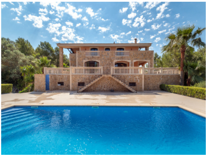
Outstanding country house in an absolutely beautiful location