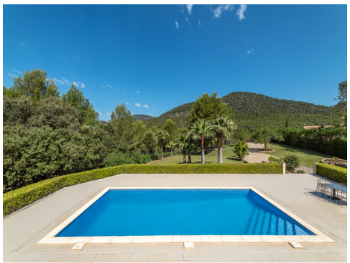
Pool in absolute privacy