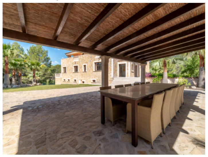
Covered outdoor dining area