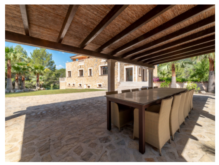
Covered outdoor dining area