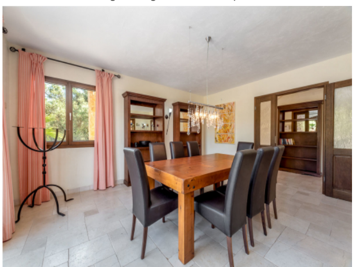
Open dining area