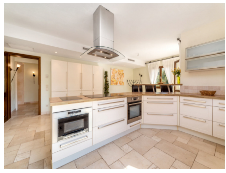
Spacious, modern kitchen