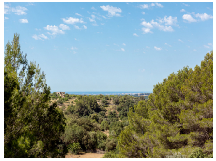
Wonderful panoramic views as far as the sea