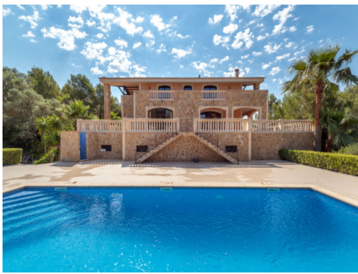
Outstanding country house in an absolutely beautiful location