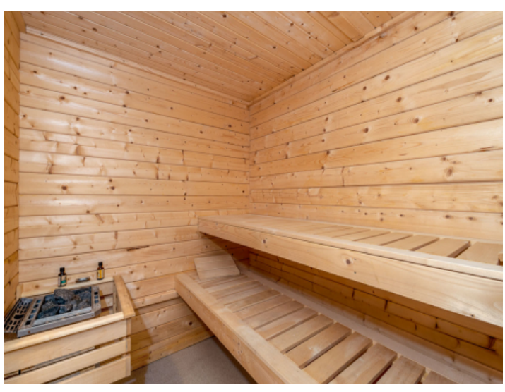
Own sauna and spa area