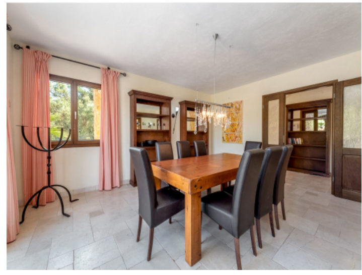
Open dining area