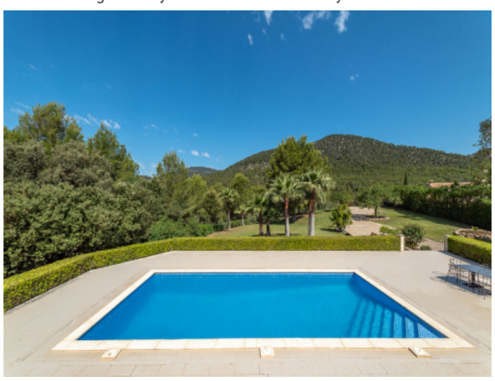
Pool in absolute privacy