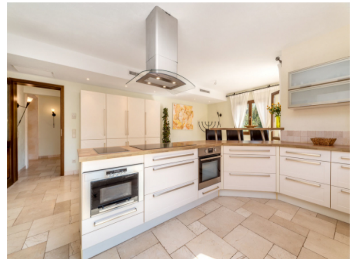
Spacious, modern kitchen