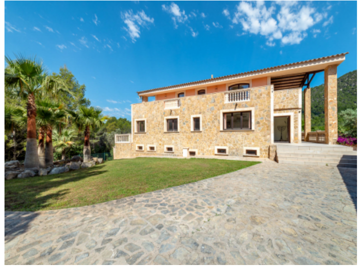
Exterior view and access