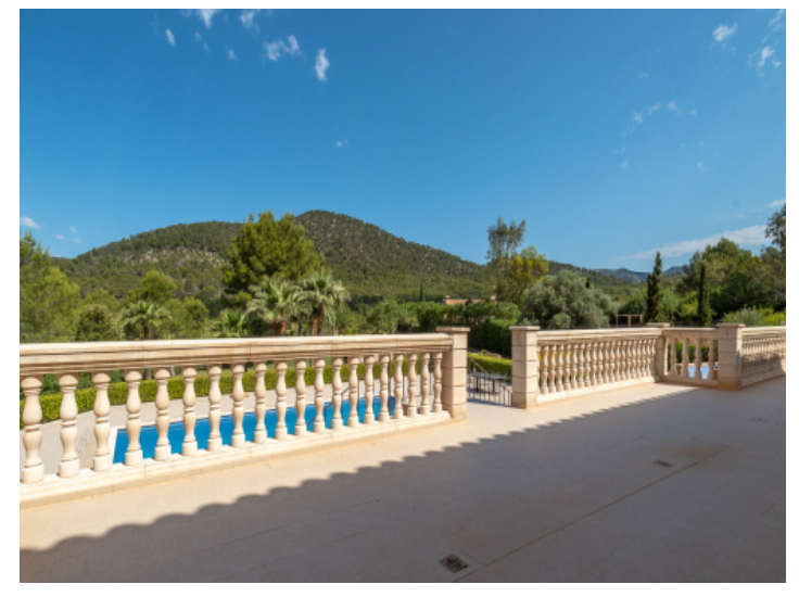
Large terrace with access to the pool