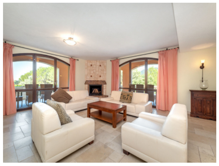
Large living area with fireplace