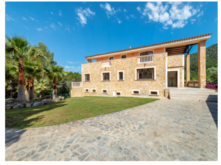
Exterior view and access