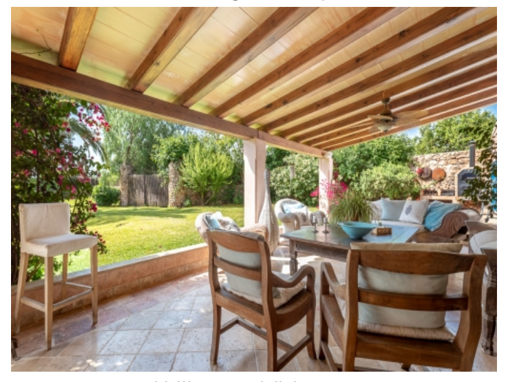
Idyllic covered dining area