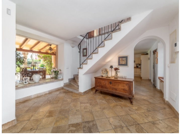
Hall with staircase and large window