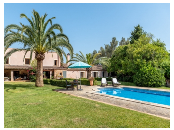
Mediterranean garden and pool area