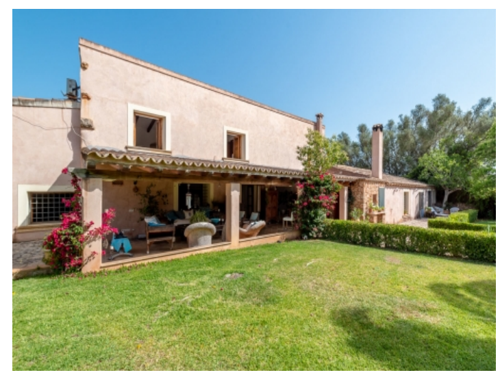
Terrace and beautiful garden