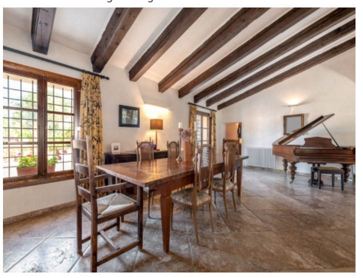
Large, rustic dining area