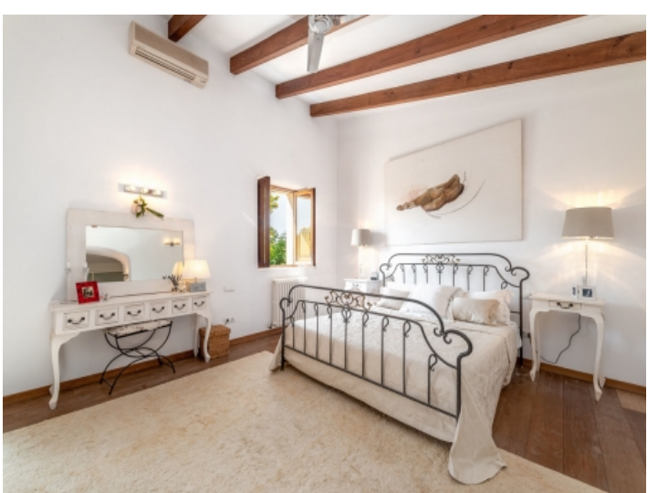
Beautiful master bedroom