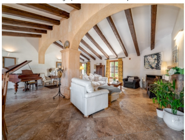
Large living area with stone arch