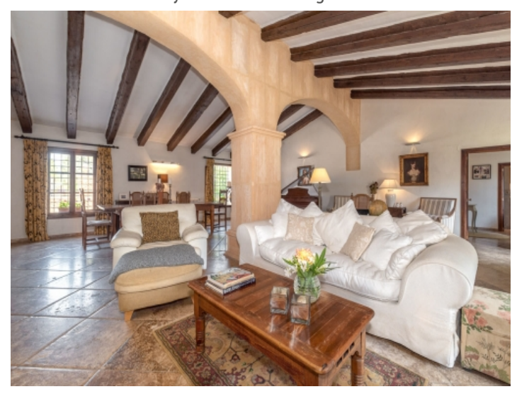
Living area with wooden ceiling beams