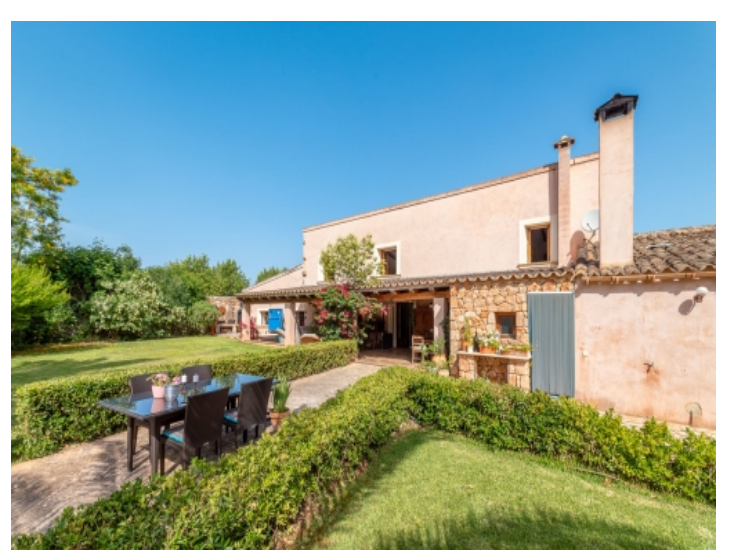
Further terrace in the garden