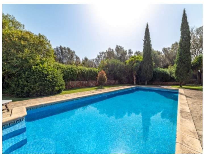
Large pool for summer days