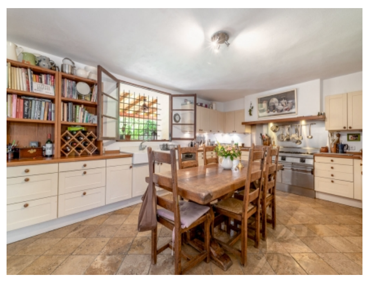
Spacious kitchen with dining area