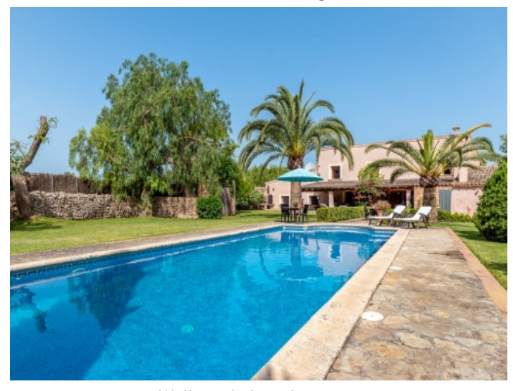
Well-tended outdoor area