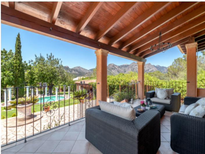
Covered lounge terrace with garden views