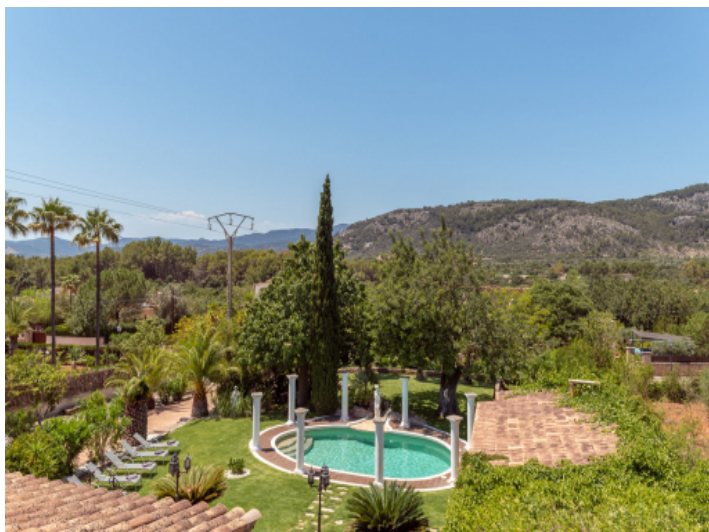
View to the pool and the mountains