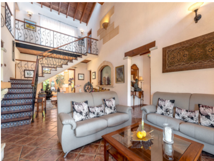
Open living area and stairs