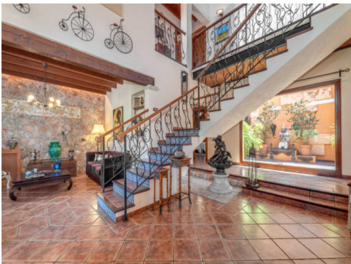
Hall and living area