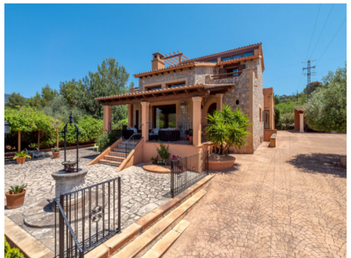
Outdoor area with terraces