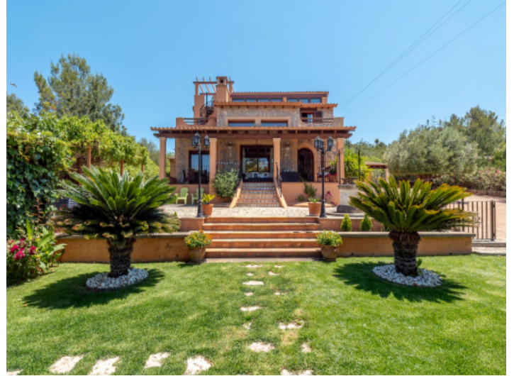
Exterior view from the garden