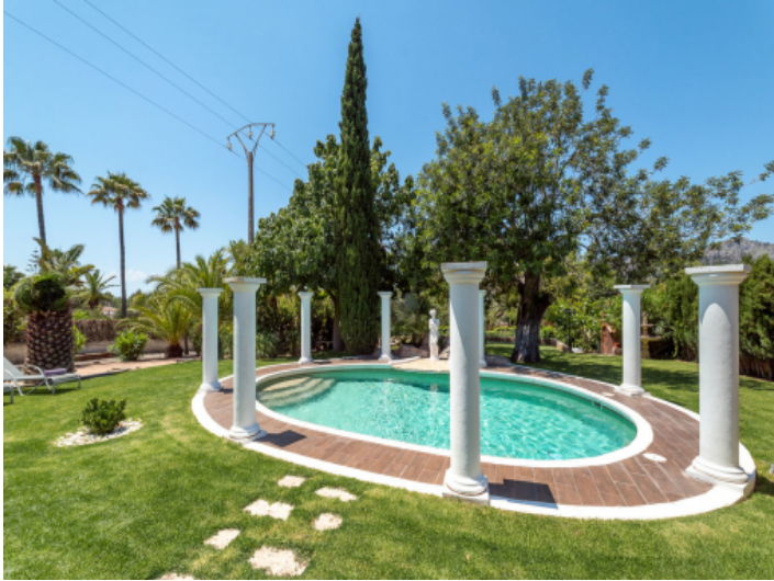
Mediterranean pool area