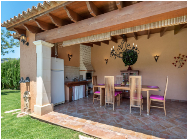
Covered bbq area