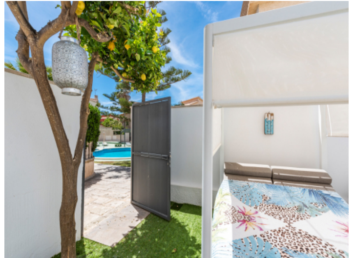
Access to the community pool