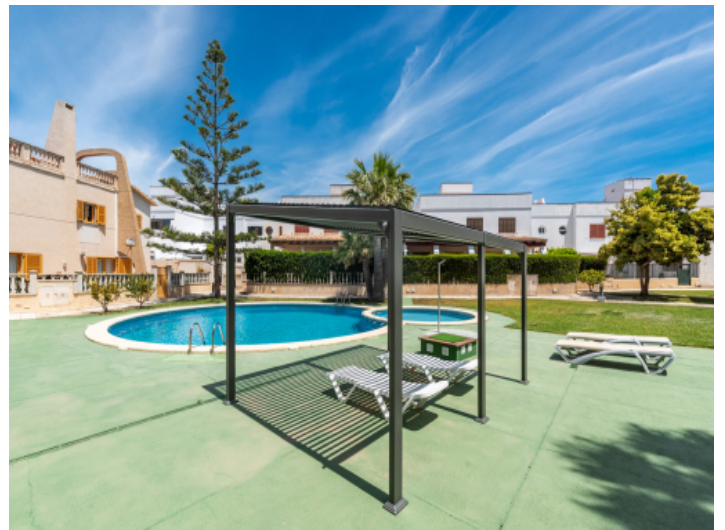
Sun loungers by the pool