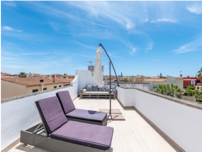
View of the terrace