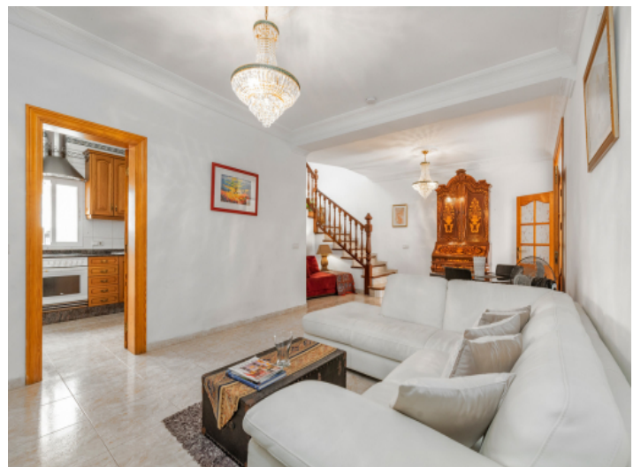
Living area and access to the kitchen