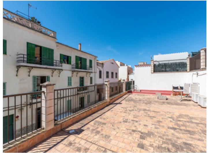
Lower part of the roof terrace