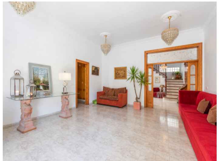
Access to the living area