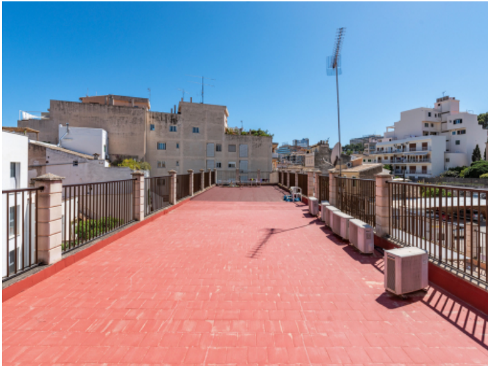
Extensive roof terrace