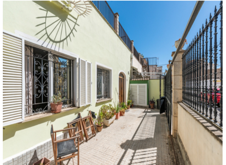
Entrance and front terrace