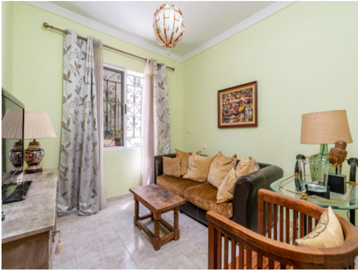
Further living room