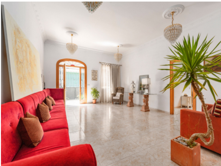
Large entrance hall