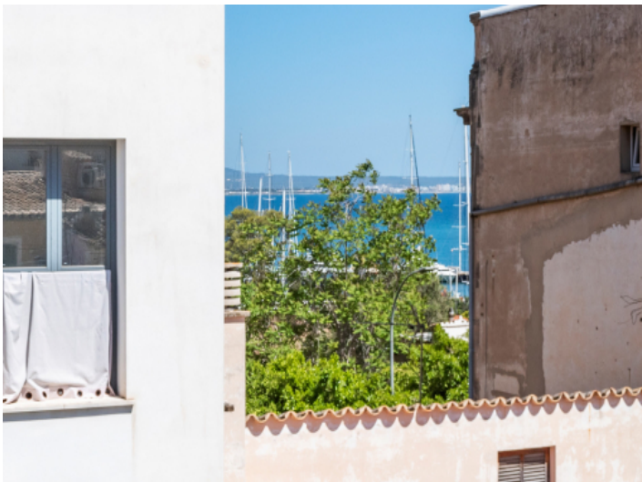
Partial sea views