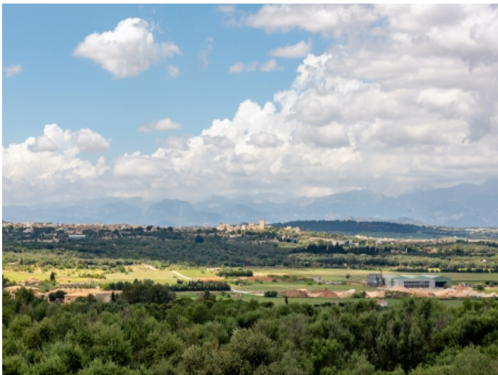
Sweeping views to the Sierra de Tramuntana