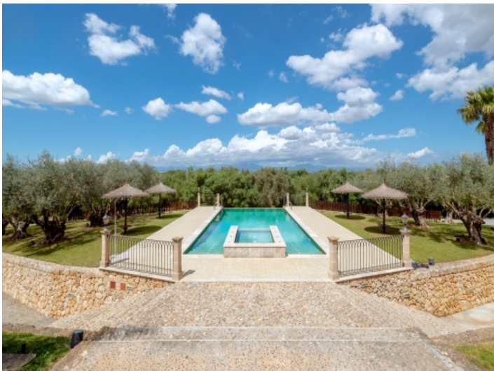
Wonderfully laid-out pool area