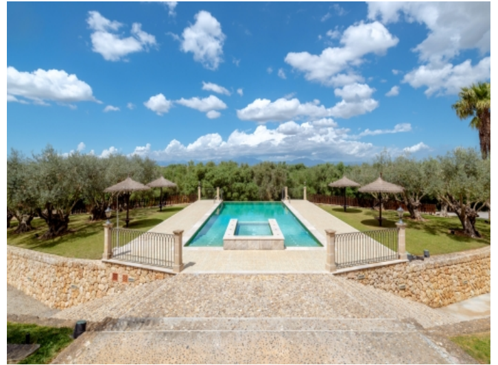
Wonderfully laid-out pool area