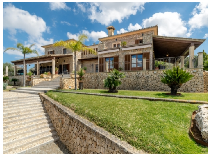
Exterior view of the stone finca