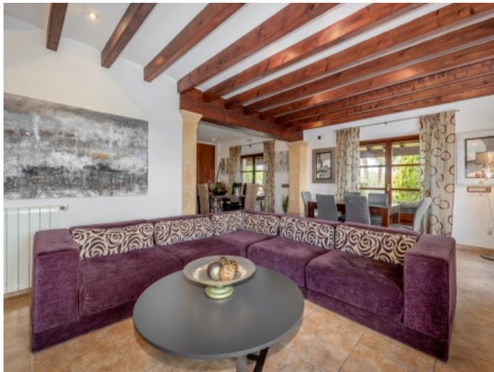
View to the dining area