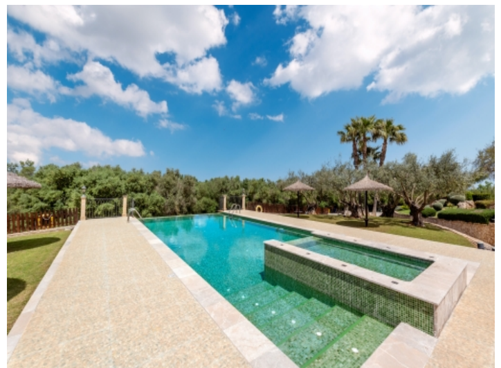
Beautiful, private pool