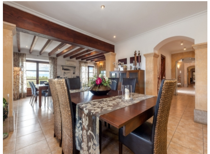
One of 2 dining areas