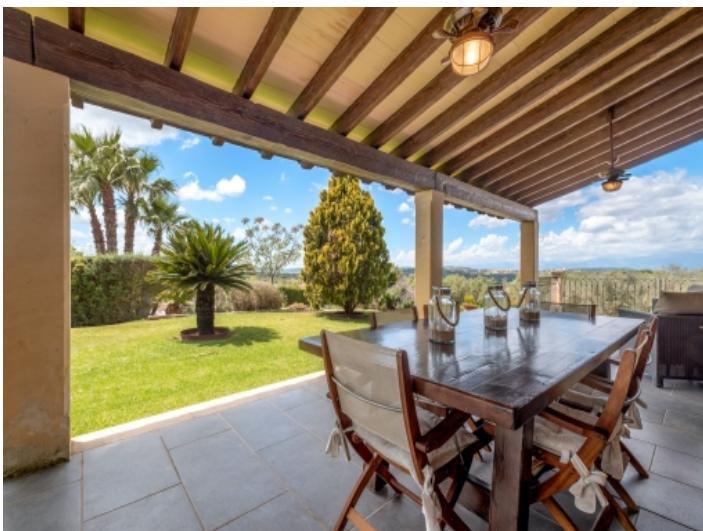
Further terrace with garden with