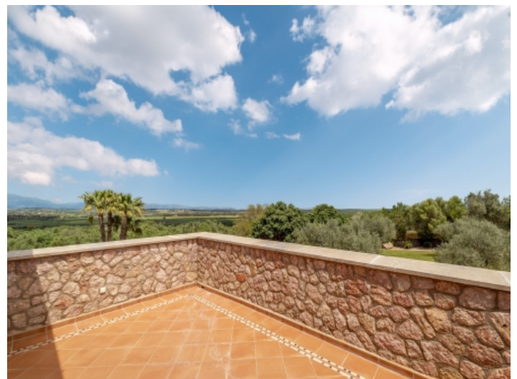
Upper terrace with wonderful views