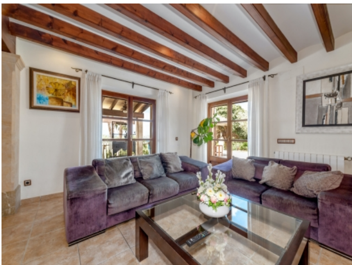
Cozy living area with terrace access