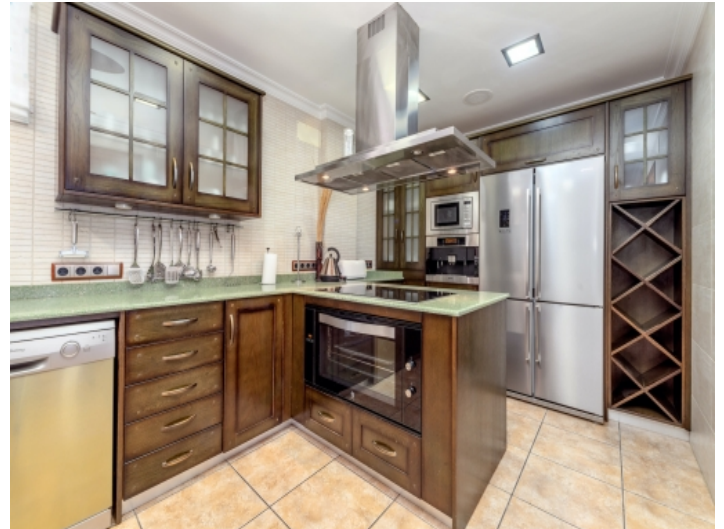
Kitchen of the guest apartment