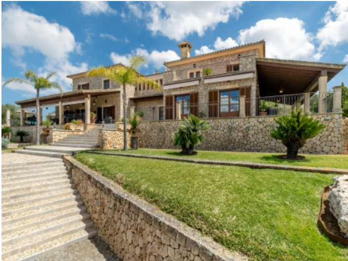
Exterior view of the stone finca