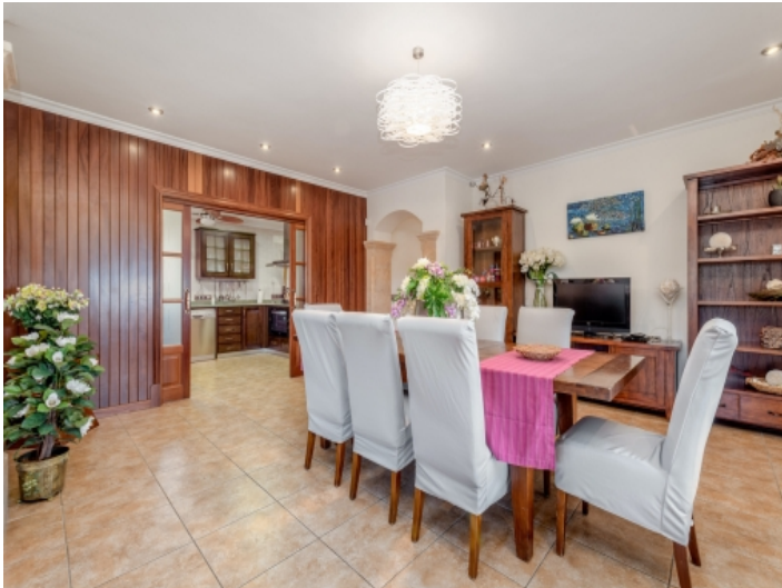
Large guest apartment