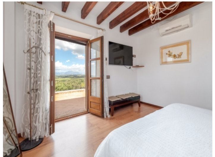
Direct terrace access