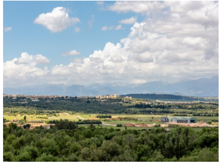
Sweeping views to the Sierra de Tramuntana