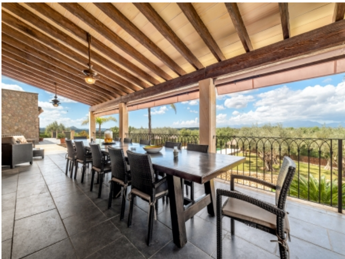
Large, covered outdoor dining area