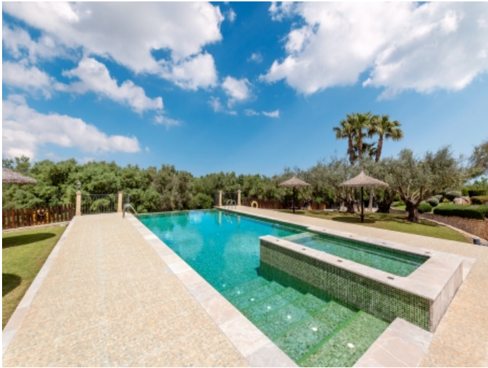
Beautiful, private pool