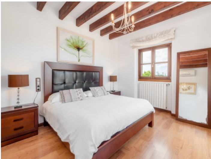
One of 8 bedrooms