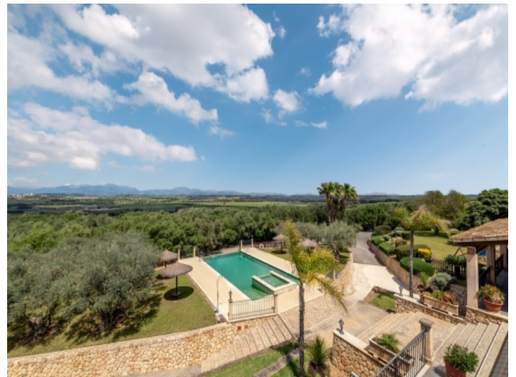
Fantastic panoramic views over the landscape