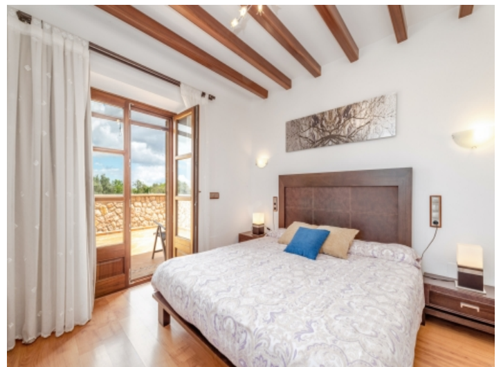
Bedroom with terrace