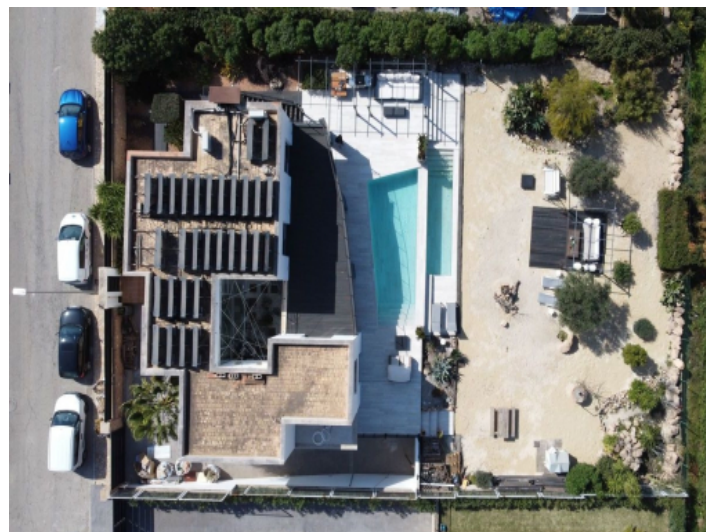
The villa from a birds-eye view