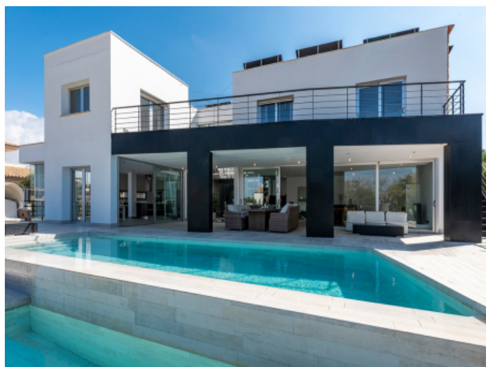
Ultramodern villa with pool in Sa Torre