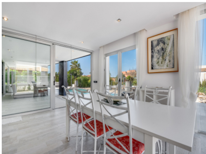
Lightflooded dining area with terrace access