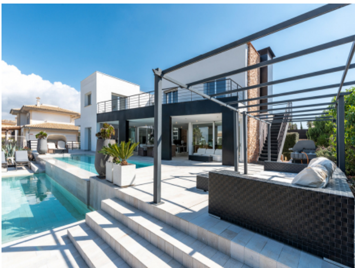
Pool terrace with various lounge areas