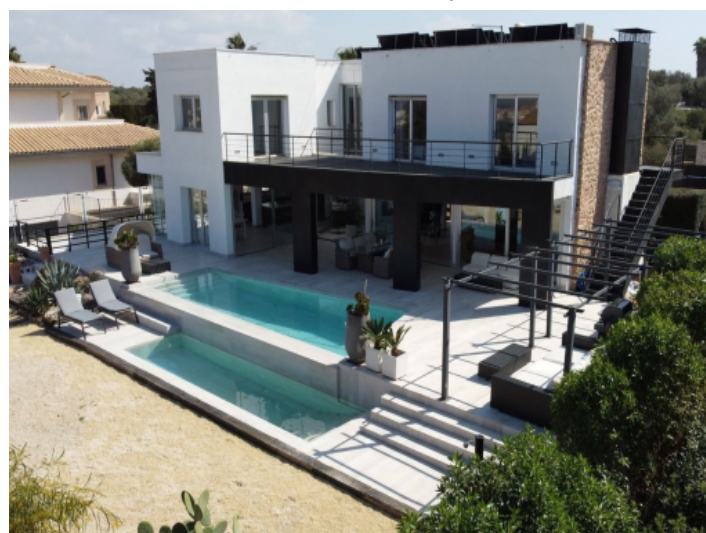
The villa from a birds-eye view