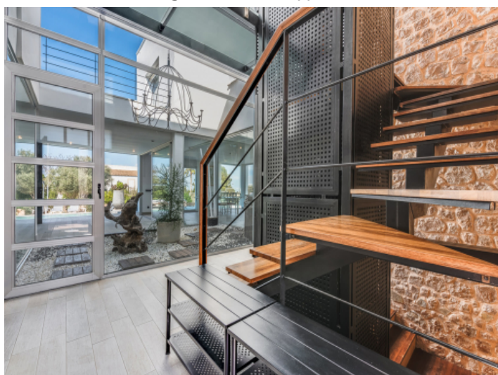
Entrance area with stairs, lift and patio