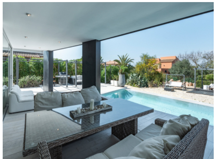
Covered lounge terrace