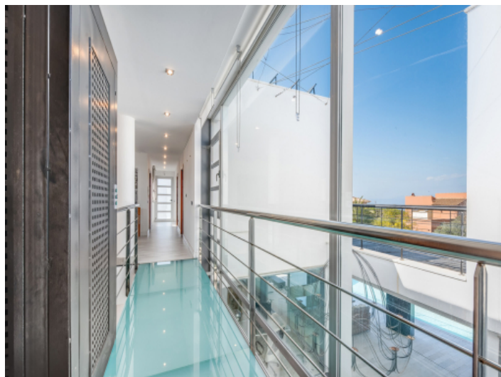
Stylish upper floor with lift