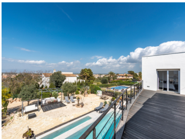
View from the upper terrace