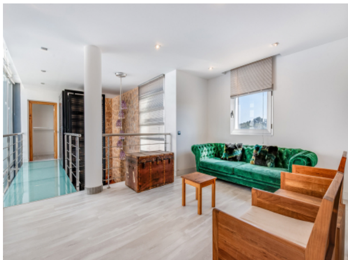
Lounge area on the upper floor