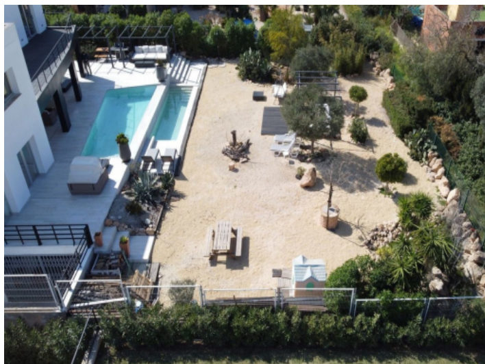
The villa from a birds-eye view