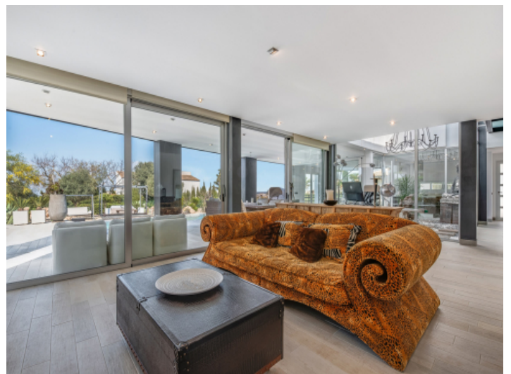
Living area with large window front