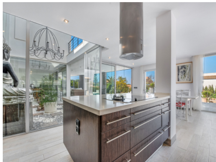
Open and modern kitchen