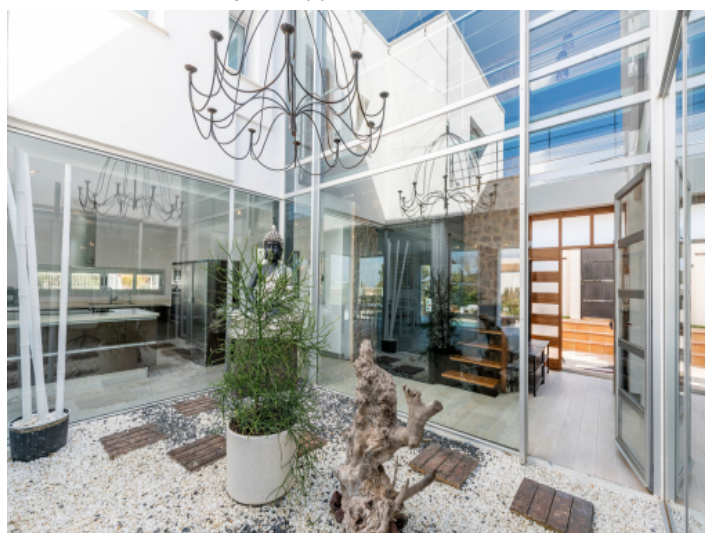
Modern, glassed patio