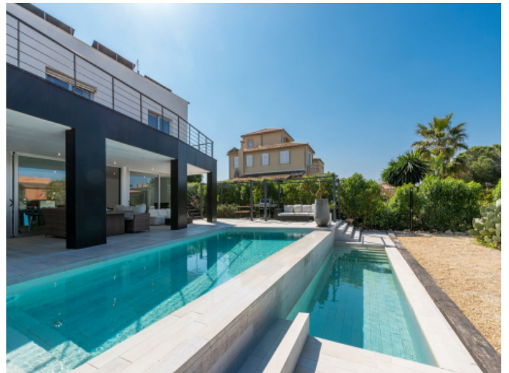
Pool area with 2 pools