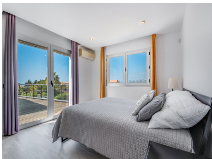
Double bedroom with terrace