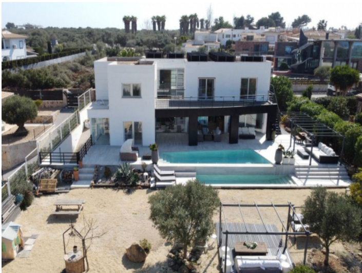
Ultramodern villa with pool in Sa Torre