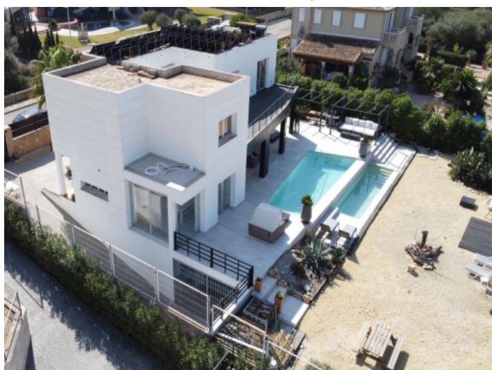
The villa from a birds-eye view