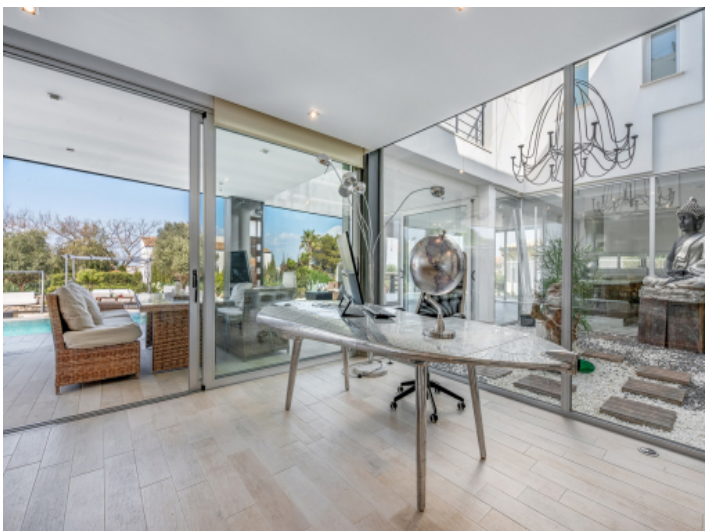
Stylish living area with glassed patio