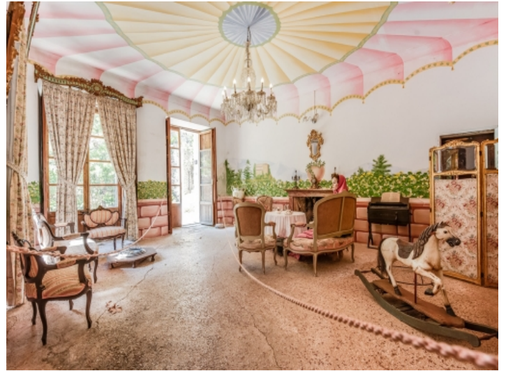
Old living room