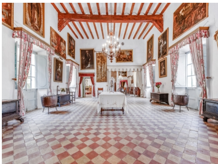
Old living area