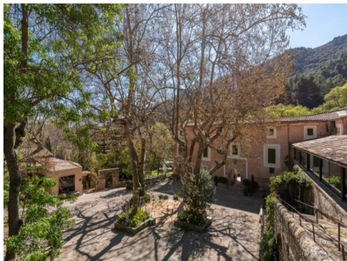
Square in front of the property