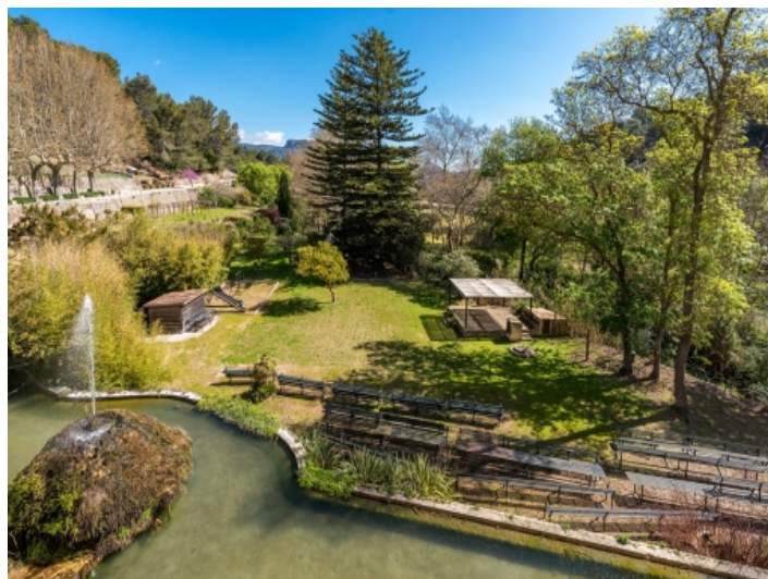
View over the garden