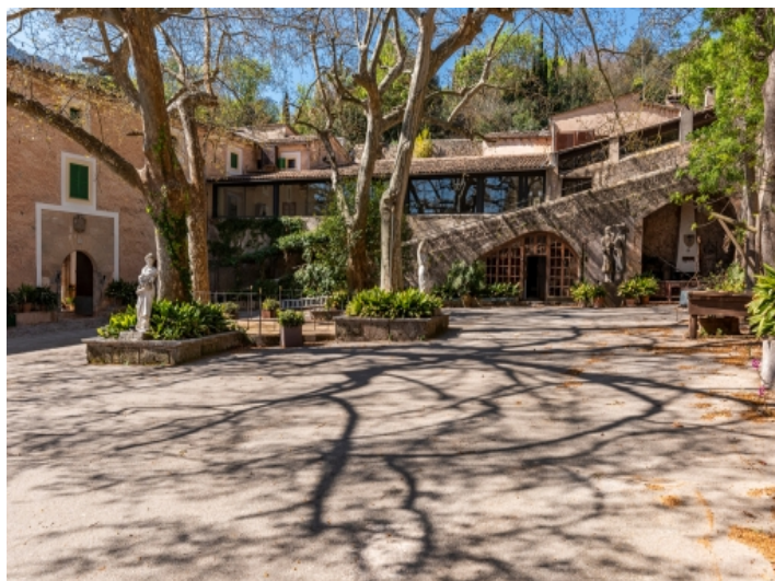
Entrance and square