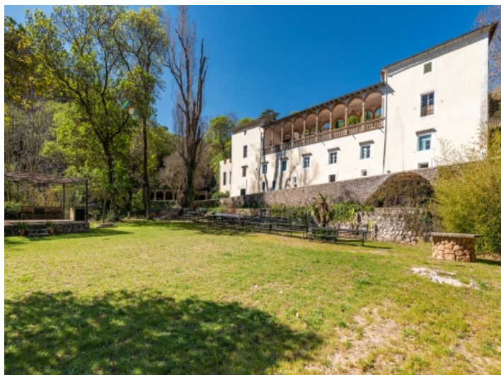
View from the garden