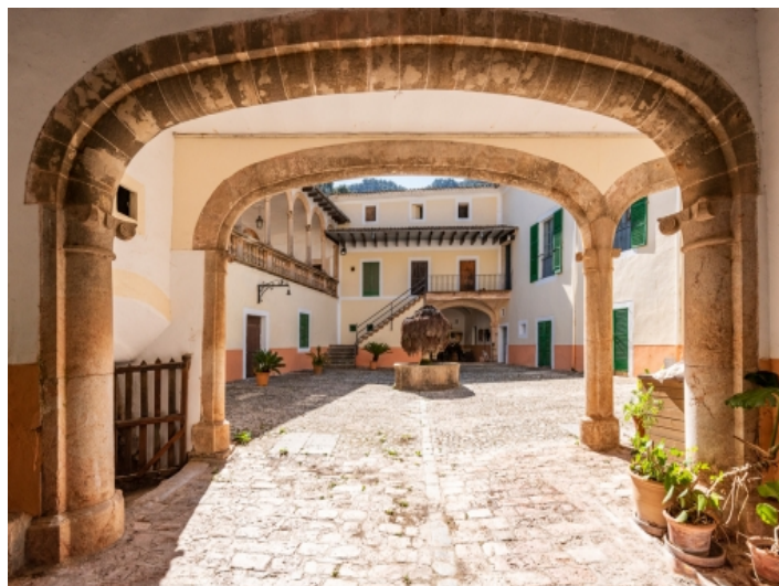
Access to the inner courtyard