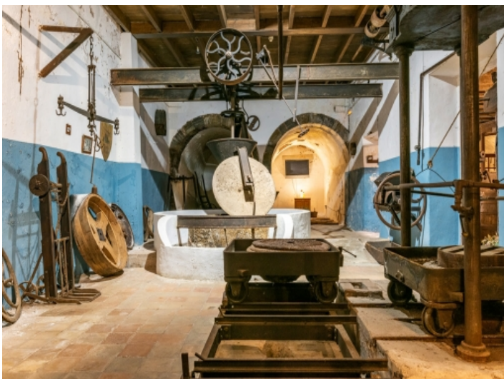
Old olive mill