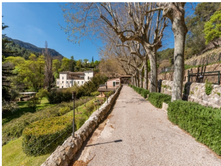
Access to the old farm