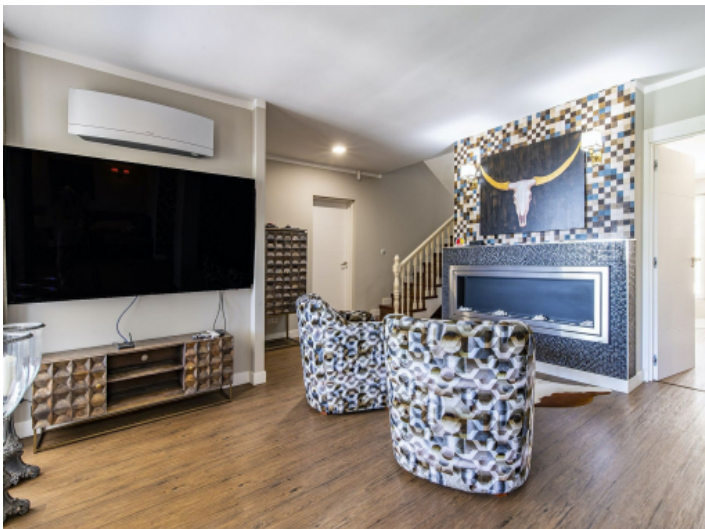
Elegant sitting area