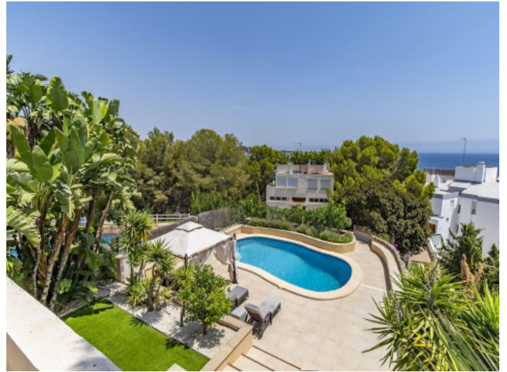
Magnificent outdoor area