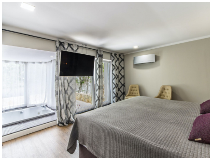
Bedroom with en suite bathroom