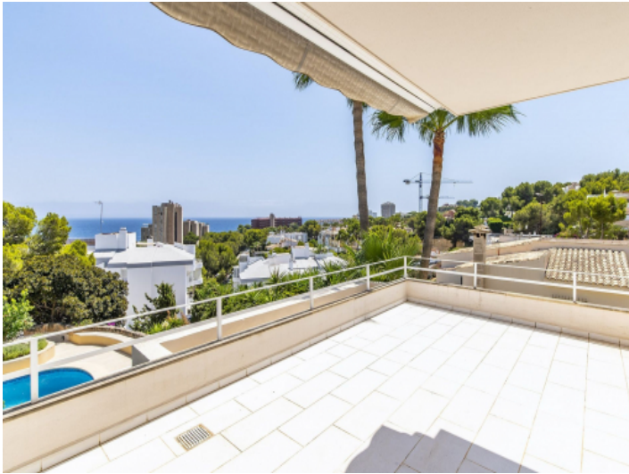
Covered terrace with superb views