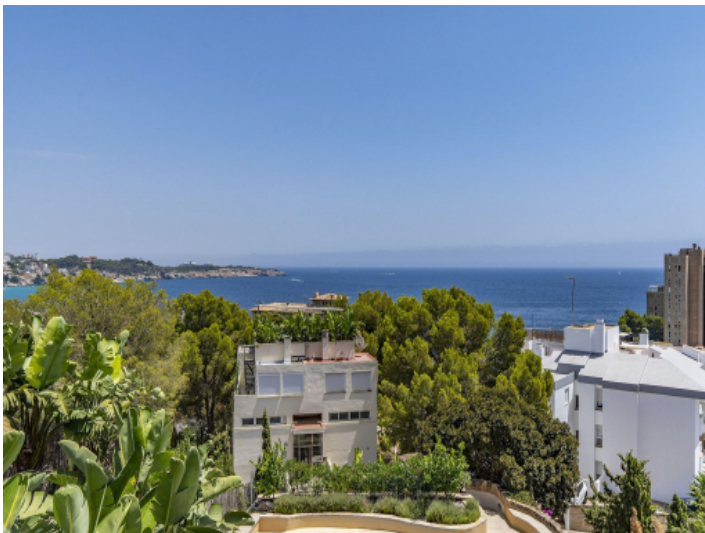
Splendid sea views