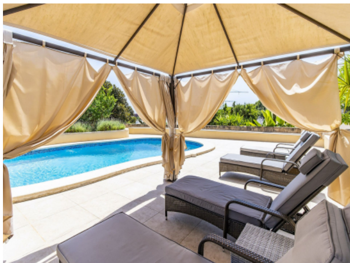
Fantastic pool area