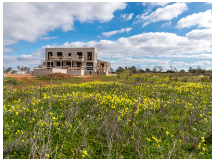
Plot and exterior view