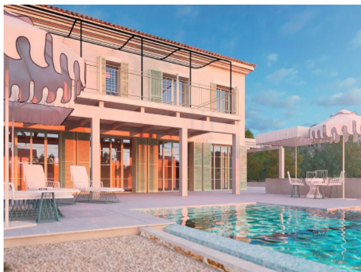
View to the pool area