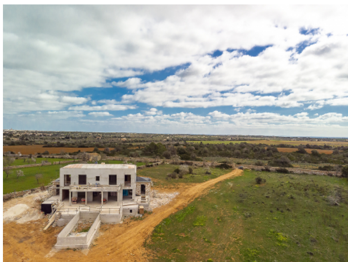
Finca from above