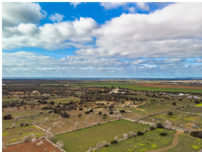
Panoramic sea views