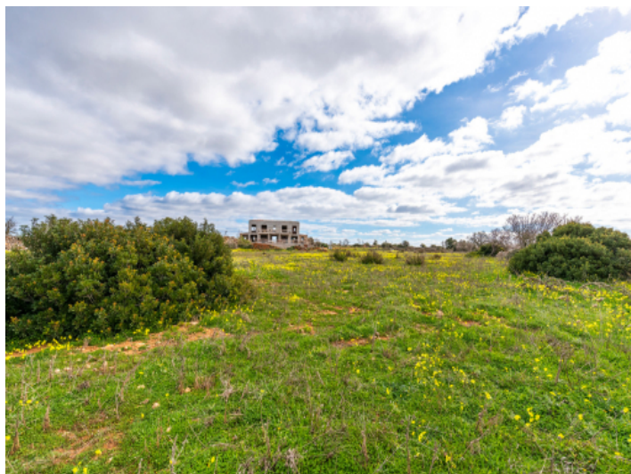
Plot and exterior view