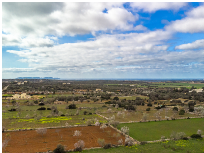
View as far as Cabrera