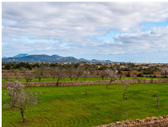
Plot with almond trees