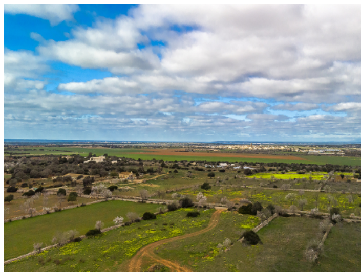
Sweeping views over the landscape