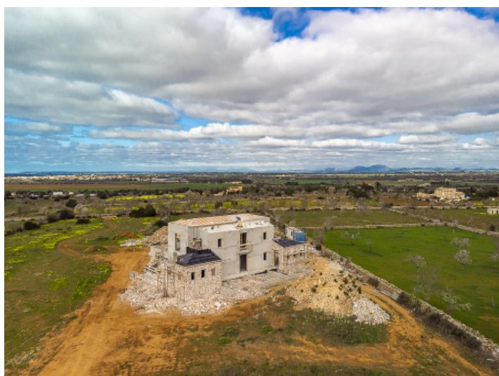
Finca from above