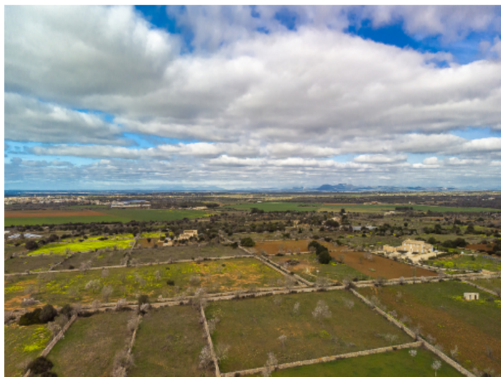
View as far as the Sierra de Tramuntana