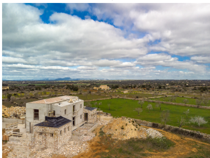
Finca from above