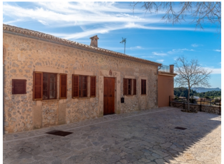
Front view and entrance to the house