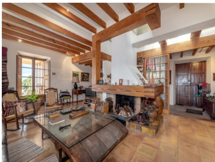
View to the rustic fireplace area