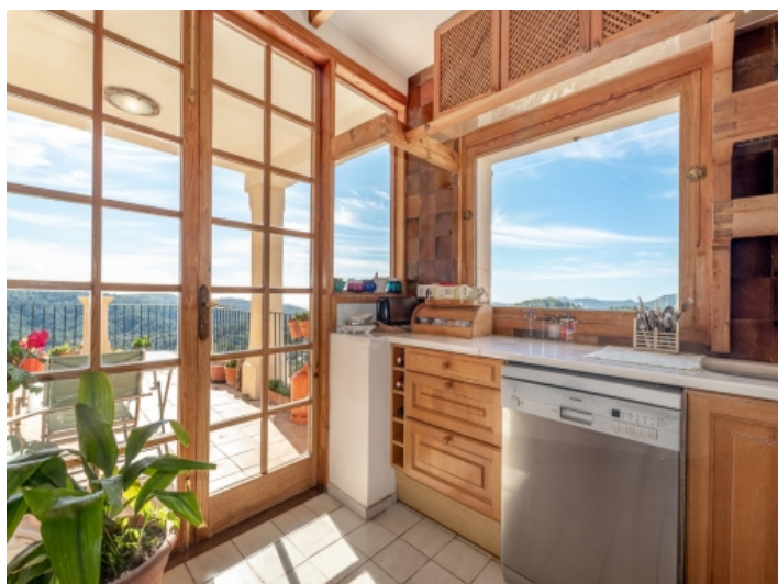
Access to the lovely terrace