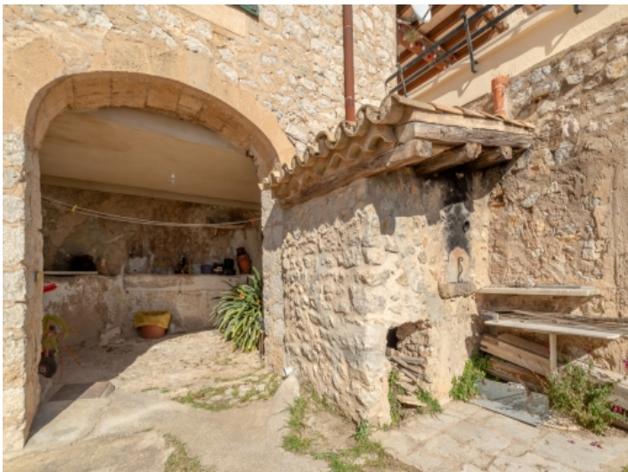
Outdoor area with stone oven