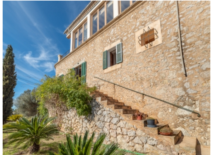
Outside stone stairs lead to the garden