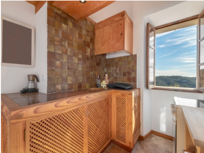
Small kitchen on the lower level