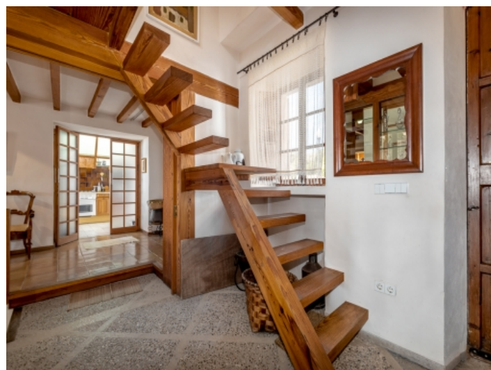
Wooden stairs to the upper floor