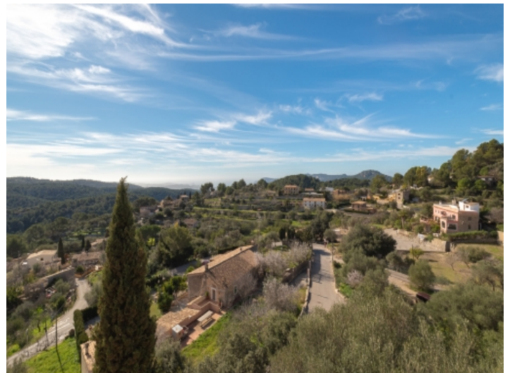
Idyllic landscape and mountains views