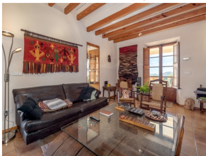
Living area with wooden ceiling beams