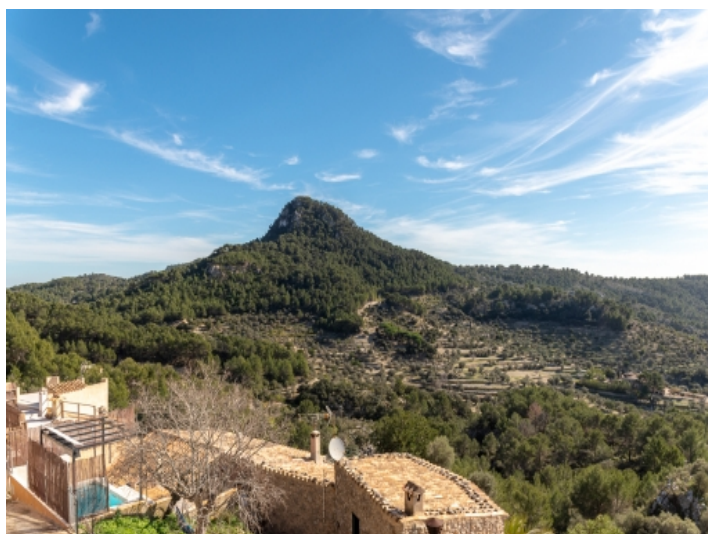
View to a small mountain