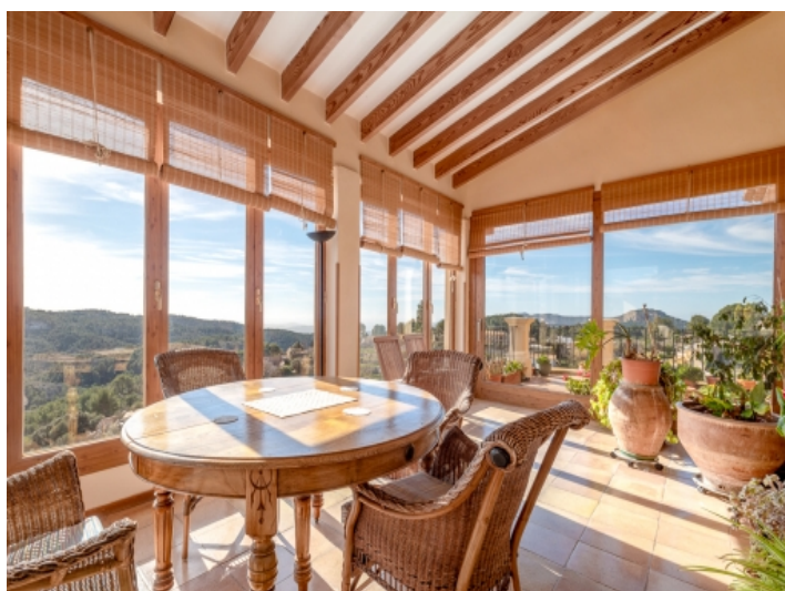
Lightflooded wintergarden with panoramic views