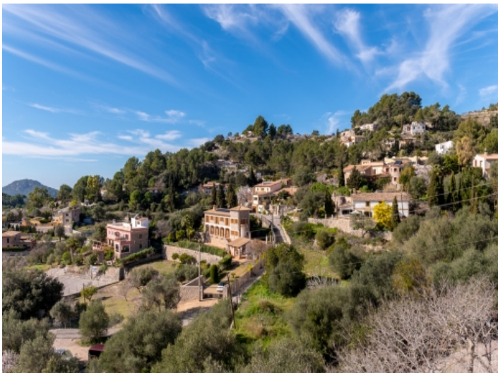
View over the town Galilea