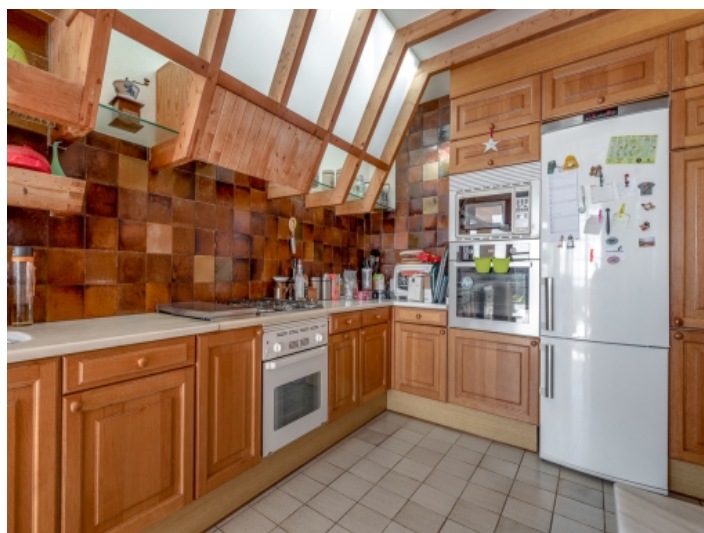
Spacious and fully equipped kitchen