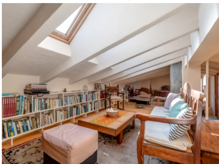
Cozy reading room on the upper level