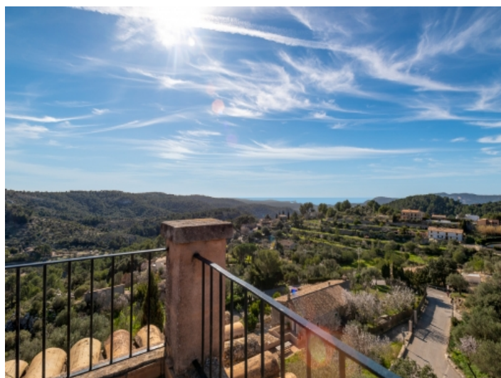
Terrace with fantastic sweeping views